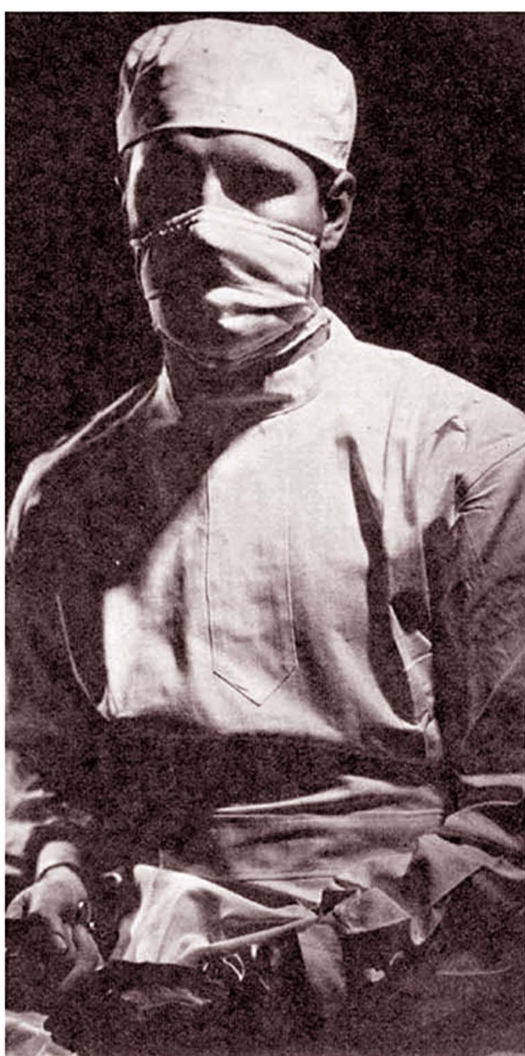
posed by professional models

Time Magazine reported a chain of abortoriums operating on the Pacific coast that did a million-dollar-a-year business until the human rats that ran the show were arrested.