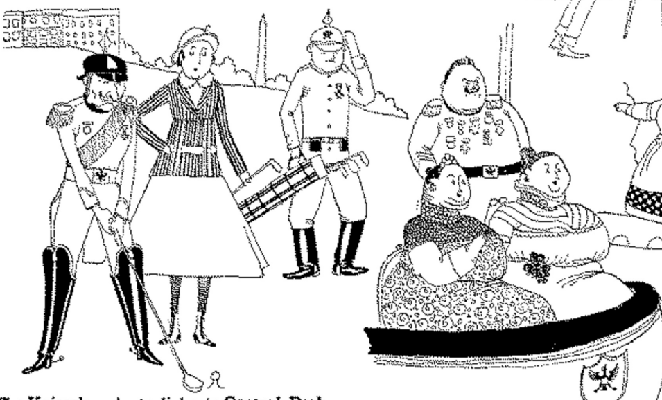
The Kaiser's private links in Central Park. The Art Museum and Obelisk left standing, for use as hazards