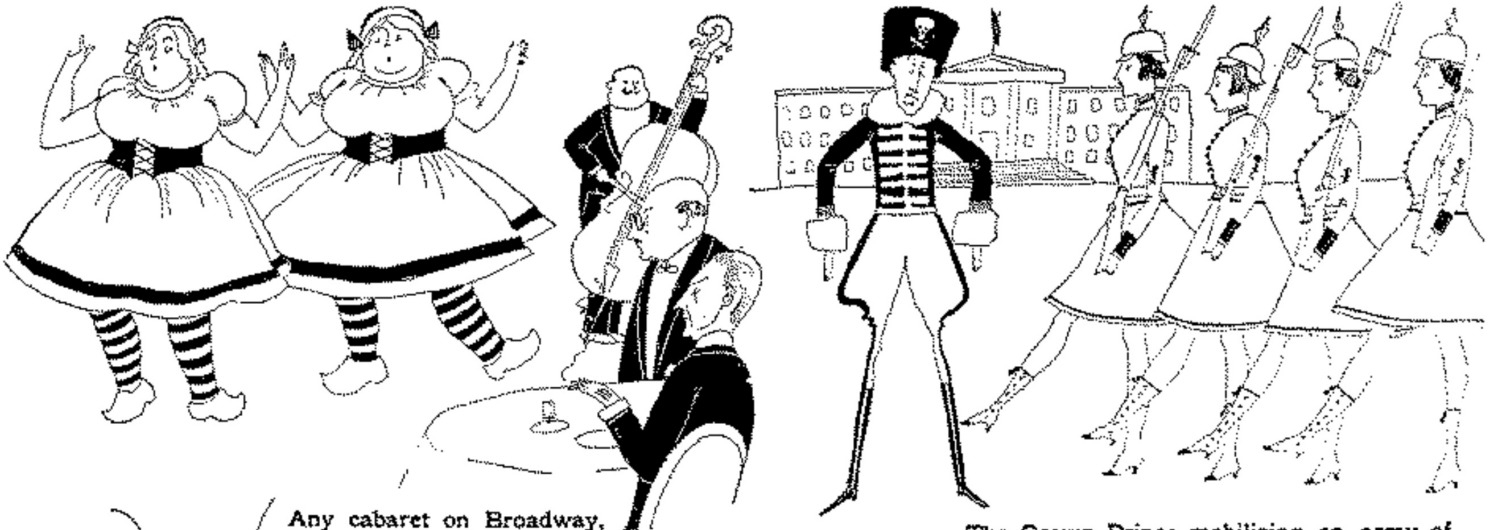
Any cabaret on Broadway, after the German occupation