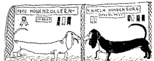
Winners at the West-Münster Hund Show