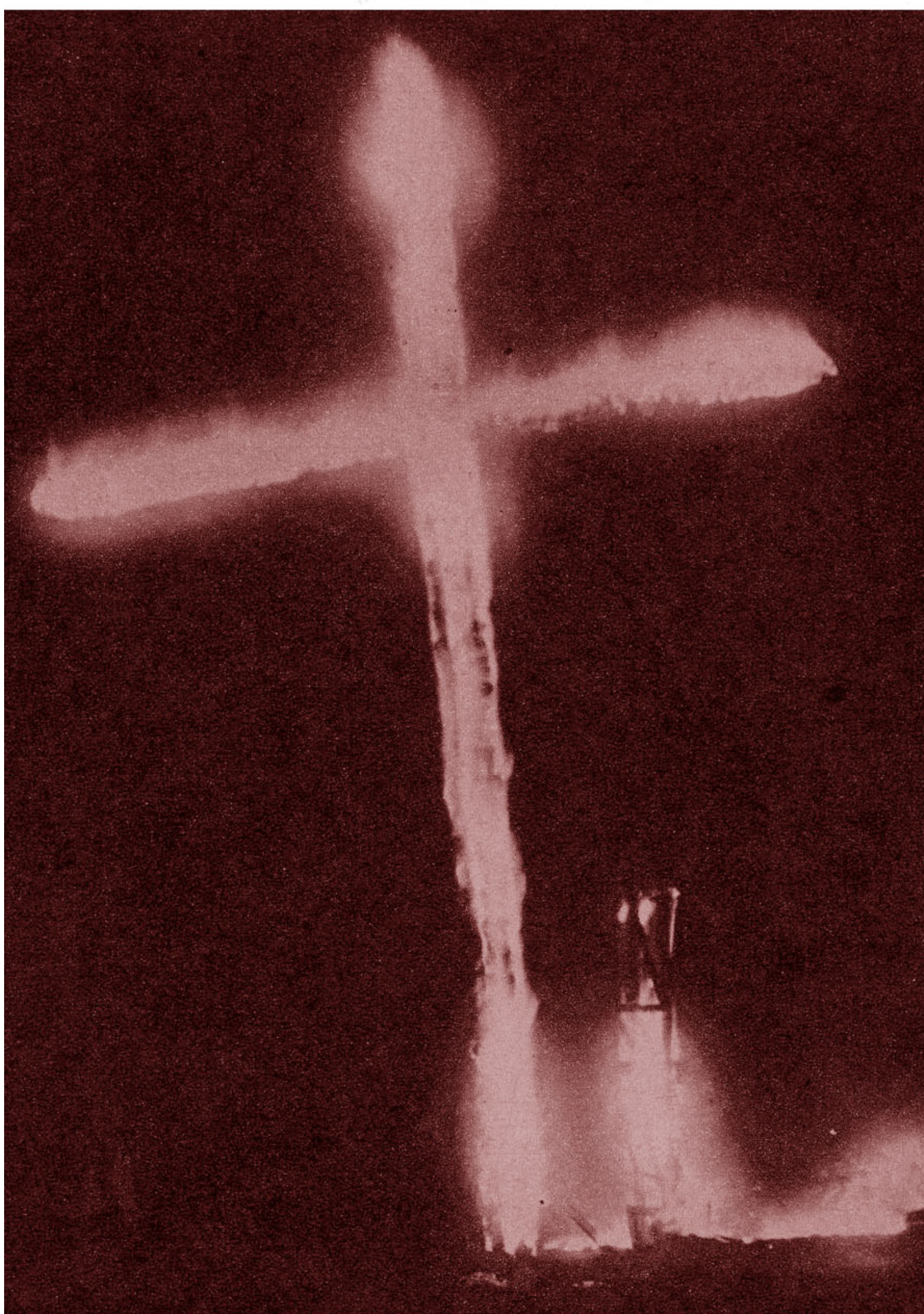
Flaming 100-foot high cross (above) marked the close of Freeport (N.Y.) Ku Klux Klansmen's first annual celebration. Hailed by 5,000 Klansfolk, sight was visible for miles.

Differing radically among themselves on other issues, prohibitionists, German-American beer-drinkers, Catholics, Protestants, cultists, rich people, poor people, white collar clerks and farmers are finding common ground, neverthe-