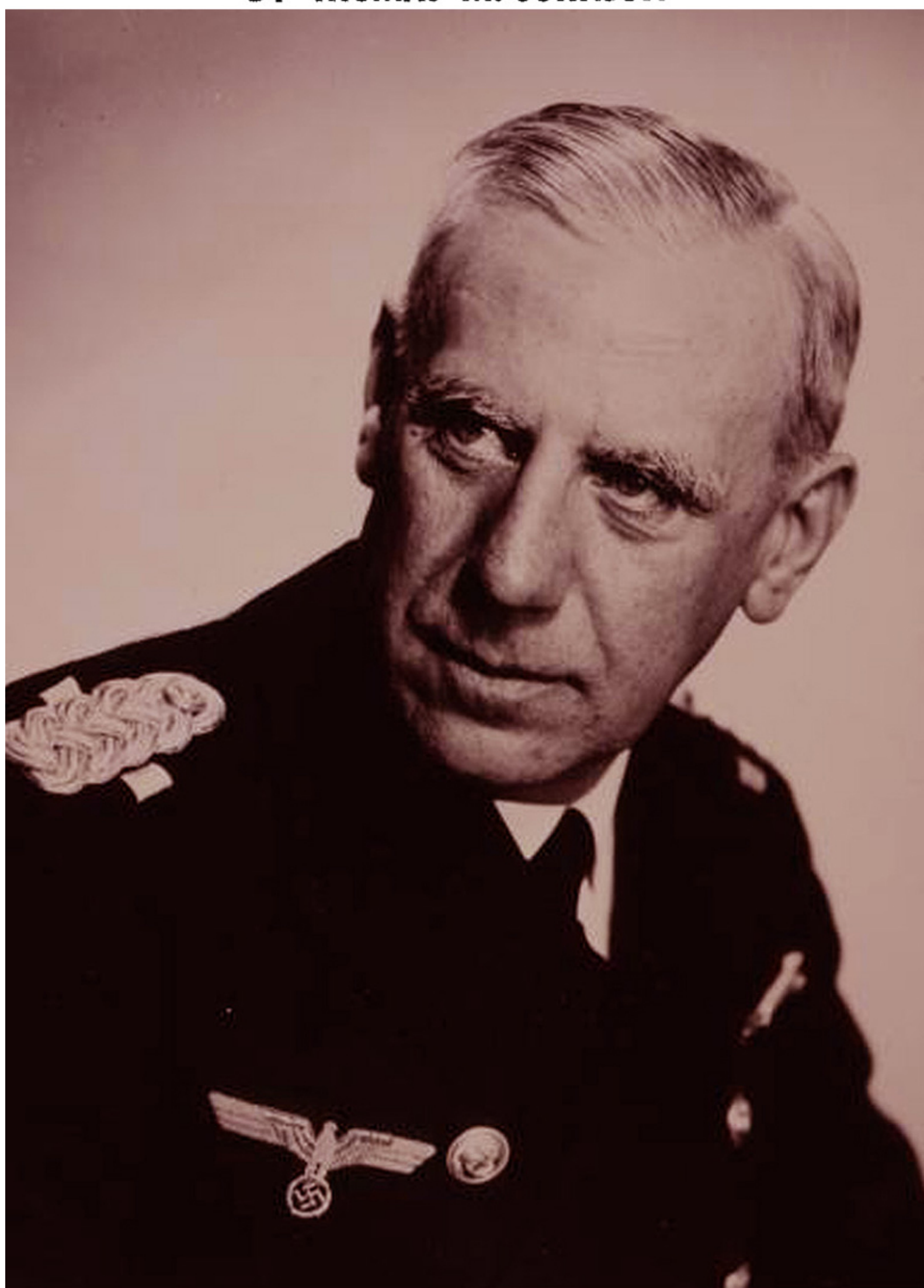
Master spy Canaris

T O her spies as much as to her arms does Germany owe her victories. German agents set the scene for the tragedy of France. German spies picked and rehearsed the Quislings for their rôles in Norway, Belgium, and Holland. German armies, air fleets, and U-boats have struck with a timing that showed they had full information from behind enemy lines. German espionage has done the best job any spy organization ever did for a nation bent on conquest. The man who spun most of this world-wide web and now sits at its center certainly is the world's master spy. He is perhaps the ablest that has ever afflicted the world. Yet he is all but unknown.