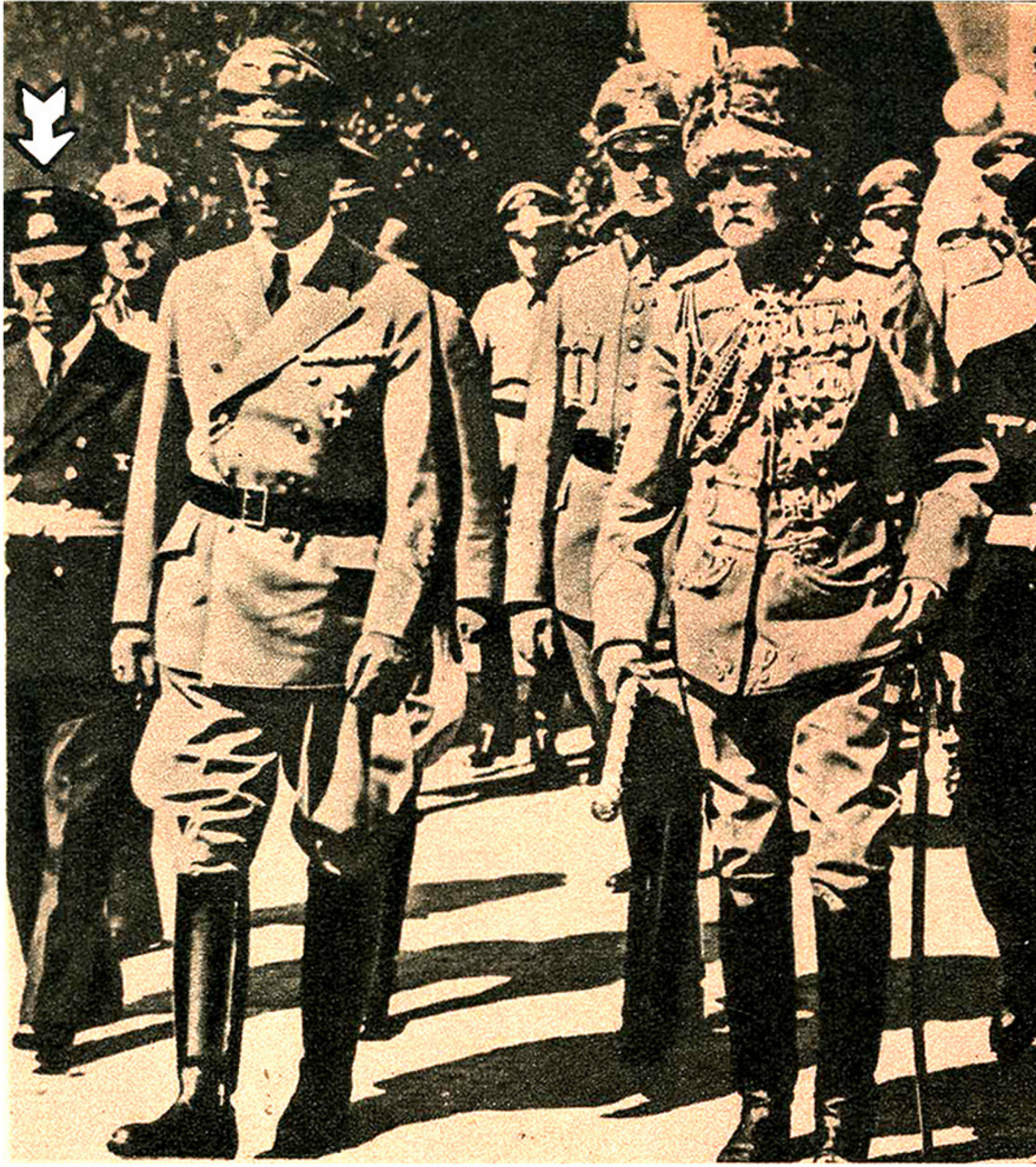
Canaris in the former Kaiser's funeral procession at Doorn. Intentionally inconspicuous, as always, he is the little admiral at left, whom the arrow points out. The two in front are Dr. Arthur Seyss-Inquart and the aged General von Mackensen.