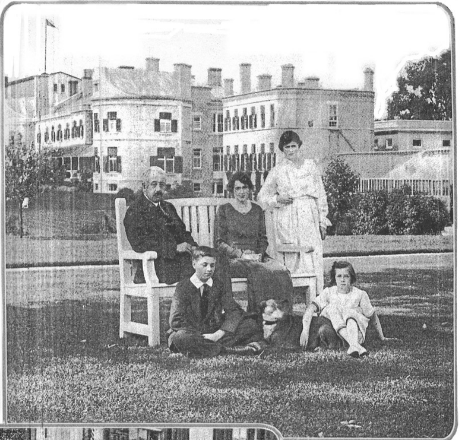
First among the distinguished persons who entertained the royal English Prince during his stay in Ottawa was, of course, the Duke of Devonshire, Governor-General of Canada. He is seated on the lawn before the Government House with Lady Dorothy, Lady Rachel, Lady Anne, and Lord Charles