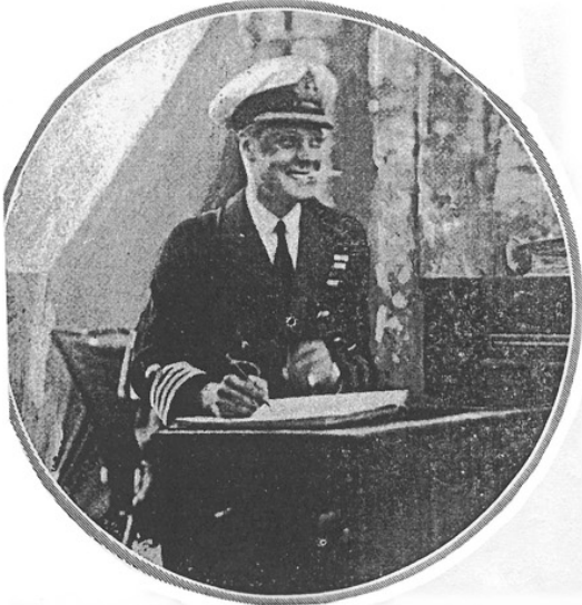
The Prince of Wales, with an air of one well contented with his surroundings, signed the guest's register at the Studley Quoit Club in Halifax