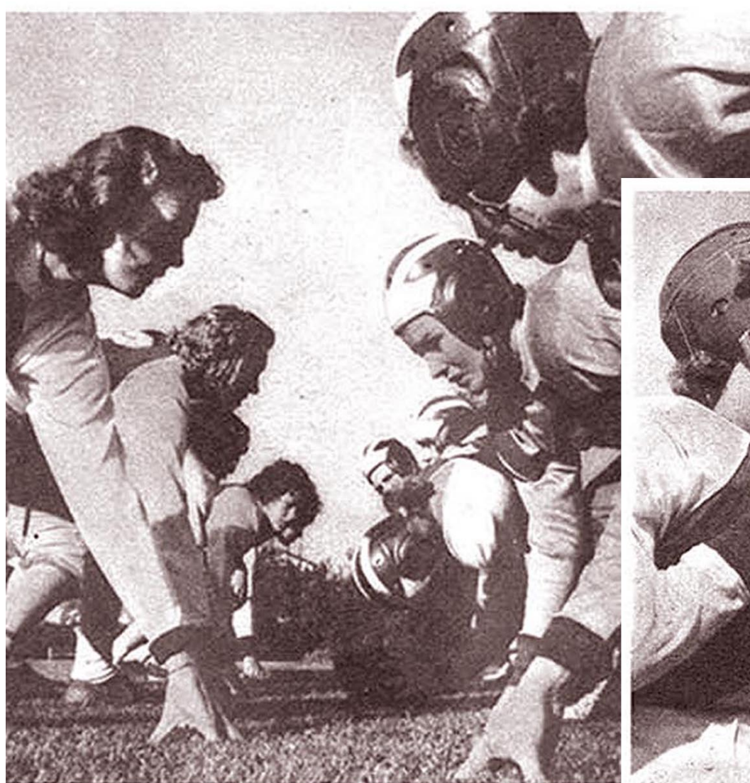
RIVAL TEAMS from Los Angeles and Hollywood line up. The players wear special sponge-rubber chest protectors. The girls are good at blocking out interference and tackling, though a bit shy on making shoe-string catches.

A NYTHING can and does happen in California, the proving ground for all sorts of fads and fancies. The latest craze sweeping the land of Ham-and-Eggers is girls' football. Discarding their all-revealing bathing suits, Hollywood and Los Angeles lassies have taken to padded moleskins, hip pads, shoulder pads, head gears and rubber-cleated brogans. The transition from beach nymph to gridiron amazon is called a revolution against "oomph" in the capital of streamlined pulchritude. In fact, followers of the wasp-waist corset openly declare it is a dastardly plot against their campaign for the revival of the hour-glass figure. But regardless of what feminists say, powder puff football seems destined to stay. The girls play hard, fast and for keeps, as the picture above attests. They suffer bumps, bruises, bloody noses and scratches, but they always come up for more. The game has become so popular that teams have been formed in Santa Barbara, Pasadena and San Diego. By next fall the lassies expect to have leagues operating throughout the country.