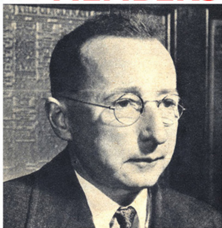
LAURENCE TODD TASS, U.S.S.R. NEWS