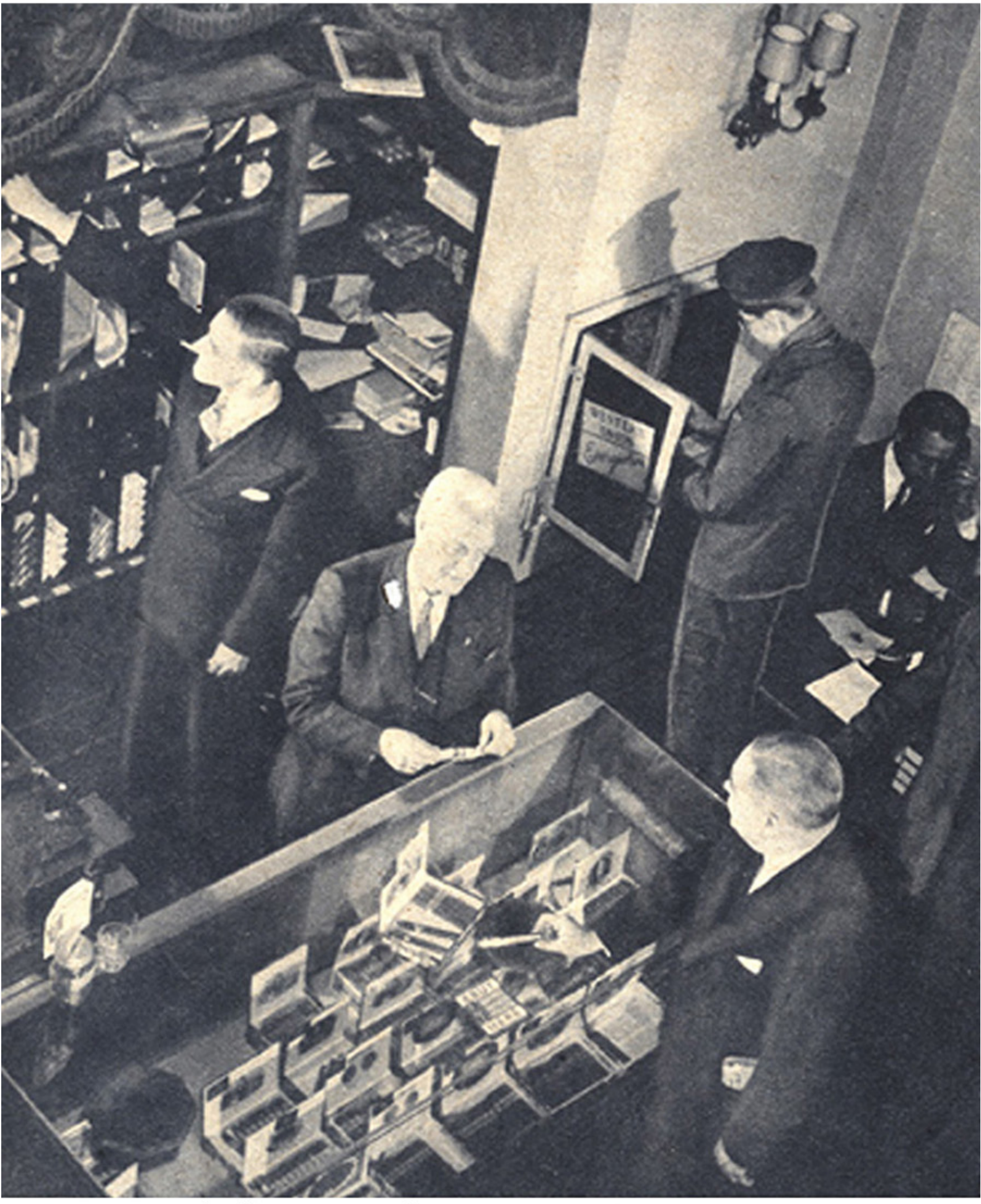
THE ENTRANCE to the Press Club has a switchboard so that the operator on duty can note who goes in and out. He also handles personal calls for busy newspapermen. The assistant manager (taking the mail out of a box) usually stands by the entrance to keep non-members from crashing the club rooms.