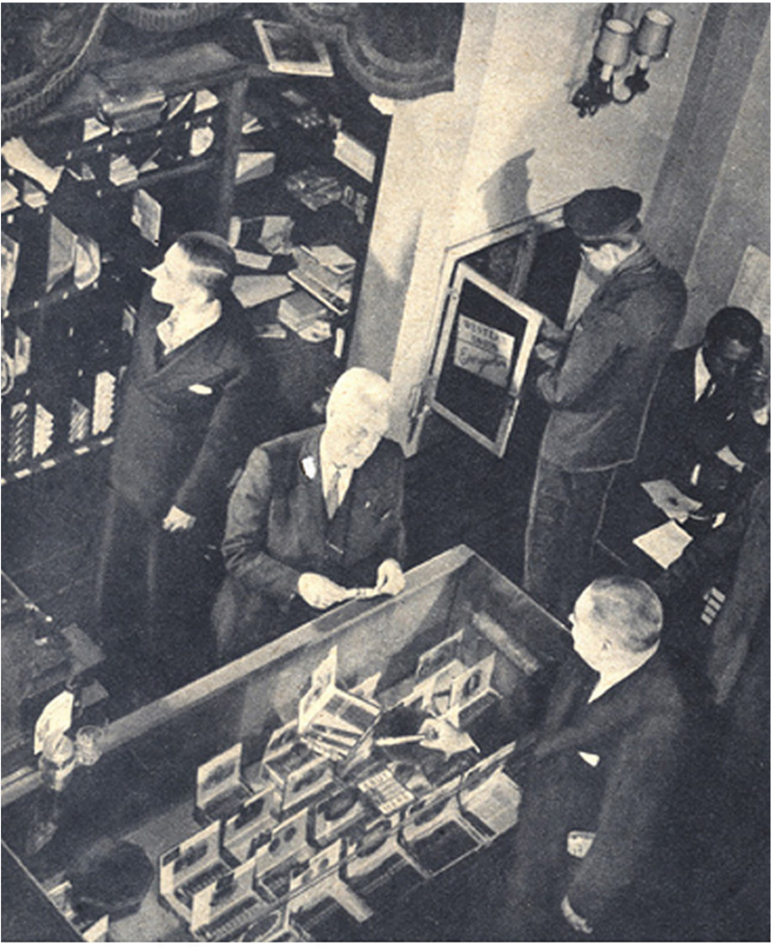
THE ENTRANCE to the Press Club has a switchboard so that the operator on duty can note who goes in and out. He also handles personal calls for busy newspapermen. The assistant manager (taking the mail out of a box) usually stands by the entrance to keep non-members from crashing the club rooms.