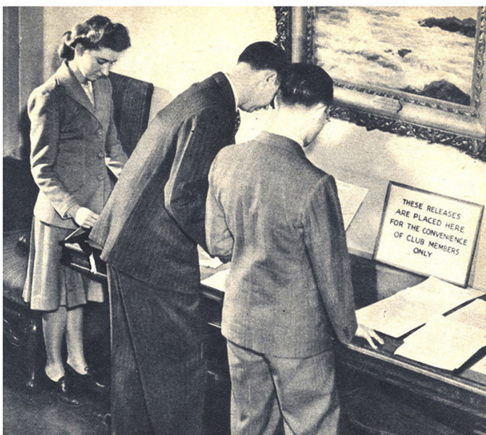
PRESS RELEASES from private and governmenta sources are available to club members. They are placed daily on a table near the entrance. Most of the newspapermen ignore them because they prefer to dig up their own stories.