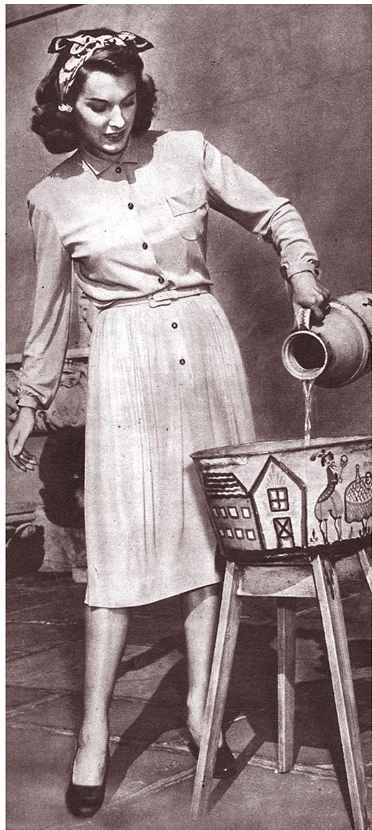
AT LEAST ONE YARD OF JERSEY was saved in cutting this rayon classic. Slight gathers, front and back, achieve a dirndl effect without using excess yardage. Under the new L-85 apparel ruling a dress can utilize only cloth needed for basic silhouette (specified for size) and cloth to cover trimmings (limit—700 square inches of non-transparent fabric).