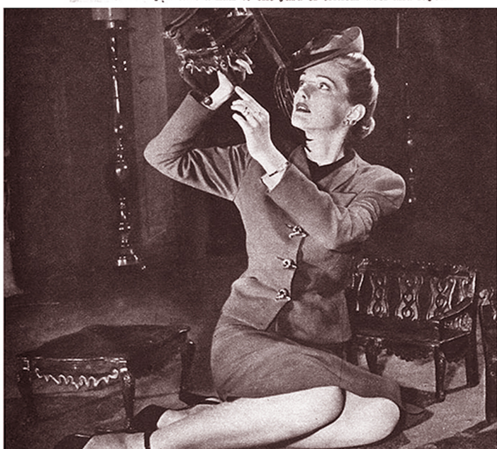
THIS CIGARETTE-SLIM SUIT DRESS conforms to the L-85 regulation permitting no more than two pockets and one collar or single revers. Collarless and with a flap detail that simulates a four-pocket arrangement, this design saves one yard of wool. By using a scarf in place of the blouse, plastic instead of metal buttons, and a sheath-like skirt, it helped conserve manpower and materials.