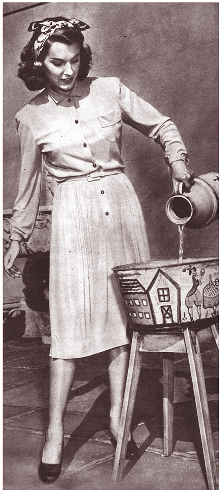
AT LEAST ONE YARD OF JERSEY was saved in cutting this rayon classic. Slight gathers, front and back, achieve a dirndl effect without using excess yardage. Under the new L-85 apparel ruling a dress can utilize only cloth needed for basic silhouette (specified for size) and cloth to cover trimmings (limit—700 square inches of non-transparent fabric).