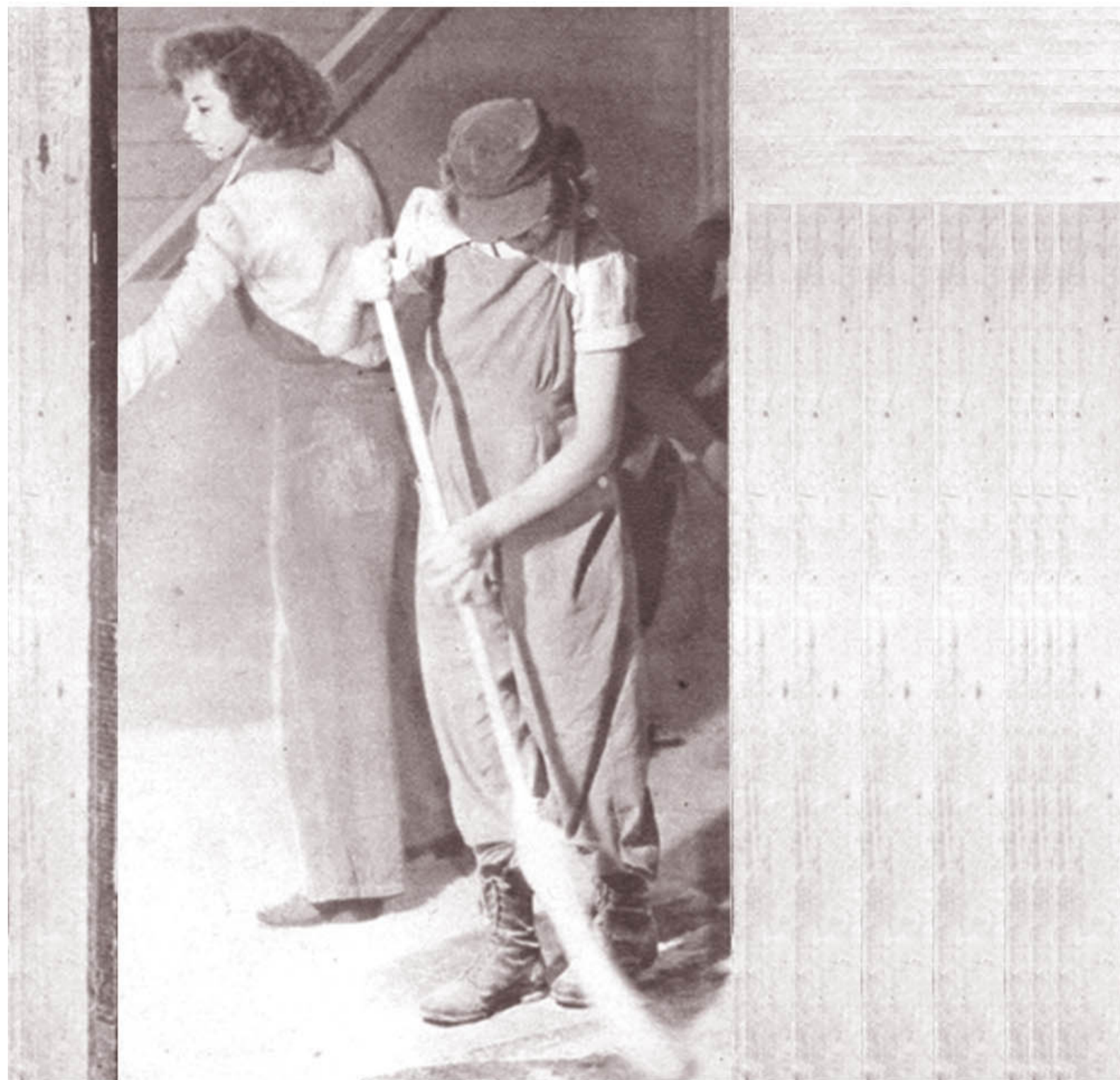
MIXING FEED FOR THE ANIMALS is gruelling work. Putting aside feminine egos while on the job, farmer aides must wallow in swine pens, run manure spreaders, curry beasts, clean troughs and whitewash barns. Long fingernails are cut short but girls usually insist on polish.