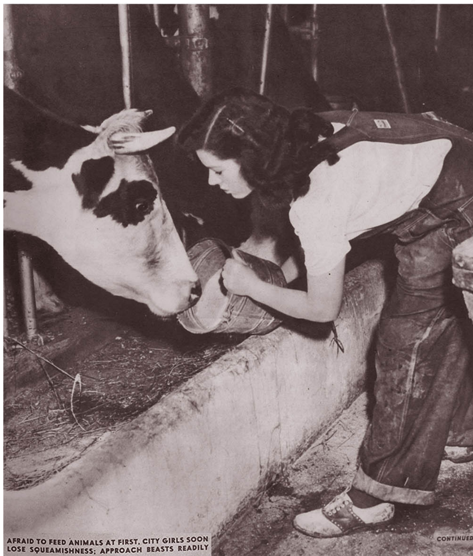
AFRAID TO FEED ANIMALS AT FIRST, CITY GIRLS SOON LOSE SQUEAMISHNESS; APPROACH BEASTS READILY