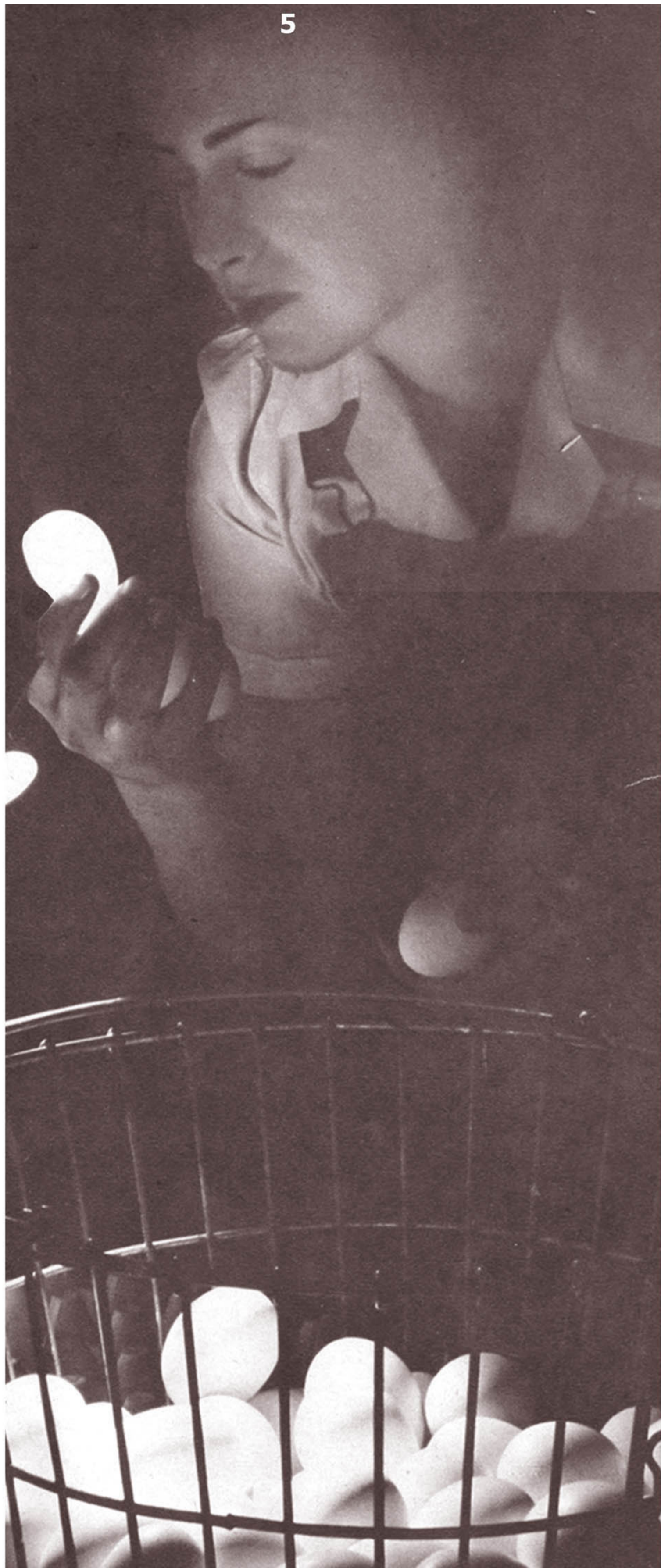
RIGHT: CANDLING. crating and grading eggs requires the delicacy and conscientious effort that the frailest girls can do well.