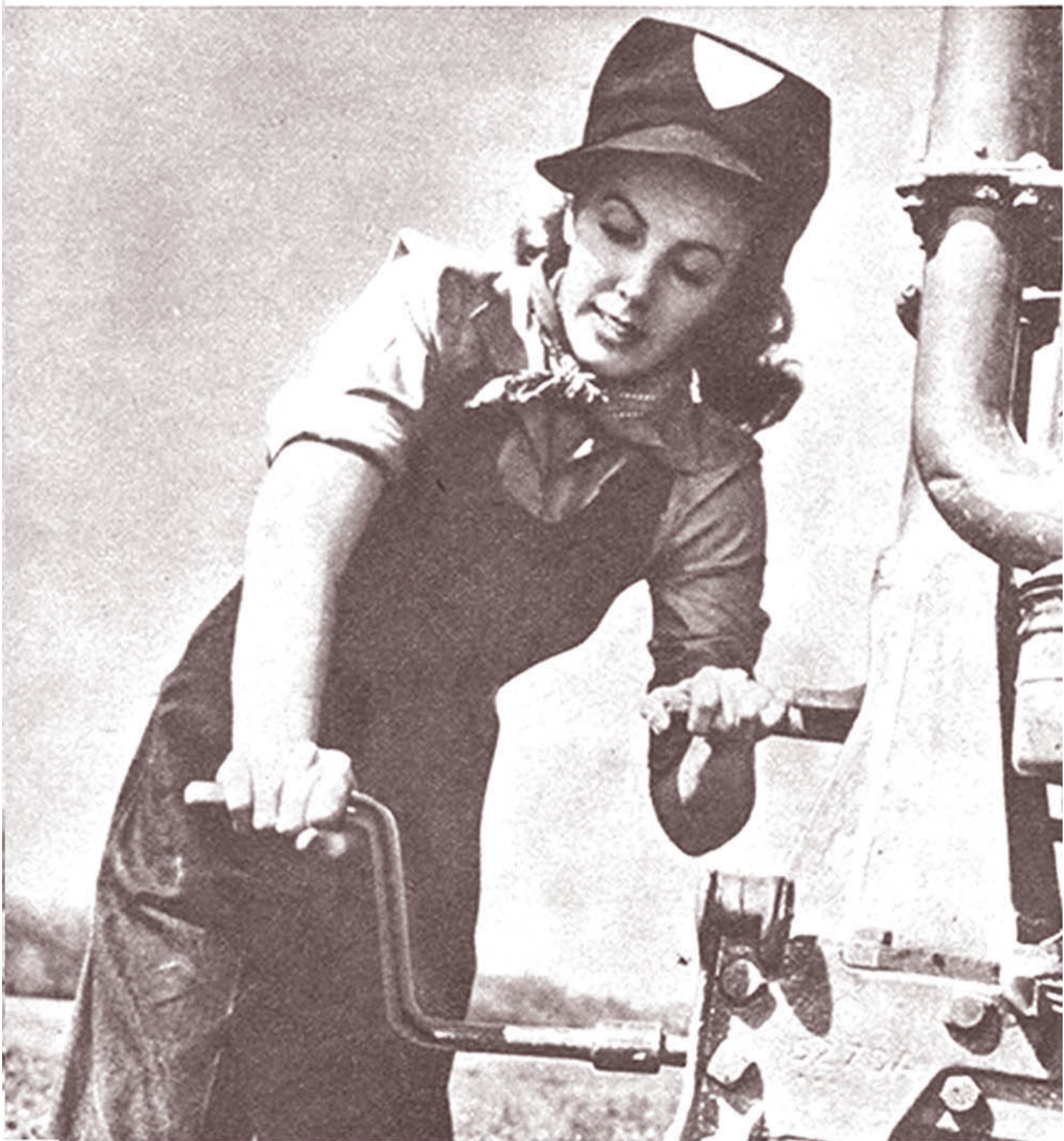
WHEN A TRACTOR STALLS, land army women must do their own emergency repairs. Trained to service heavy farm machinery, these feminine farm helpers are excellent for work requiring manipulative speed and finger dexterity. They are proving themselves well-fitted for almost any man-sized farm job.