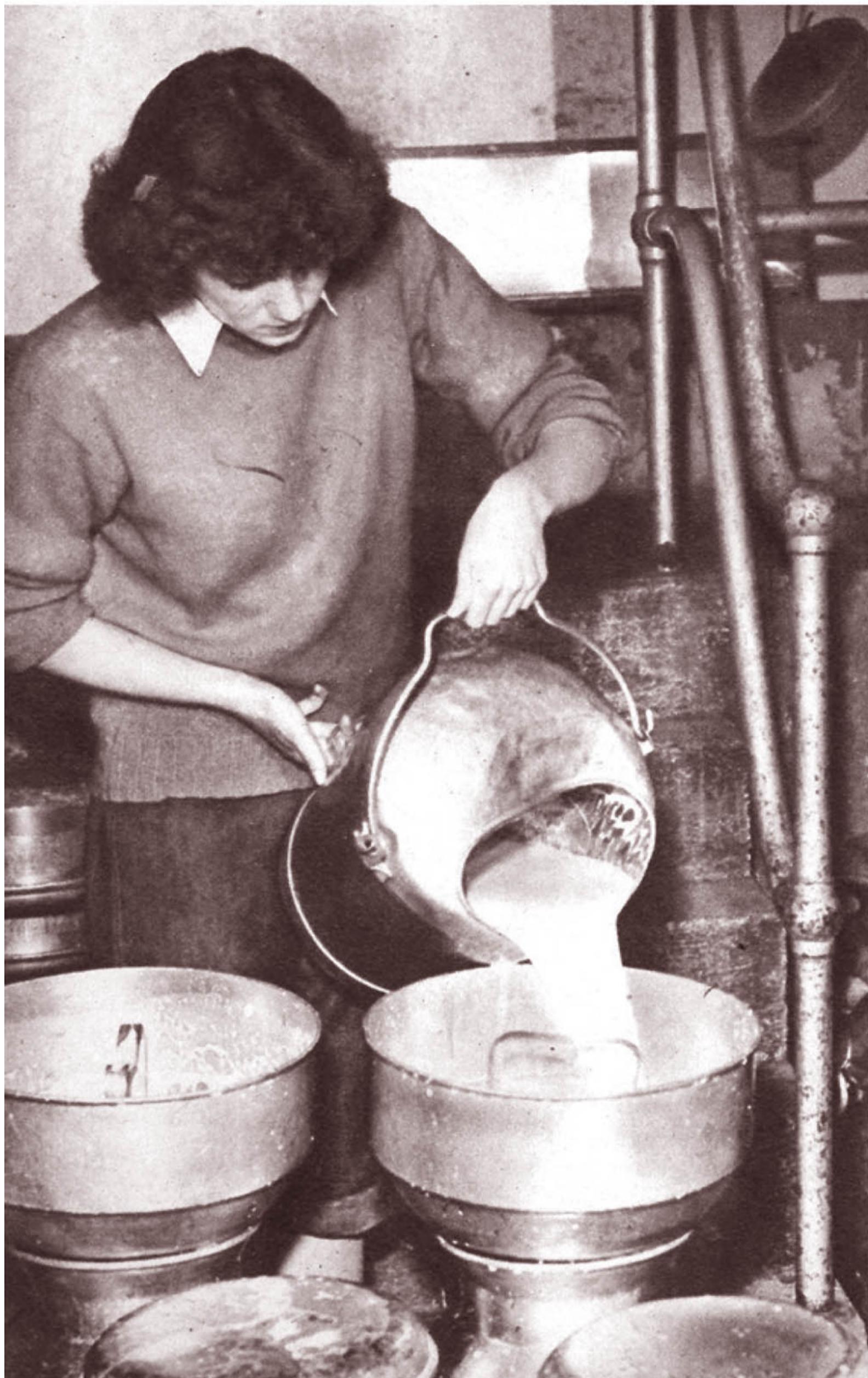
DAIRY DUTIES BEGIN AT 4:30 every morning. After cows are milked (either by hand or machine) farmer aides weigh and record pound-age per animal. Milk is then poured through a strainer, as below, and kept in huge cans until ready for the pasteurizer in background.