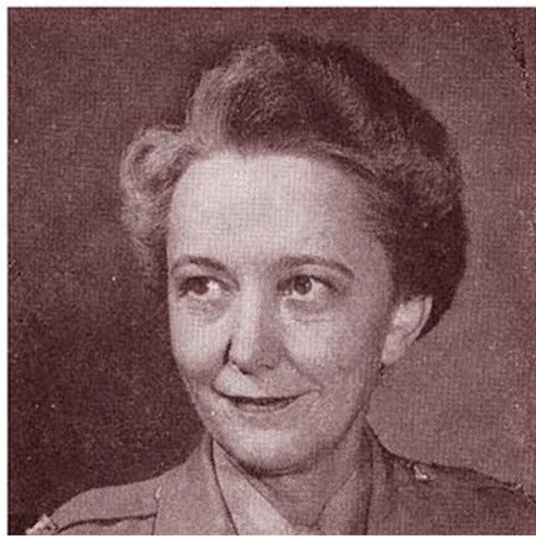
COL. WESTRAY BATTLE BOYCE, Dir., Women's Army Corps, 1945-

W OMEN soldiers, nearly 100,000 strong, established a proud record during the long years of war, serving everywhere throughout the regular Army except in actual combat and performing their duties in every theater of conflict from North Africa to the Pacific.