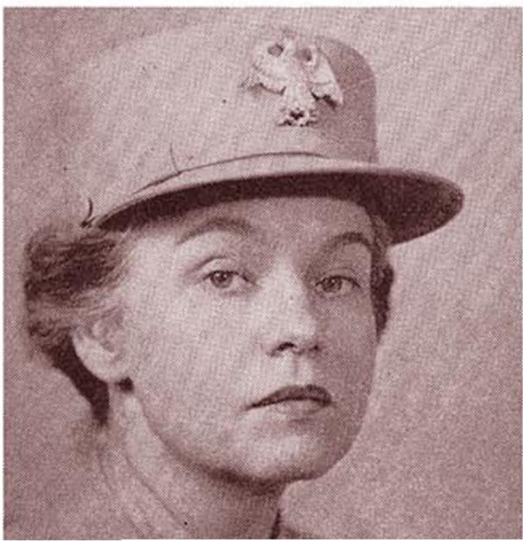
COL. OVETA CULP HOBBY, Dir., Women's Army Corps, 1942-45.