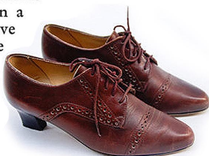
WAAC class-B Uniform shoes

Some were translators, some photographers, some mimeograph operators. Others served with the Transportation Corps and still others were medical assistants.