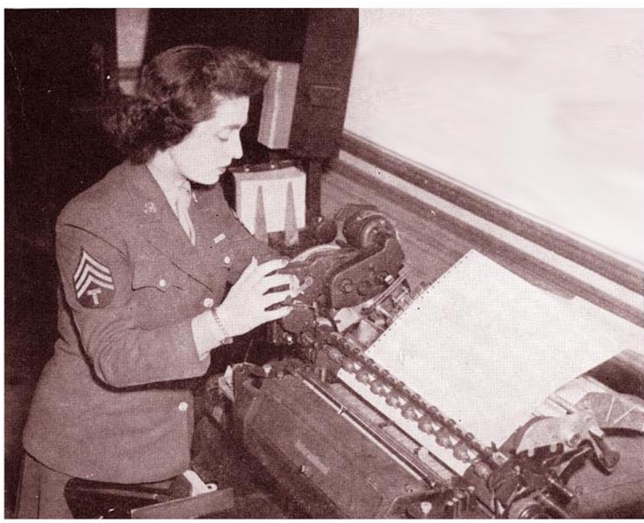
Left: WACs skilled in operating business machines help do Army paper work . . . Here ammunition statistics are compiled.

The jobs which members of the WAC filled overseas were, of course, akin to tasks which they also did within the continental United States. And there was little from which they were excluded by virtue of their femininity.