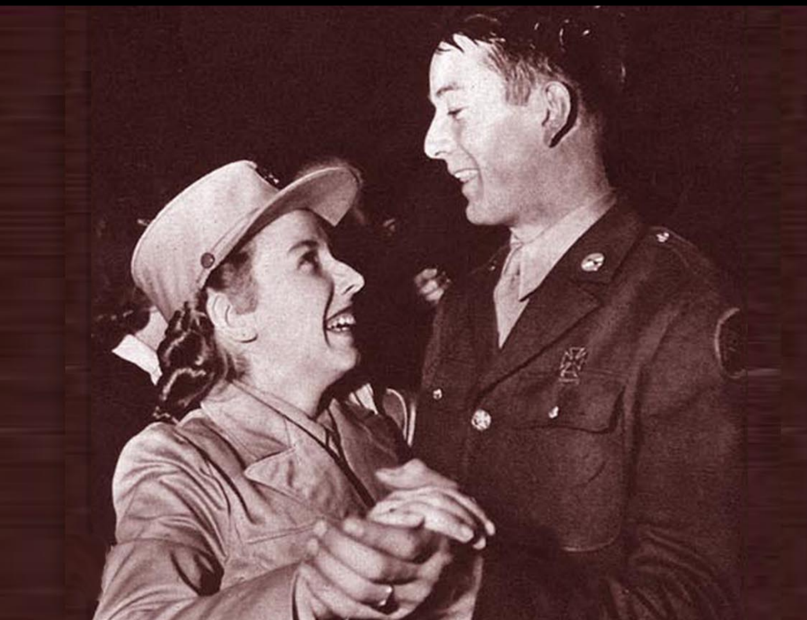
SATURDAY NIGHT DANCES attract WAACS and servicemen from more than 150 miles away. Sponsored by the local Chamber of Commerce, "hops" are held in the Military Service Club where 10-cent admission fees pay for an eight-piece orchestra. Female M. P.'s see that the girls make 1:30 bedcheck.