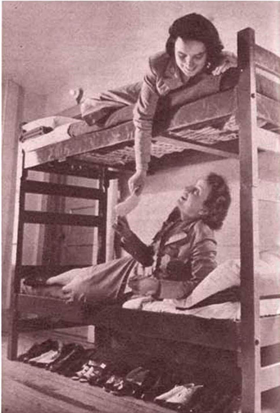
DOUBLE-DECKER BEDS were moved into Daytona's best hotels to make room for Uncle Sam's female military corps. Lucky WAACS bunk as above; the overflow takes quarters in Tent City area.