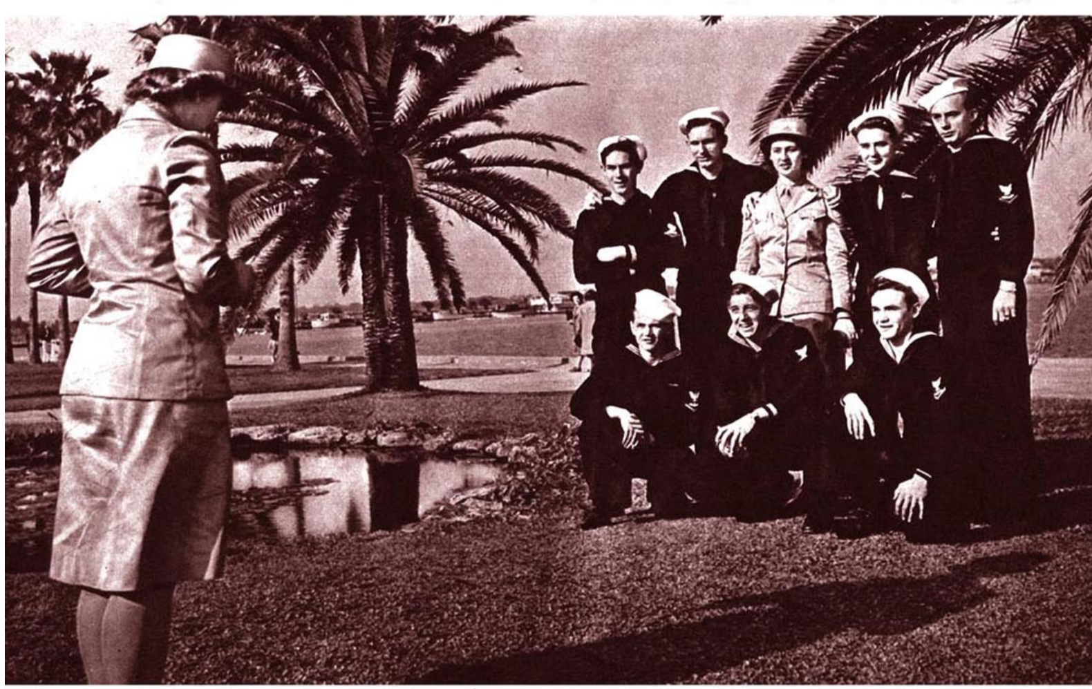
ARMY AND NAVY GET ALONG FAMOUSLY AT DAYTONA! THIS TYPICAL GROUP MET ON SUNDAY TO TELL IT TO THE MARINES—AND TO THE FOLKS BACK HOME