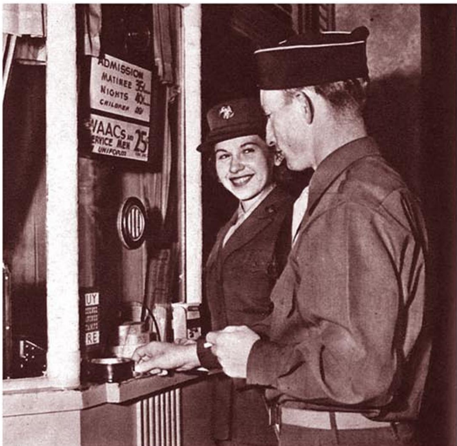
MEETING A DATE IN TOWN to take in a show is a favorite liberty pastime. WAACS, like their beaux in uniform, are entitled to special theater rates (note sign on box-office window). Uptown movie houses, a 20-minute walk from WAAC Tent City barracks, enjoy boom business every week-end.