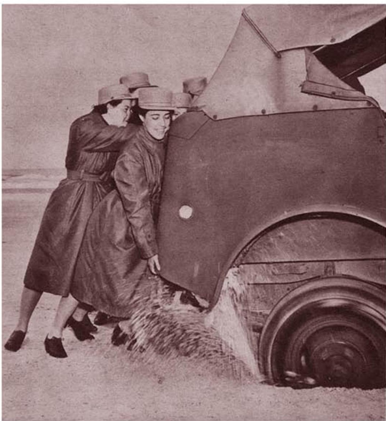
KEEP THE CONVOY MOVING is a watchword in the Motor Transport Corps. When cars are trapped in a sand ditch (a common occurrence since this unit trains along the beach), WAAC drivers rush forward to hoist and help. They're dressed for it, too — utility coats are made to stand the gaff.