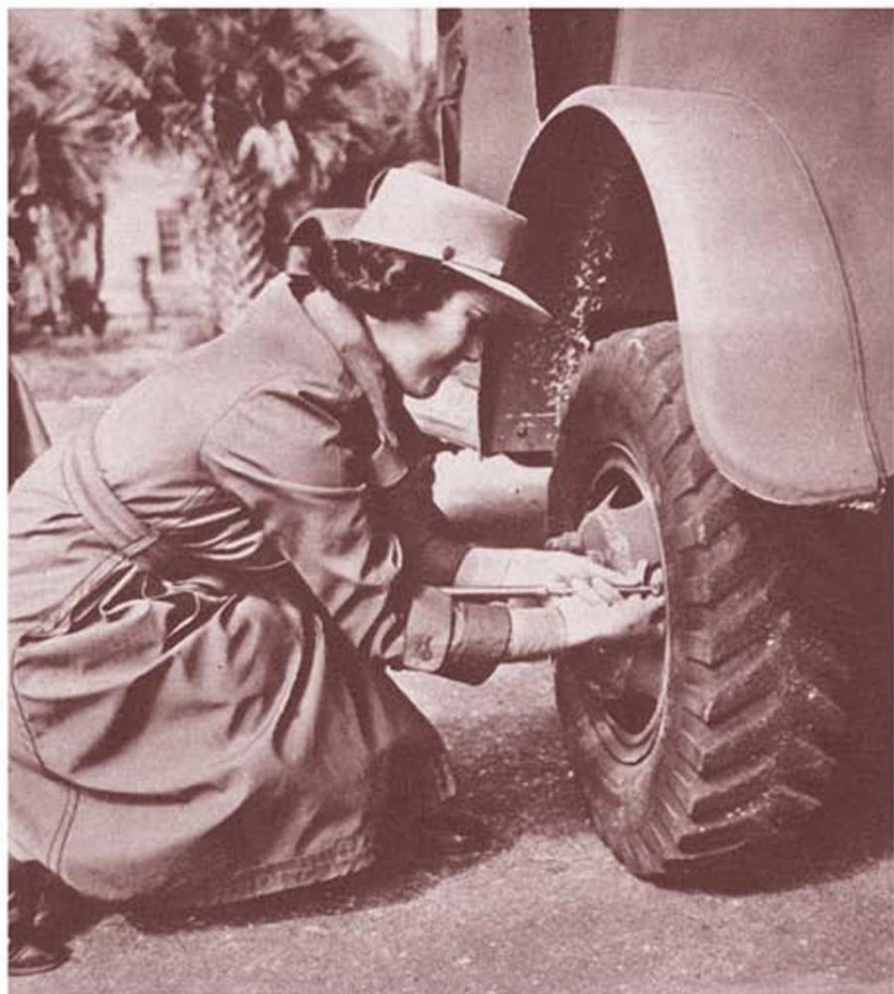
WAACS SERVICE THEIR CARS and check tire pressure before every trip. They are financially responsible for damage done to Army property due to negligence, therefore drive cautiously. Details call for the chauffeuring of officers or the transportation of Army supplies.

To help you see these U. S. Servicewomen as Floridians see them and to give you a closeup of their barrack life, CLICK photographs the Women's Motor Corps at work and at liberty . . . from reveille to bedcheck.