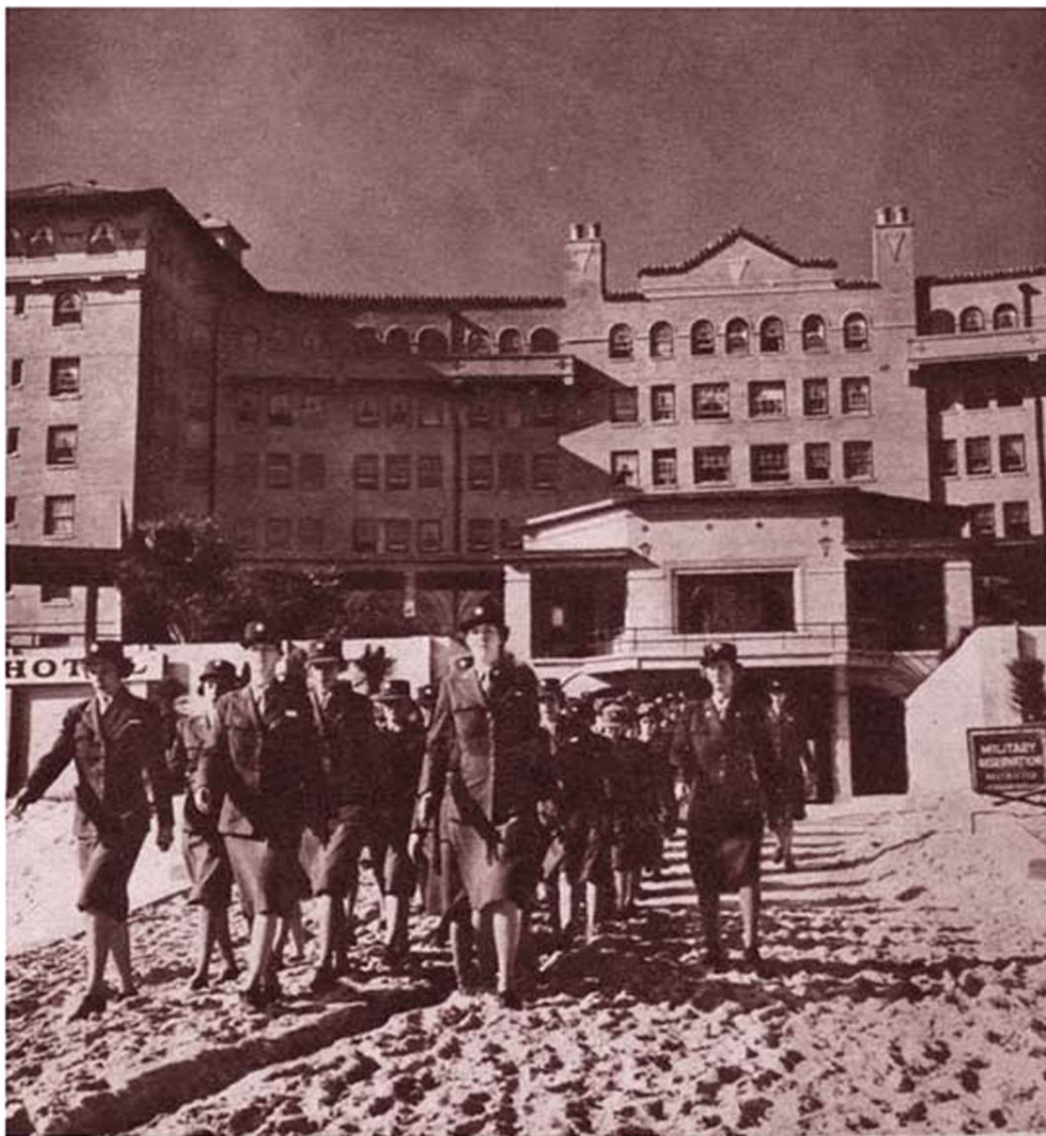
COMPANIES LEAVE BARRACKS in formation, led by their officers. Photographed after breakfast, this group comprises general and specialized WAACS. While some line up for a daily half-hour march, Motor Transport division WAACS who have completed basic training fall out to man the trucks.