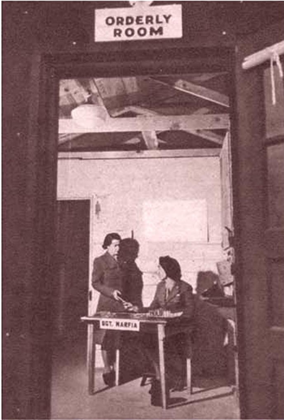
THIS TENT CITY ORDERLY ROOM is the seat of barrack operations. Company mother, the First Sergeant assigns Army chores and acts as a liaison for 200 WAACS and their company commander.