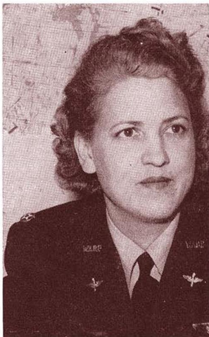
MISS JACQUELINE COCHRAN, Director, Women Pilots Program