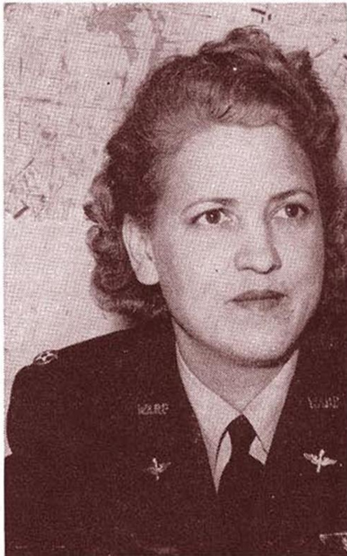
MISS JACQUELINE COCHRAN, Director, Women Pilots Program

The original work of women pilots in the United States was activated in September of 1942 in two steps. One was the formation of an experimental squadron of experienced women pilots to do ferry work in the Air Transport Command, known as the WAFS, or Women's Auxiliary Ferrying Squadron. The other step was the initiation of a training program for women pilots to provide all those which would be used except for the WAFS.