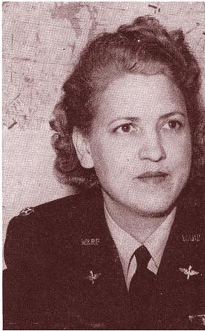
MISS JACQUELINE COCHRAN, Director, Women Pilots Program

The original work of women pilots in the United States was activated in September of 1942 in two steps. One was the formation of an experimental squadron of experienced women pilots to do ferry work in the Air Transport Command, known as the WAFS, or Women's Auxiliary Ferrying Squadron. The other step was the initiation of a training program for women pilots to provide all those which would be used except for the WAFS.