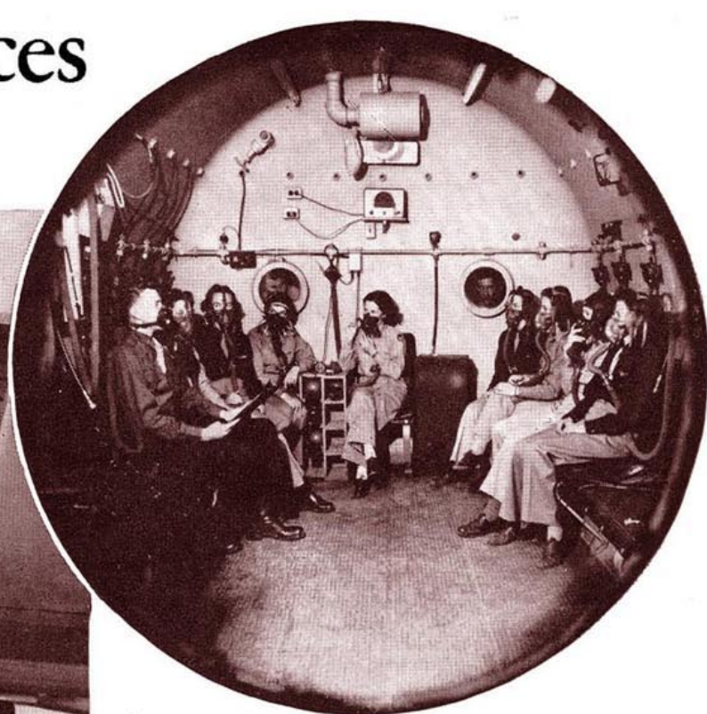
Above: WASPS are taught the intricacies of caring for themselves by the proper handling of equipment in the high-altitude chamber at Randolph Field.

WASPS at New Castle Air Base in Delaware hoist their equipment as they leave their huge plane.