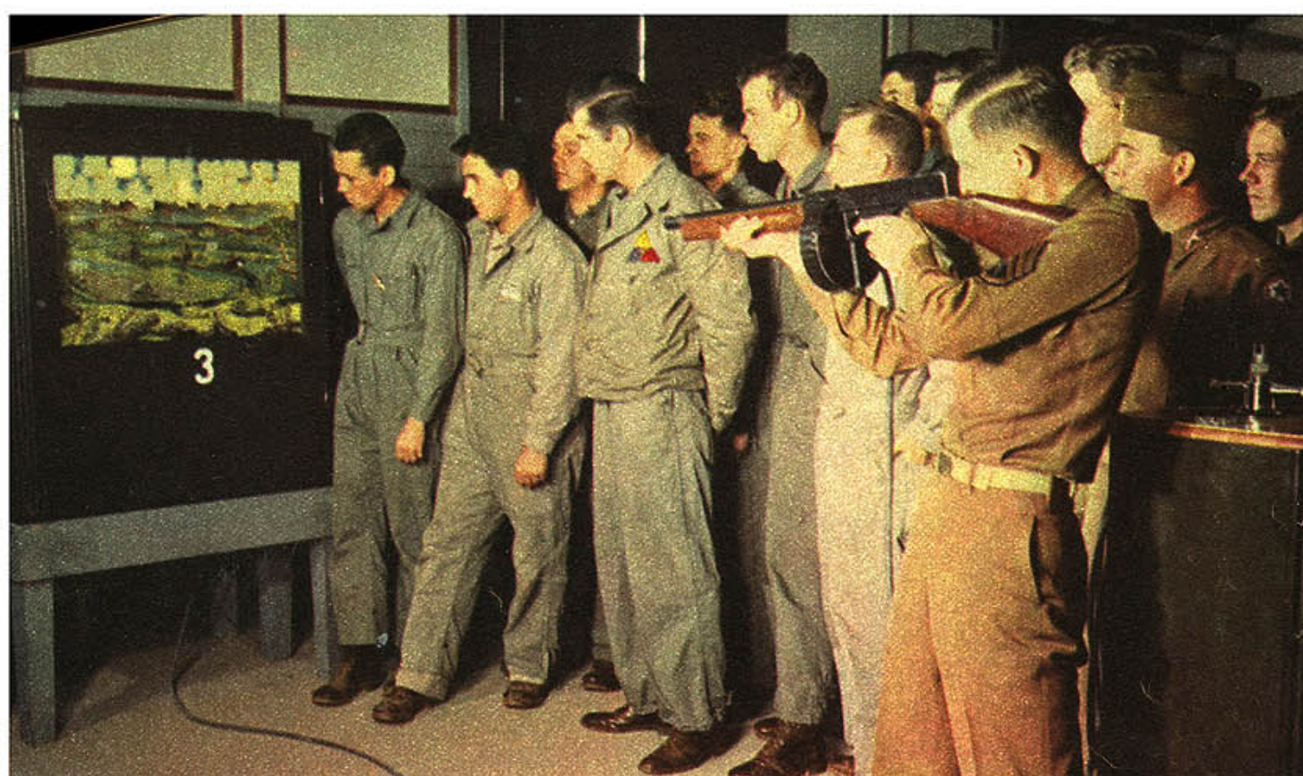
TANK GUNNERS. Men in the Gunnery Dept. at Ft. Knox, Ky., practice marksmanship with an electric-eye gun before going out on the range. The U.S. now has seven armored divisions