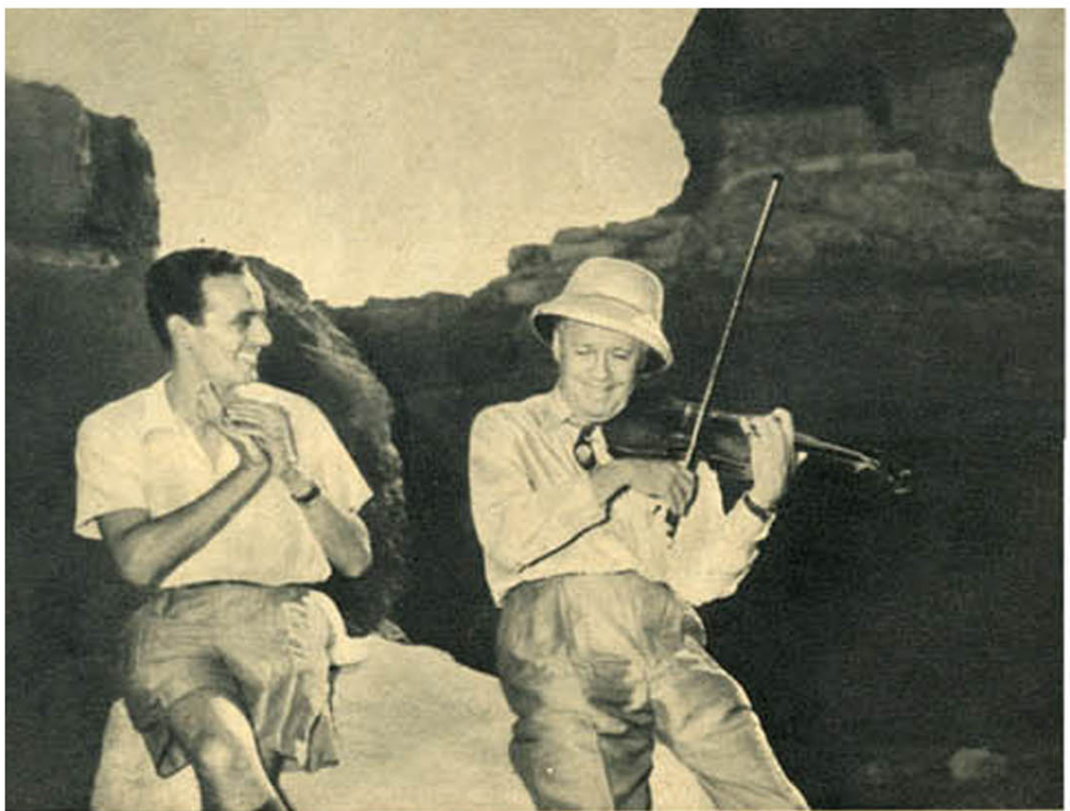
THE SPHINX looks down in awe when harmonica virtuoso Larry Adler and violinist torturer Jack Benny (above) do a duet in Egypt.