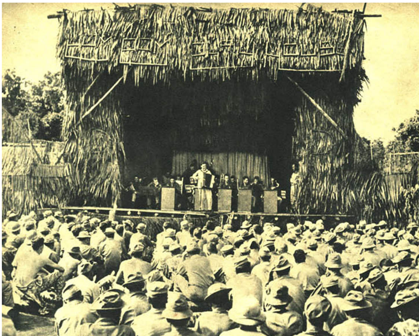
U. S. O. CAMP SHOW PEOPLE ENTERTAIN APPRECIATIVE SERVICEMAN AUDIENCES THE WORLD OVER. HERE THEIR THEATER IS A THATCHED AUDITORIUM IN NEW GUINEA