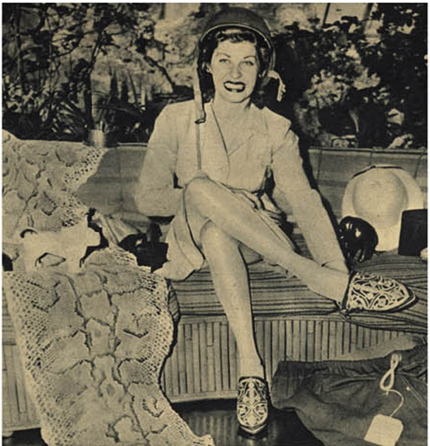
SOUVENIRS picked up during her four-months tour of North Africa are assembled around Martha Raye (above) after her return to the States.