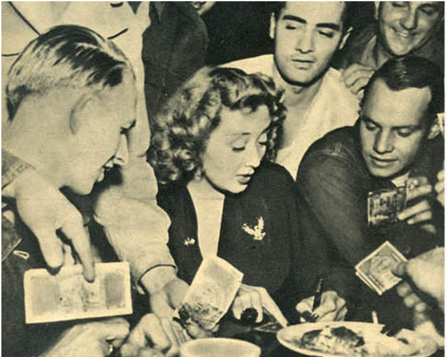
JOAN BLONDELL brought welcome feminine entertainment to the boys up in bleak Newfoundland. When she introduced the Short Snorter Club there, she found plenty of prospective members who wanted bills autographed.