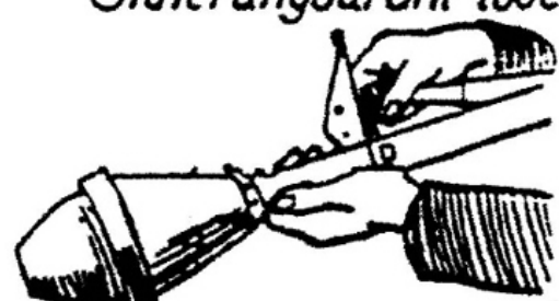
Sicherungsschieber auf „Entsichert“ schieben.