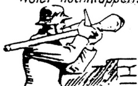
Drückst du jetzt auf die mit Feuer bezeichnete Klinke, geht der Schuss los.

WAR DEPARTMENT TECHNICAL MANUAL TM-E 30-451