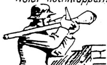
Drückst du jetzt auf die mit Feuer bezeichnete Klinke, geht der Schuss los.

WAR DEPARTMENT TECHNICAL MANUAL TM-E 30-451