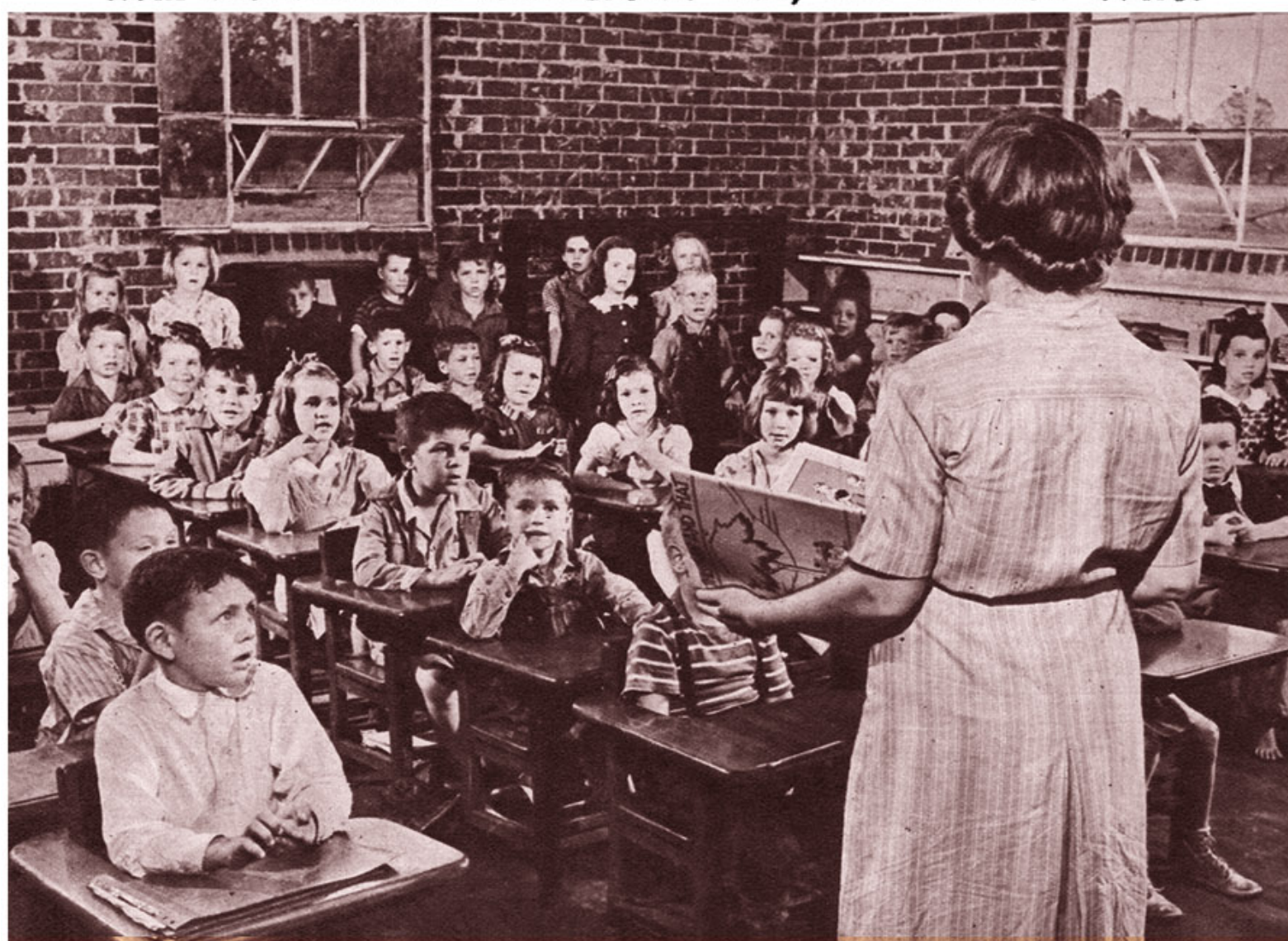
A COMMON SCENE IN MANY STATES: PUPILS STAND IN CROWDED CLASS. THIS SCHOOL IS AT HINESVILLE, GA.

With thousands of teachers at war, the children suffer