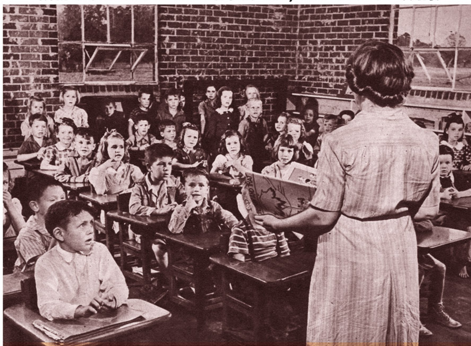
A COMMON SCENE IN MANY STATES: PUPILS STAND IN CROWDED CLASS. THIS SCHOOL IS AT HINESVILLE, GA.

With thousands of teachers at war, the children suffer