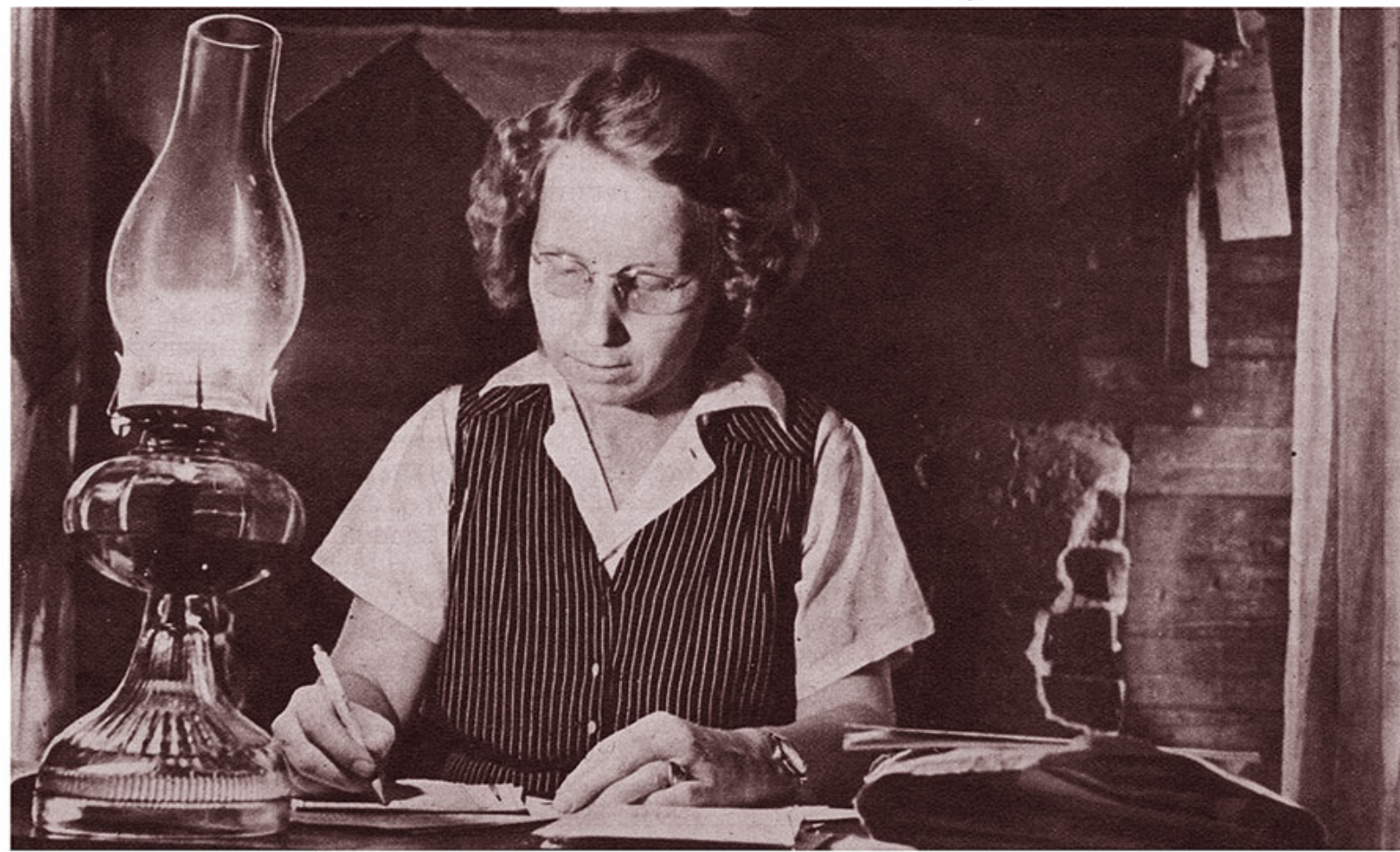
TEACHER'S HOMEWORK LASTS UNTIL LATE—HEAVY SCHEDULE LEAVES HER LITTLE TIME FOR RECREATION

Yet, at a time when the nation must have more and better education, many teachers are missing. By "missing" I do not mean to cast unfavorable criticism. Every community can testify to the competent and unselfish job teachers have done both at their posts and in voluntary wartime tasks