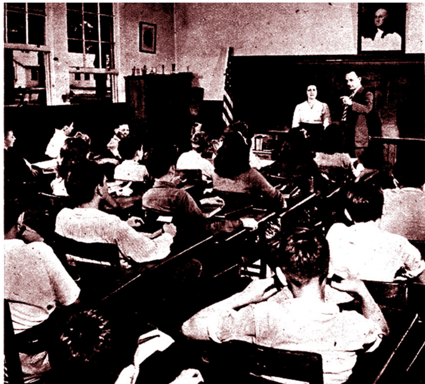
NEW TEACHER takes over, the sixth this class has had in seven months. She is an Army wife, may have to leave at any moment.

Let there be no mistake about it—the danger is here. Ignorance is a field from which dictatorship can spring. A younger generation, growing up in ignorance, will weaken our democracy for, under certain conditions, it could be captured by demagoguery and fraud. Saving America's schools may mean saving our country twenty years from now.