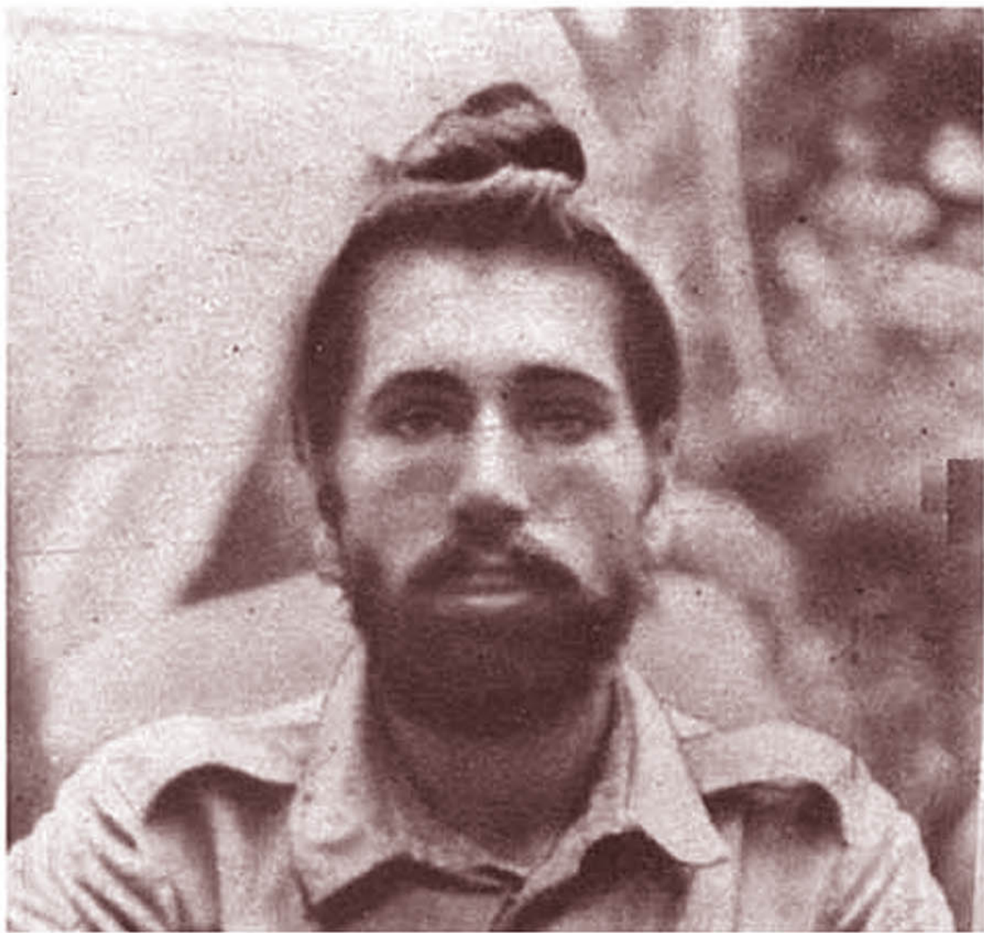
Knotty problem this Indian hair-do, as you can see by the "before and after" pictures.