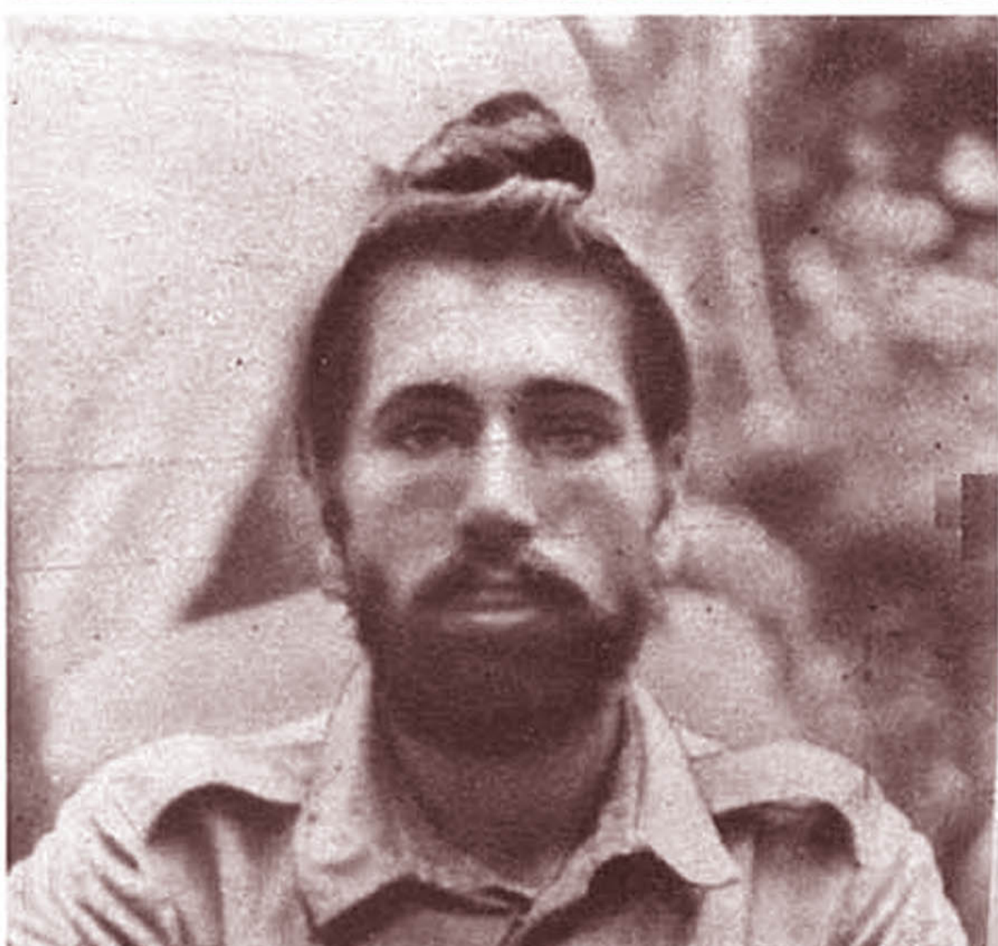
Knotty problem this Indian hair-do, as you can see by the "before and after" pictures.