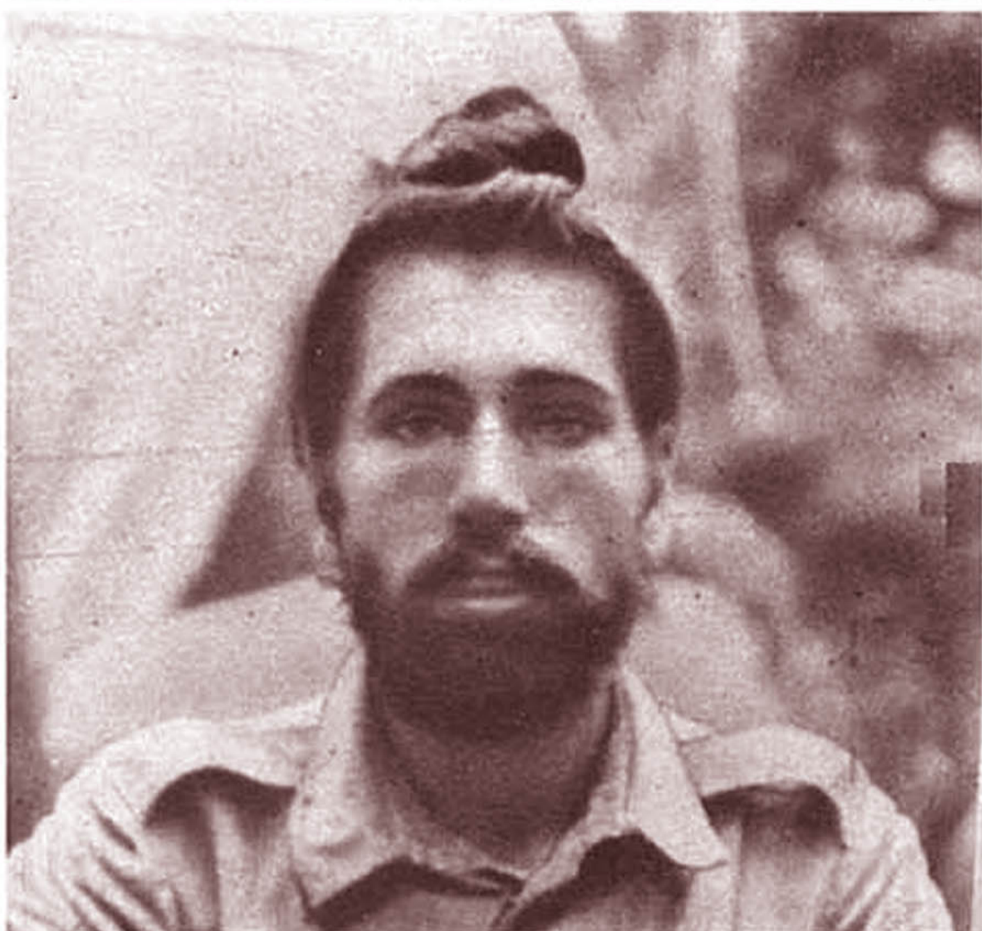
Knotty problem this Indian hair-do, as you can see by the "before and after" pictures.