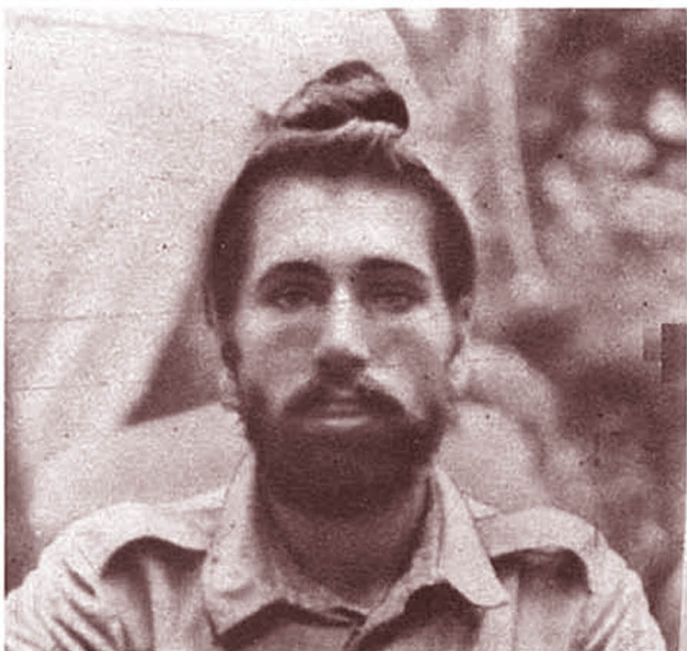
Knotty problem this Indian hair-do, as you can see by the "before and after" pictures.