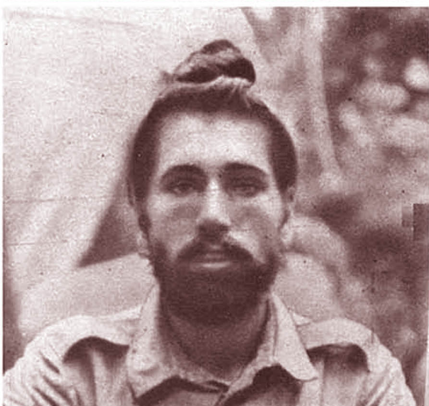
Knotty problem this Indian hair-do, as you can see by the "before and after" pictures.