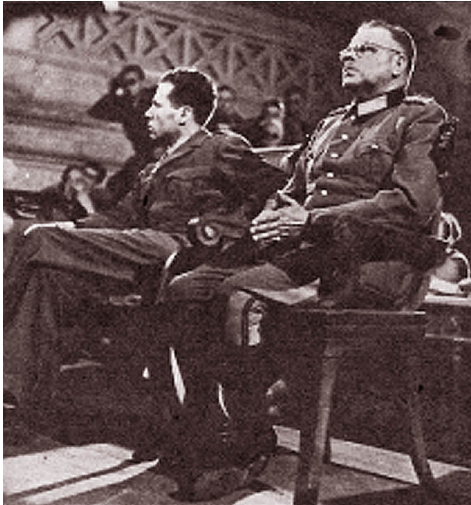
On the stand Dostler tells the commission he was acting under orders from Hitler and Field Marshal Kesselring when he ordered execution of the OSS Commandos.

The trial was carefully watched by virtually the entire world press, since the issue—whether all Nazi war crimes may be attributed to Hitler alone and whether "obeying orders from above" is a valid defense for illegal acts of war—was tested here for the first time.