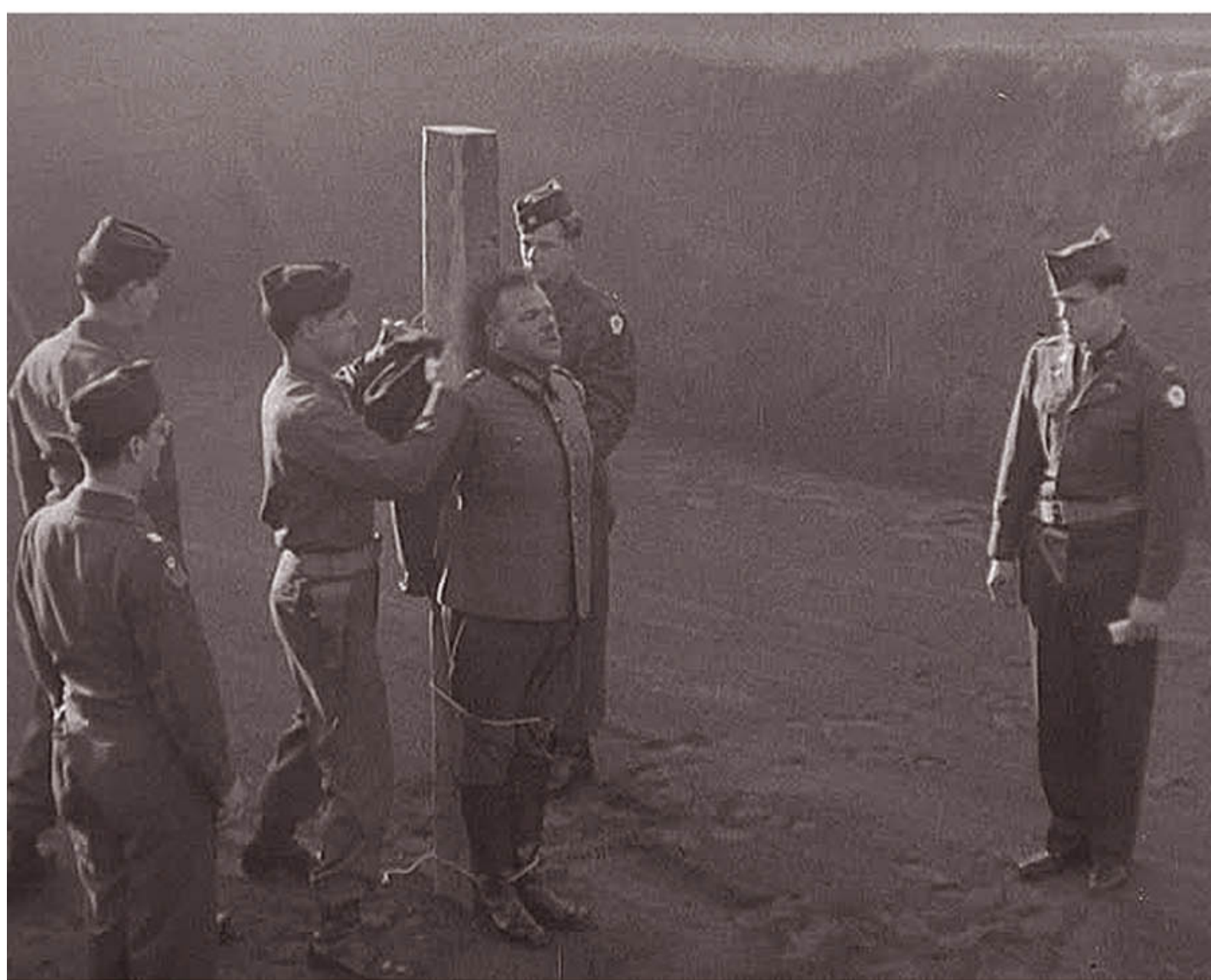
THE EXECUTION OF GENERAL ANTON DOSTLER (IMAGE ADDED)