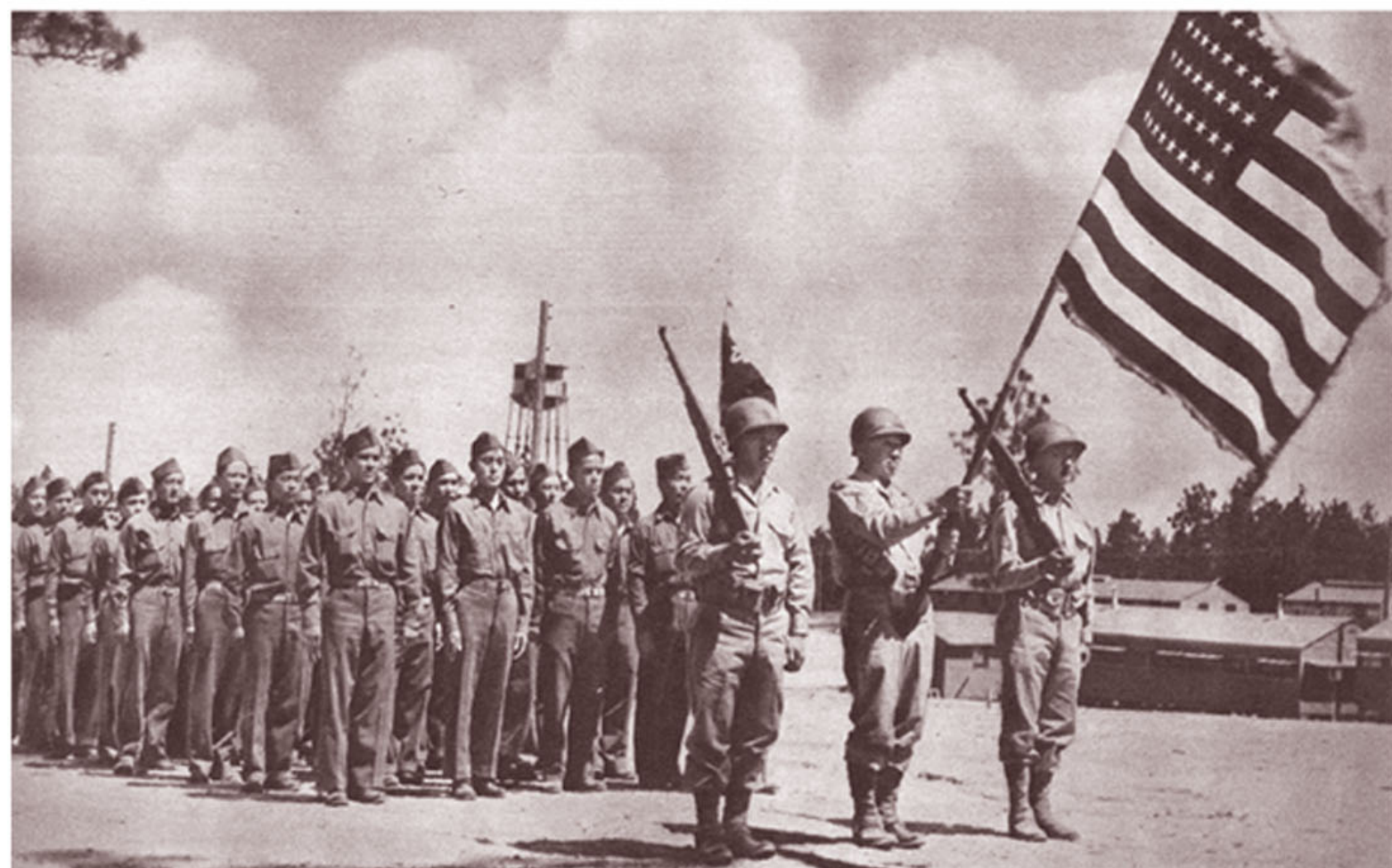
JAPANESE-AMERICAN SOLDIERS DRILL UNDER COLOR GUARD AT CAMP SHELBY, MISSISSIPPI. UNIT OFFICERS AND MEN ARE ALL CHILDREN OF JAPANESE IMMIGRANTS