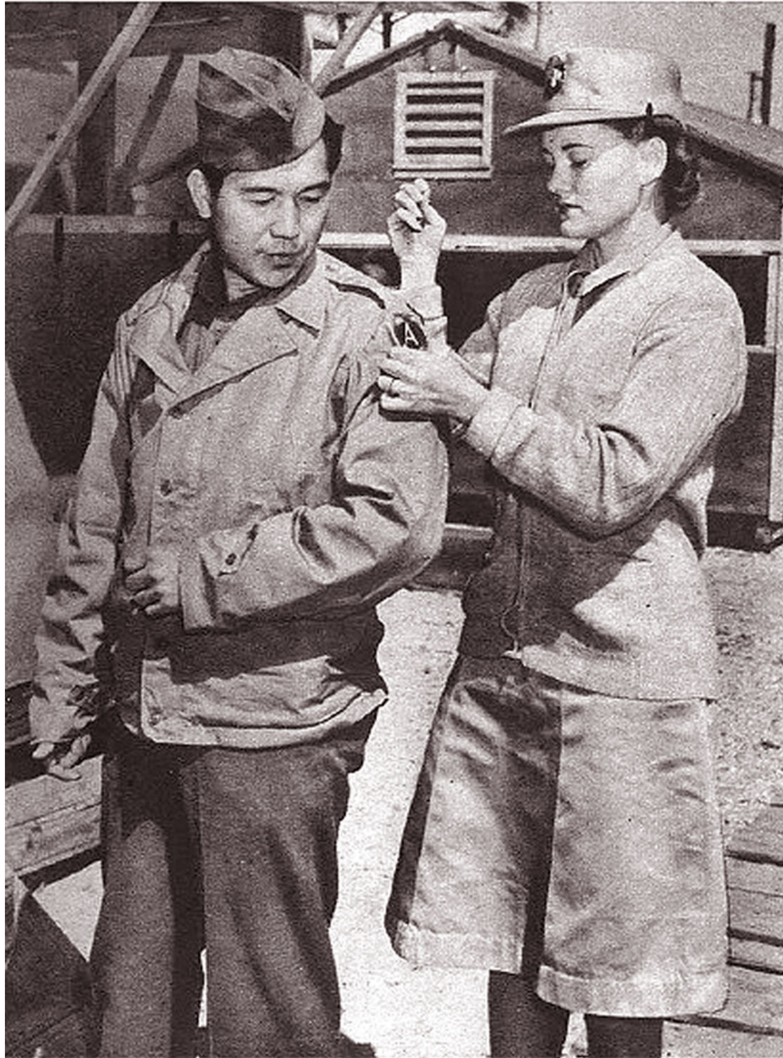
WAAC SEWS ON INSIGNIA for Japanese-American soldier at Camp Shelby. These soldiers are full members of our fighting forces and many of their officers have seen long Army service.