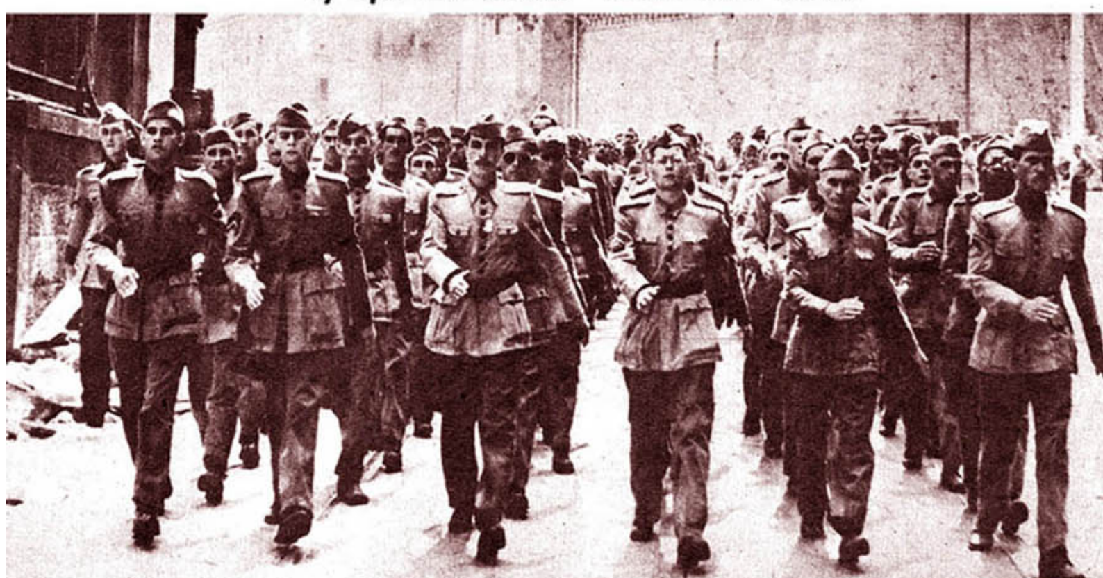
Troops from the 1st Division, Brazilian Expeditionary Forces, march through the streets of Naples. Their green uniforms with high buttoned collars differ from those worn by other soldiers of the United Nations.

W E had a hard time getting accustomed to the latrines on the ship. Back in Brazil a man going to the latrine would enter a cubicle that had a door to insure privacy. It was very difficult on the ship for the men, just sitting there looking at each other. But they're getting used to it."