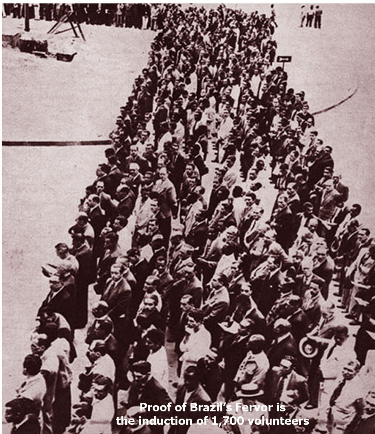
Proof of Brazil's Fervor is the induction of 1,700 volunteers