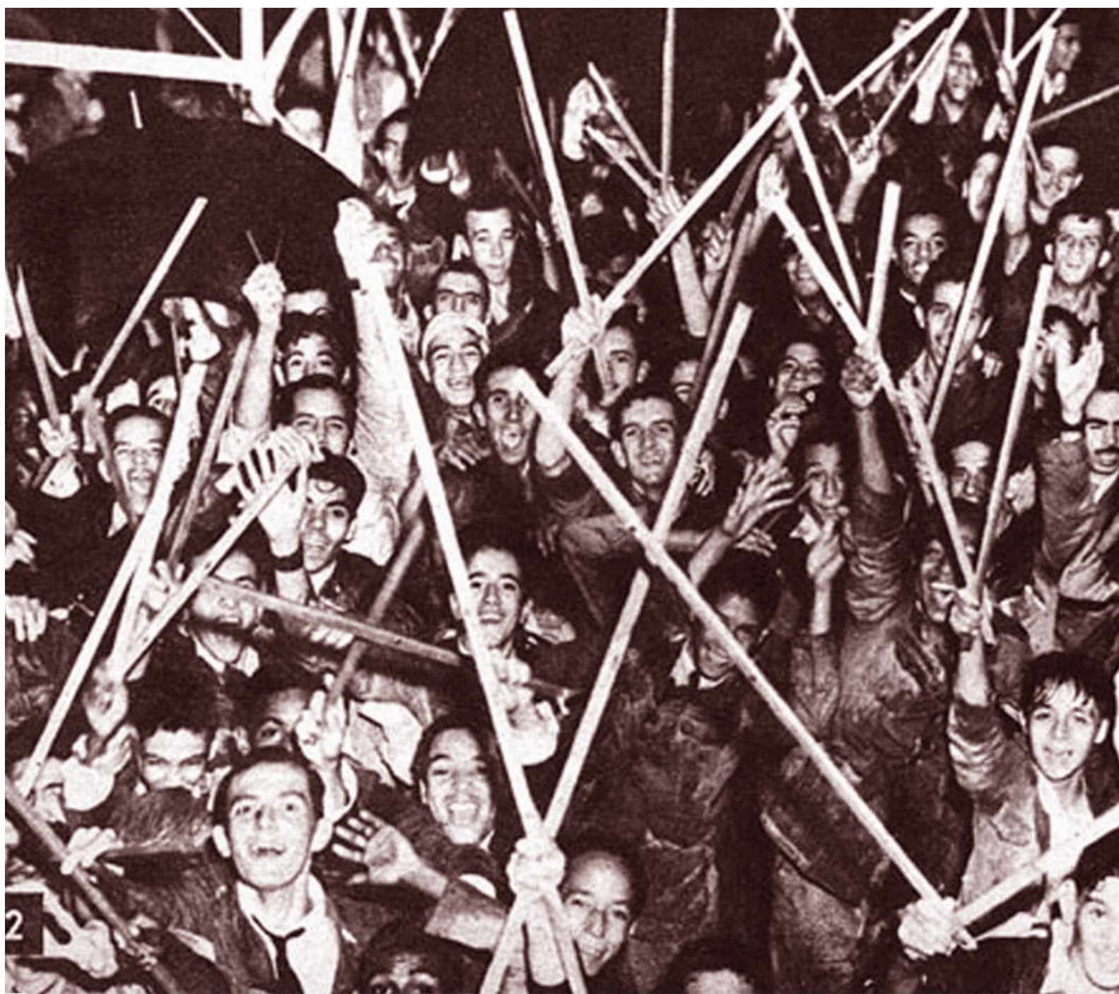
DESPITE DRENCHING RAIN, KIDS MAKE V-FOR-VICTORY SIGNS WITH BATONS