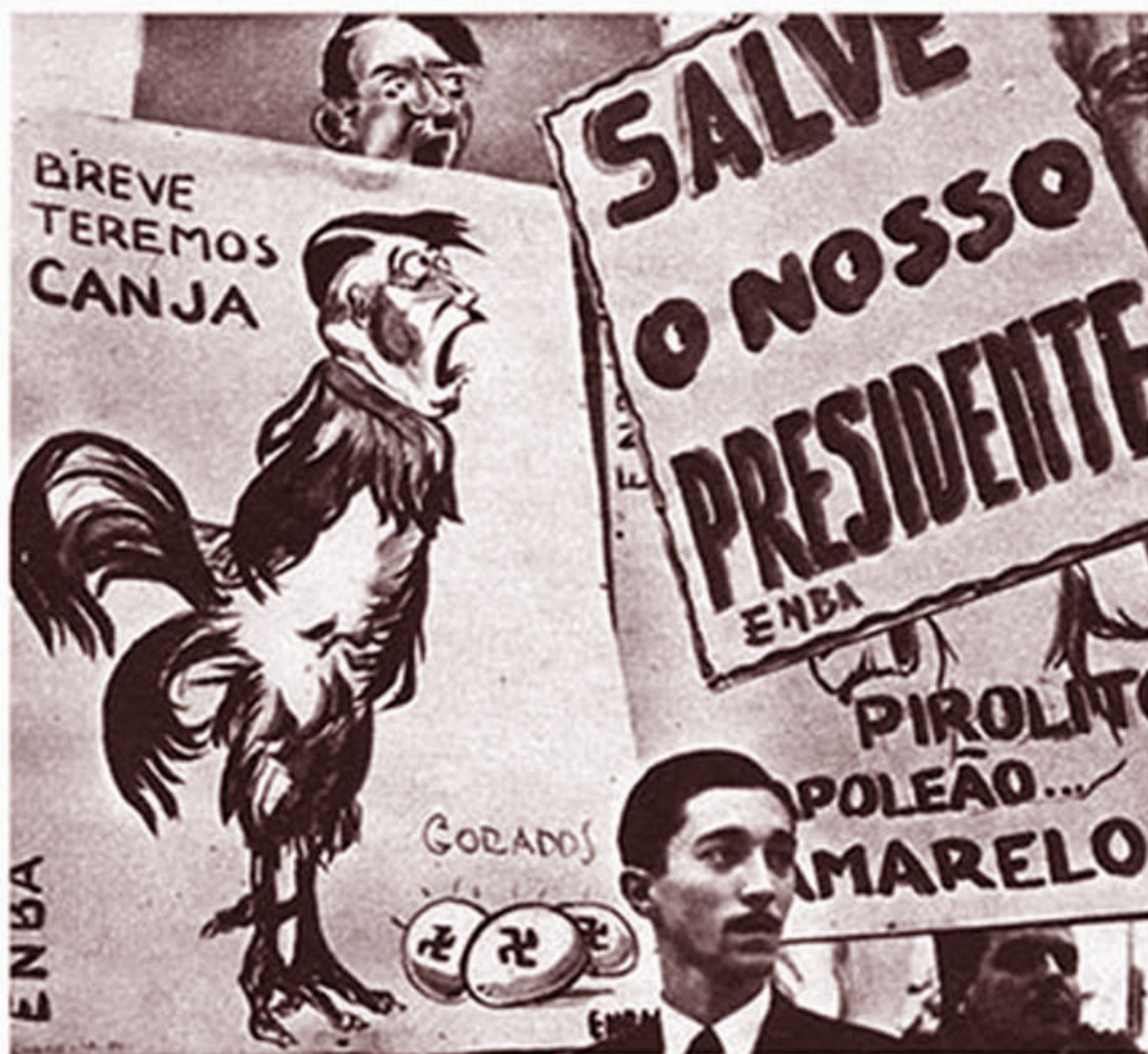
HITLER'S FINE PROMISES ALL TURN OUT TO BE BAD EGGS