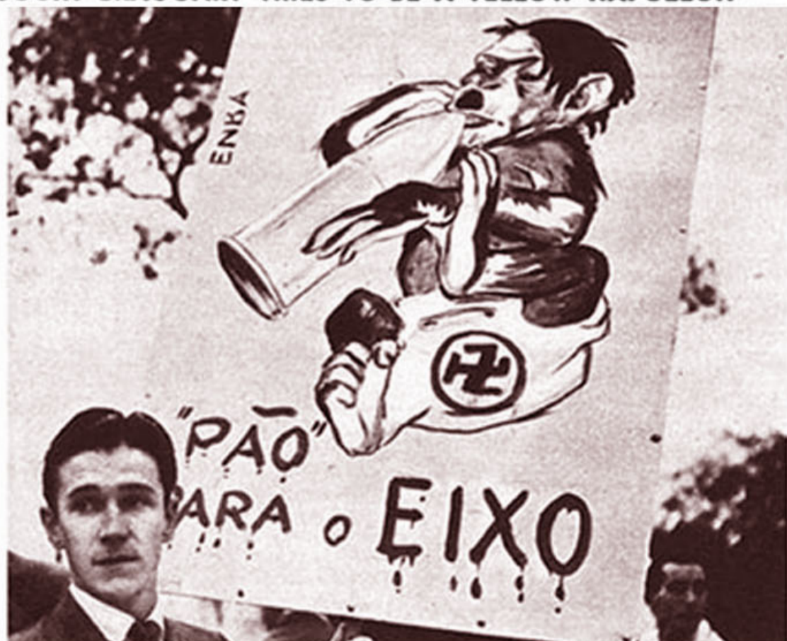
THE BOMB IS "BREAD FOR THE AXIS"—FOR THE NAZI APE