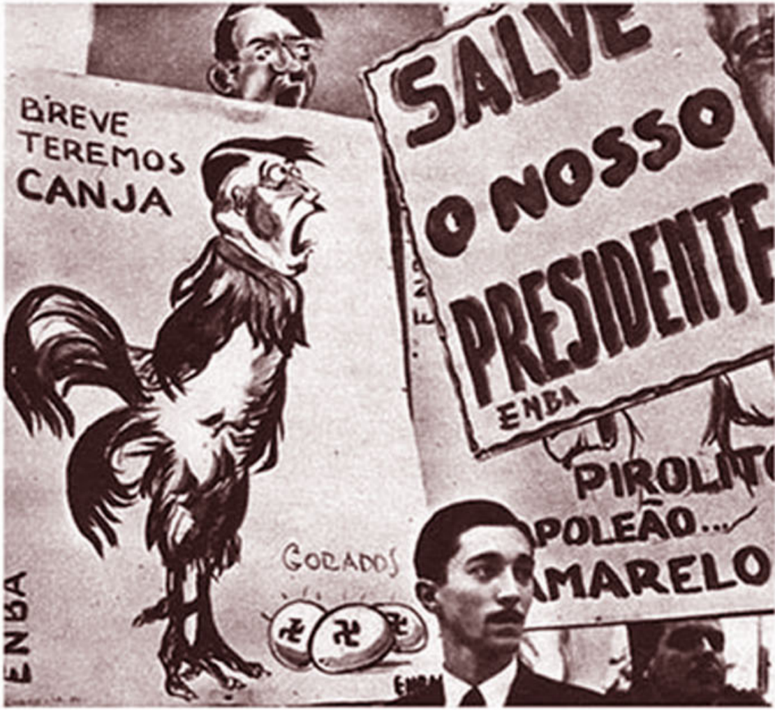
HITLER'S FINE PROMISES ALL TURN OUT TO BE BAD EGGS