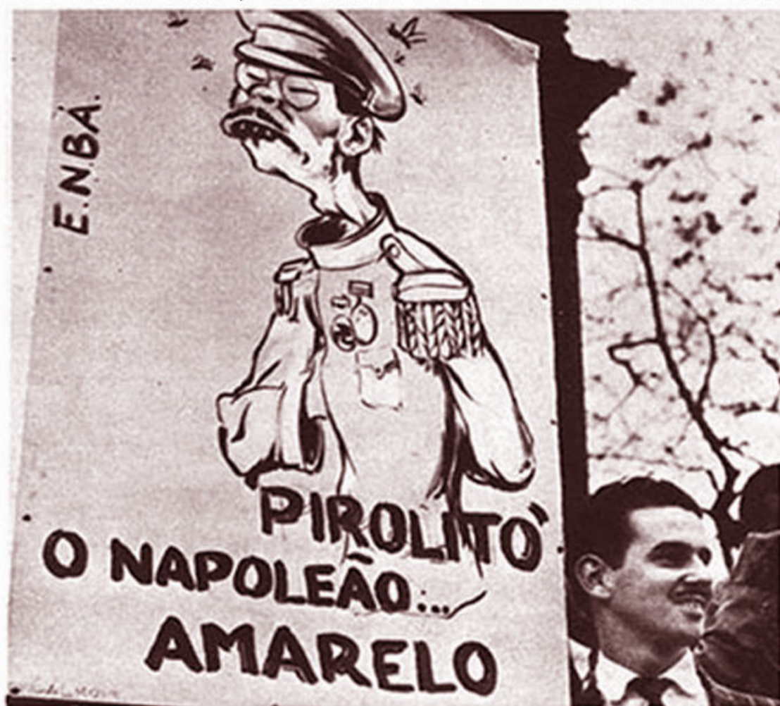
"COCKY BRAGGART TRIES TO BE A YELLOW NAPOLEON"