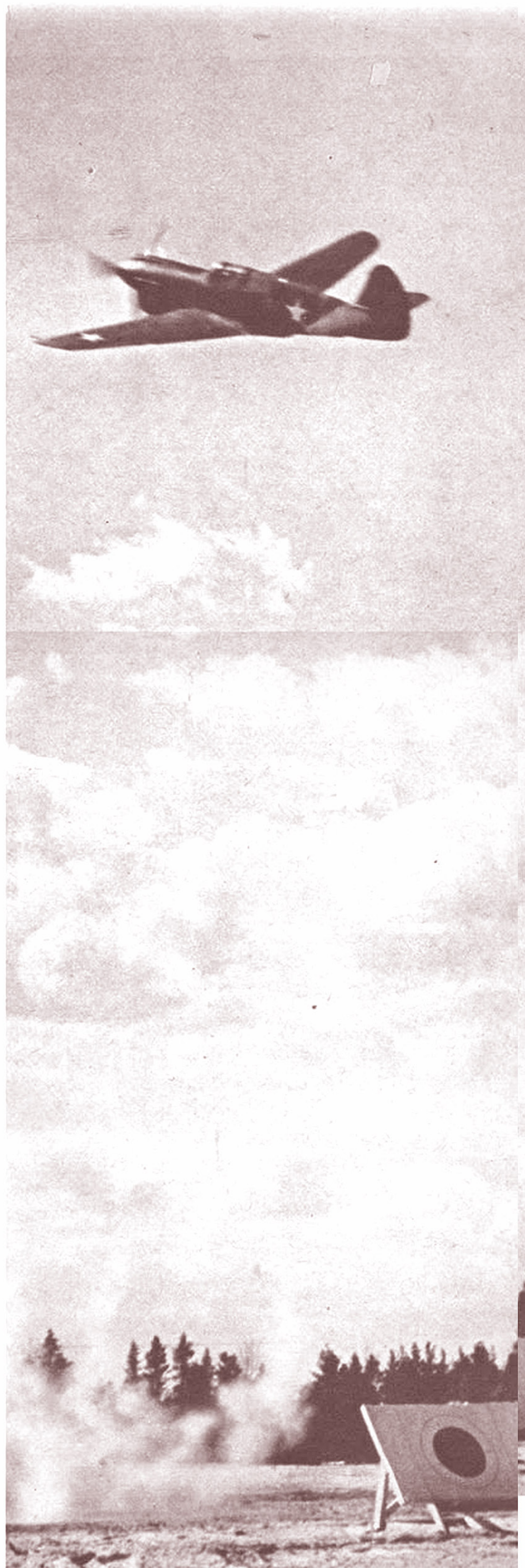
BULL'S-EYE! SAND CLOUD SHOWS THAT LT. JEROME EDWARD'S FIRE HIT GROUND TARGET