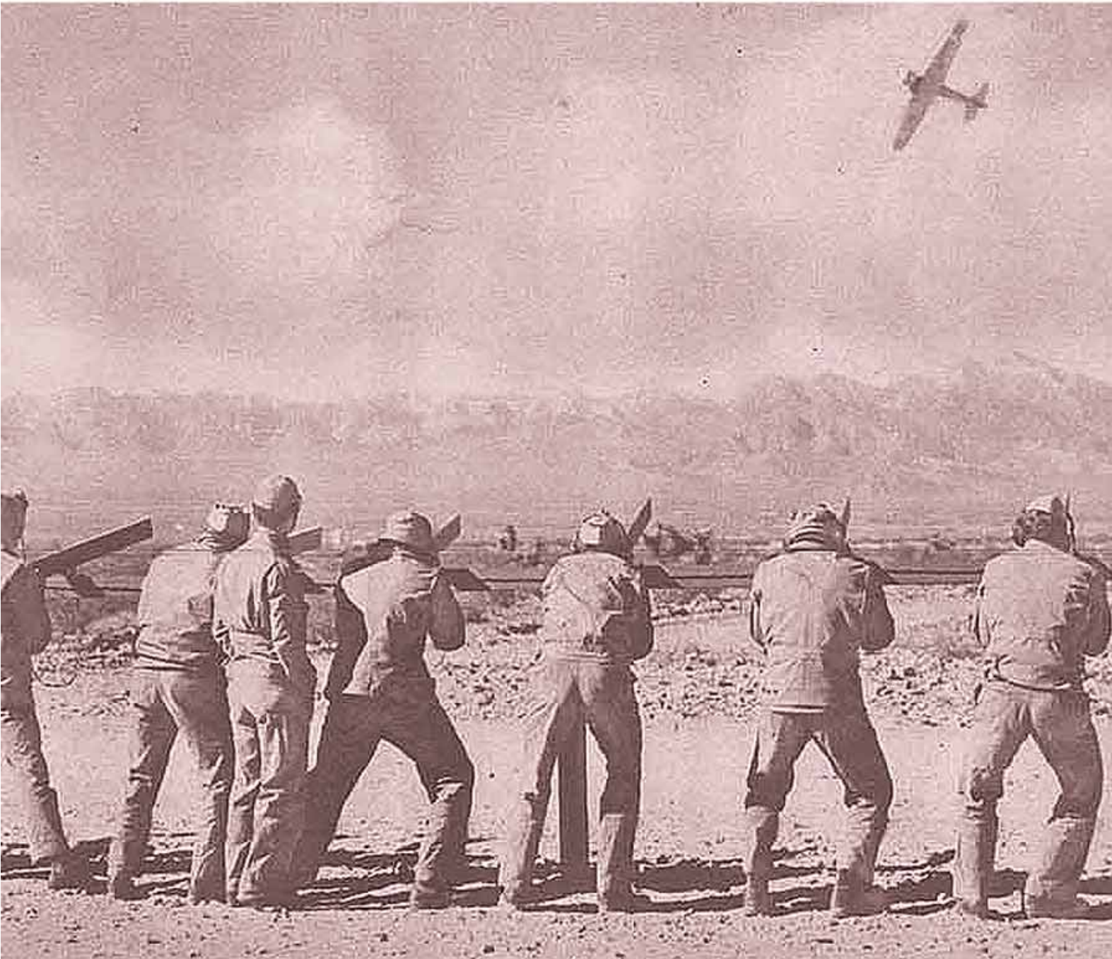
BASIC TRAINING under trapshooting champions accounts for the almost uncanny accuracy of our aerial gunners. Here a group of students use dummy guns to learn how to "lead" a moving target. Coordination of hand and eye is one of the dividends our gunners derive from this meticulous training.

Aerial gunners, such as these men in training at Las Vegas, Nev., are taught a good gunner is an almost impossible target for the enemy while a bad gunner is an easy one. The balance of power favors the man who knows his job, and U. S. Army Air Corps spares no effort to see that American gunners are tops. The Army knows we must depend upon these aerial gunners to give us victory over our Axis enemies.