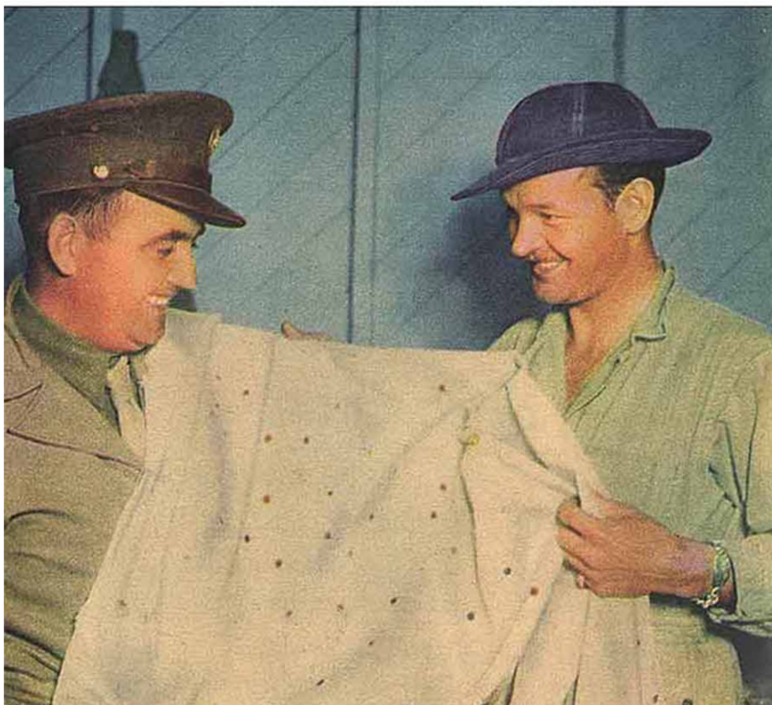
INDIVIDUAL SCORES made on a target sleeve are computed by the colored markings left by the bullets. Men who fail after five weeks of training are "washed out" as gunners.