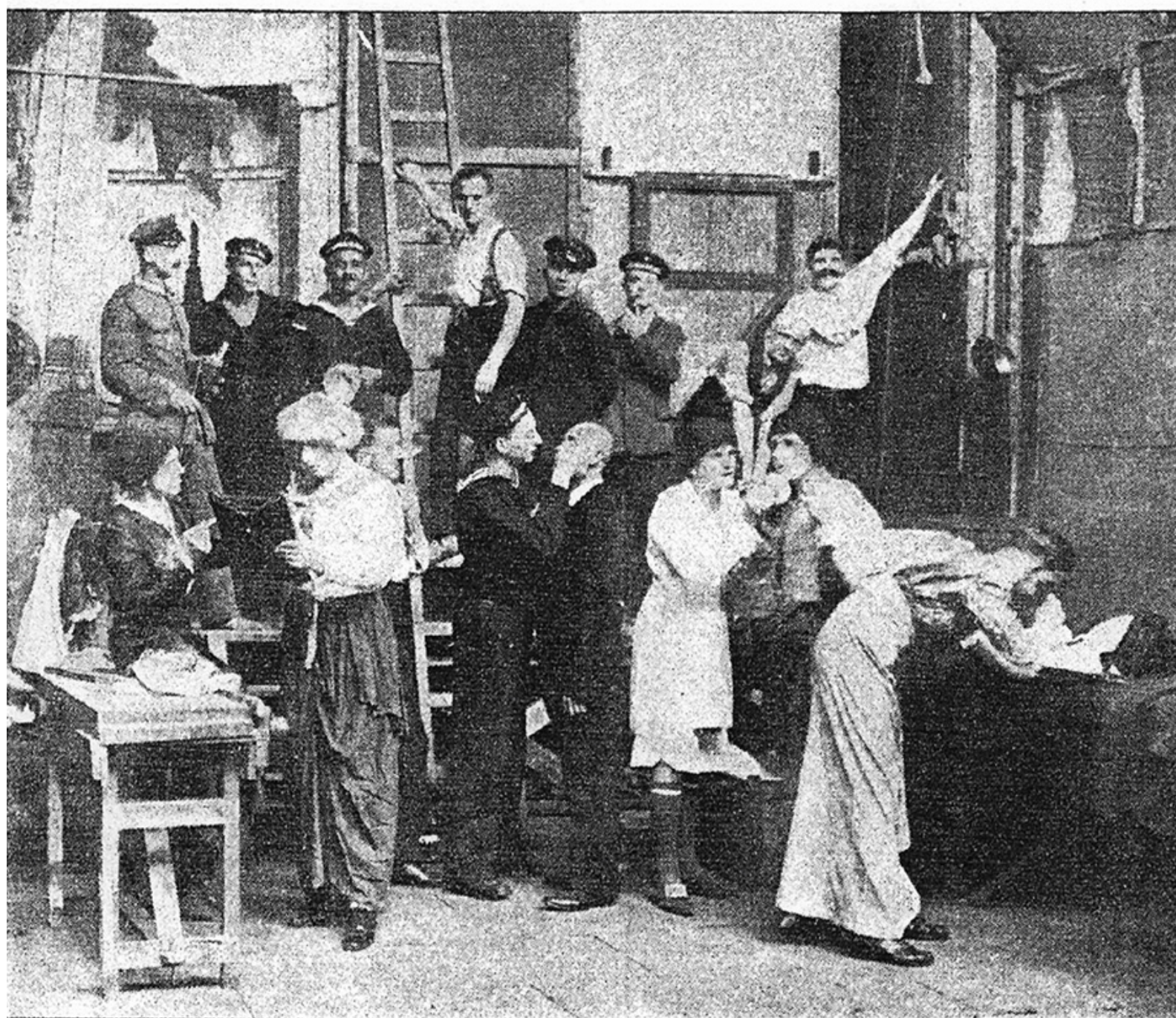
A GERMAN REHEARSAL IN AN ENGLISH CAMP.

"Making up" for a diversion permitted by England to her German war-prisoners at Dorchester Prison-Camp.