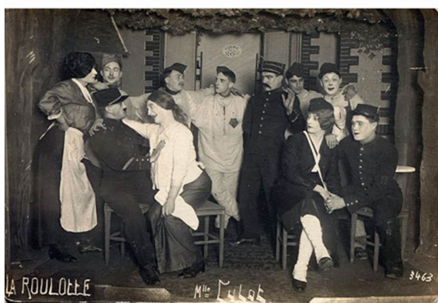
Pictured above is a French production from the Koningsbruck P.O.W. Camp.

German translation of the original. We also had some evenings devoted to one-act plays, one of the most successful being an evening occupied by three plays of Stanley Houghton. Probably the most notable triumph on our stage, from the artistic point of view, was achieved by 'L'Enfant Prodiges,' the pantomime drama by Mr. Carré, with the musical accompaniment by A. Wormser. The first attempt at comic opera was made with 'Trial by Jury,' which was witnessed by a number of English military prisoners, who happened to be transferred to Ruhleben for a few days on their way