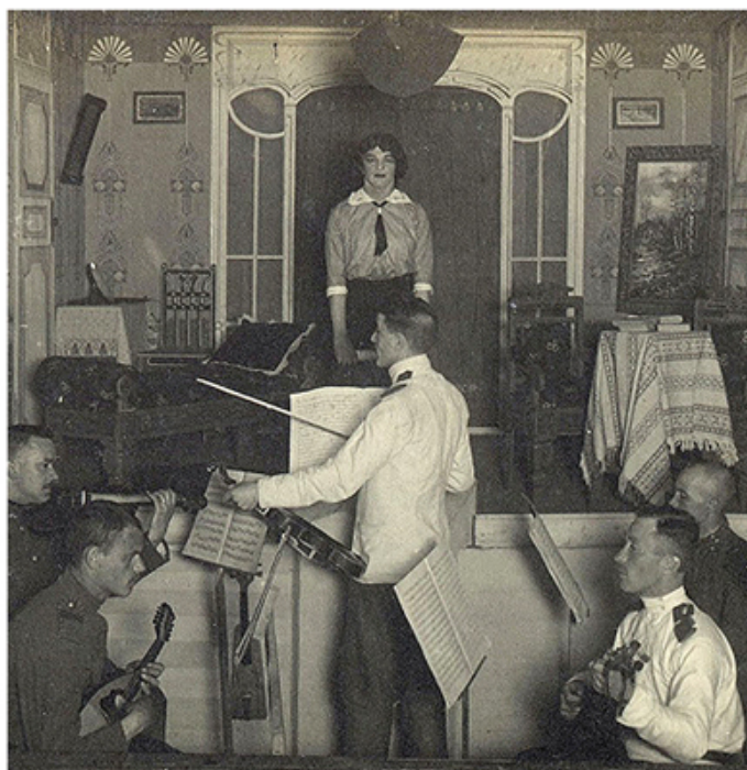
A Russian production being rehearsed at the German prison camp at Königsbruck. (image & caption added)

Early in the summer of 1915, we are told, the professional musicians formed a musical society, "to secure accommodation for practise and study for the professional musicians and students interned, and to organize concerts and other musical entertainments in the camp." We read: