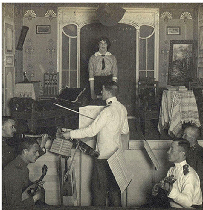
A Russian production being rehearsed at the German prison camp at Königsbrück. (image & caption added)

Early in the summer of 1915, we are told, the professional musicians formed a musical society, "to secure accommodation for practise and study for the professional musicians and students interned, and to organize concerts and other musical entertainments in the camp." We read: