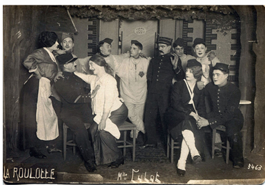
Pictured above is a French production from the Koningsbruck P.O.W. Camp.