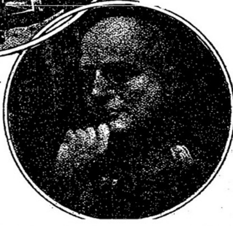
Privy Councillor Haber, Responsible for Much of the Deadliness of German Gas Warfare.