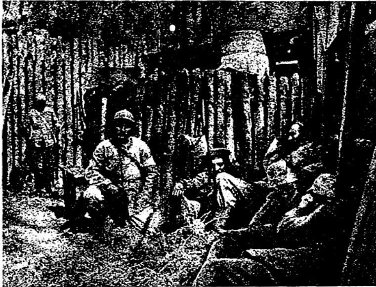
Germans Blinded by Their Own Gas and Captured by the French in Recent Offensive.