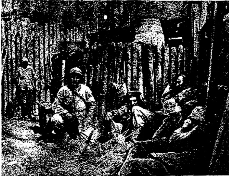
Germans Blinded by Their Own Gas and Captured by the French in Recent Offensive.