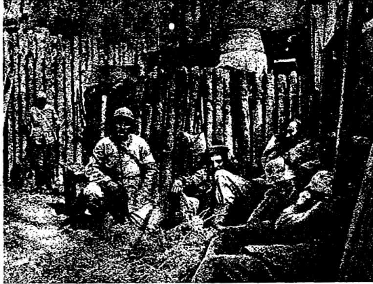
Germans Blinded by Their Own Gas and Captured by the French in Recent Offensive.