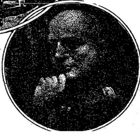
Privy Councillor Haber, Responsible for Much of the Deadliness of German Gas Warfare.

enters into its composition, but a drop of it on a soldier's sleeve penetrates, and, after the lapse of hours, blisters like mustard. It is a deep burn, and causes great swelling. But mustard gas is so innocent in appearance and so inoffensive to the nostrils that the soldiers were not on their guard against it. The chief sufferers were the artillerymen, who threw aside their masks after working for a time amid it. The masks were of little avail, anyhow, for the kind then in use did not last ten minutes in an atmosphere drenched with the drug.