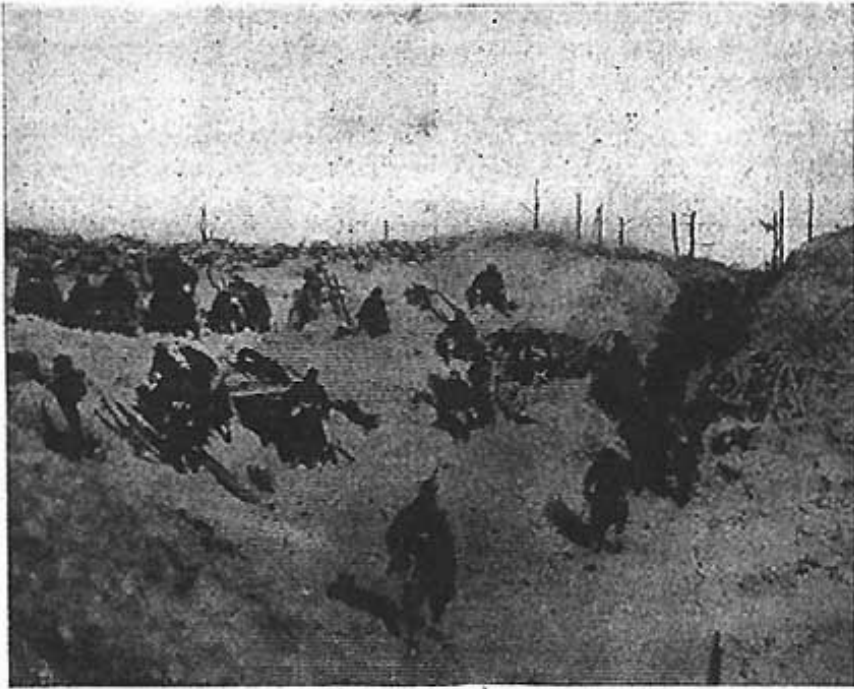
The French "ant" army. Sappers at work on new trenches

After two weeks in England, during which I have taken pains to inquire, I have learned the name of but one single Englishman of the so-called leisure class and of military age who is not engaged in the war. As soldiers, or, when they cannot pass the physical examination, as civilians, all of the men of prominence and position are doing what they can. Two