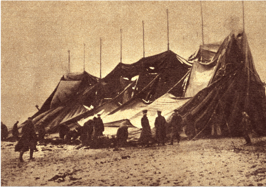
THESE TENTS, covering a gas-filled balloon, caved in from snow.