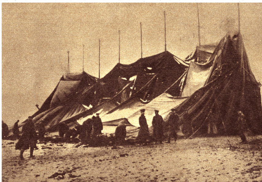
THESE TENTS, covering a gas-filled balloon, caved in from snow.