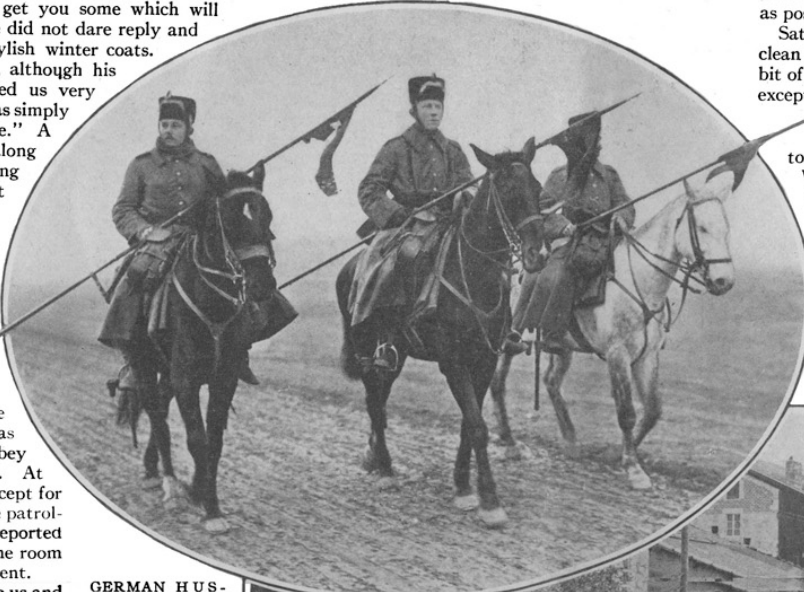
GERMAN HUSSARS ON SCOUT DUTY

Germany's cavalry has been most serviceable in the eastern war area, where the conditions have favored this arm of the service.