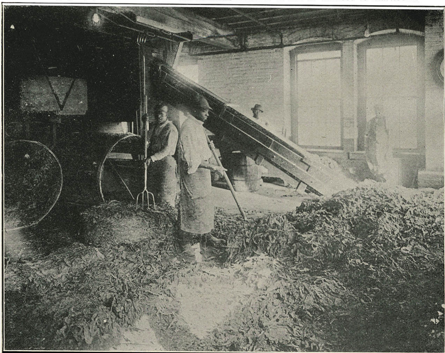
MAKING CIGARETTES FOR THE ARMY.

Packing machines in a Winston-Salem, N. C., plant. These machine automatically weigh the tobacco, wrap and seal tins in which this particular brand of tobacco is marketed.