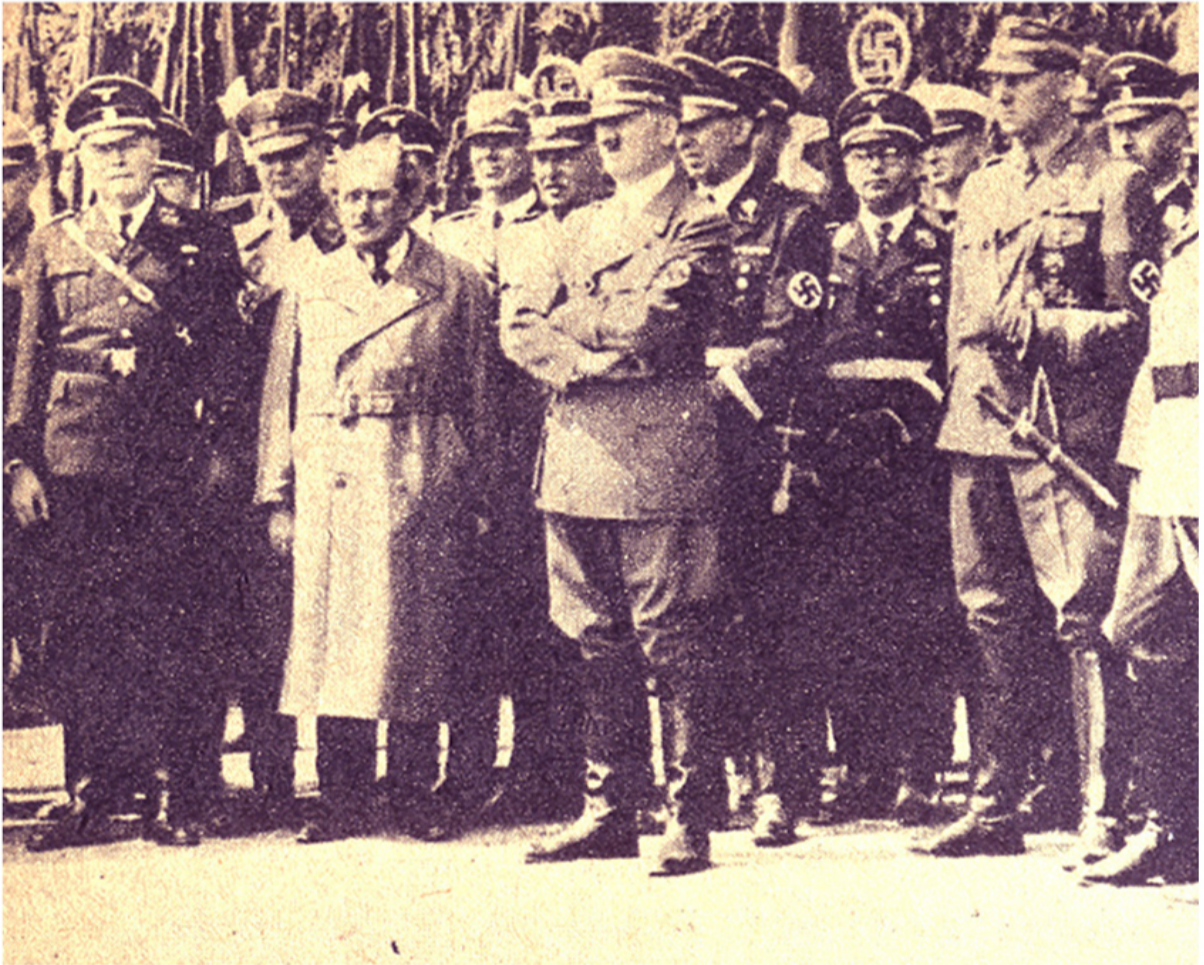
Hitler stands next to Prof. Porsche who designed Volkswagen, later built sports cars.

There was still a sellers' market, and Nordhoff brought the pressure of consumer demand into psychological play in the works. Every finished car was delivered immedi-