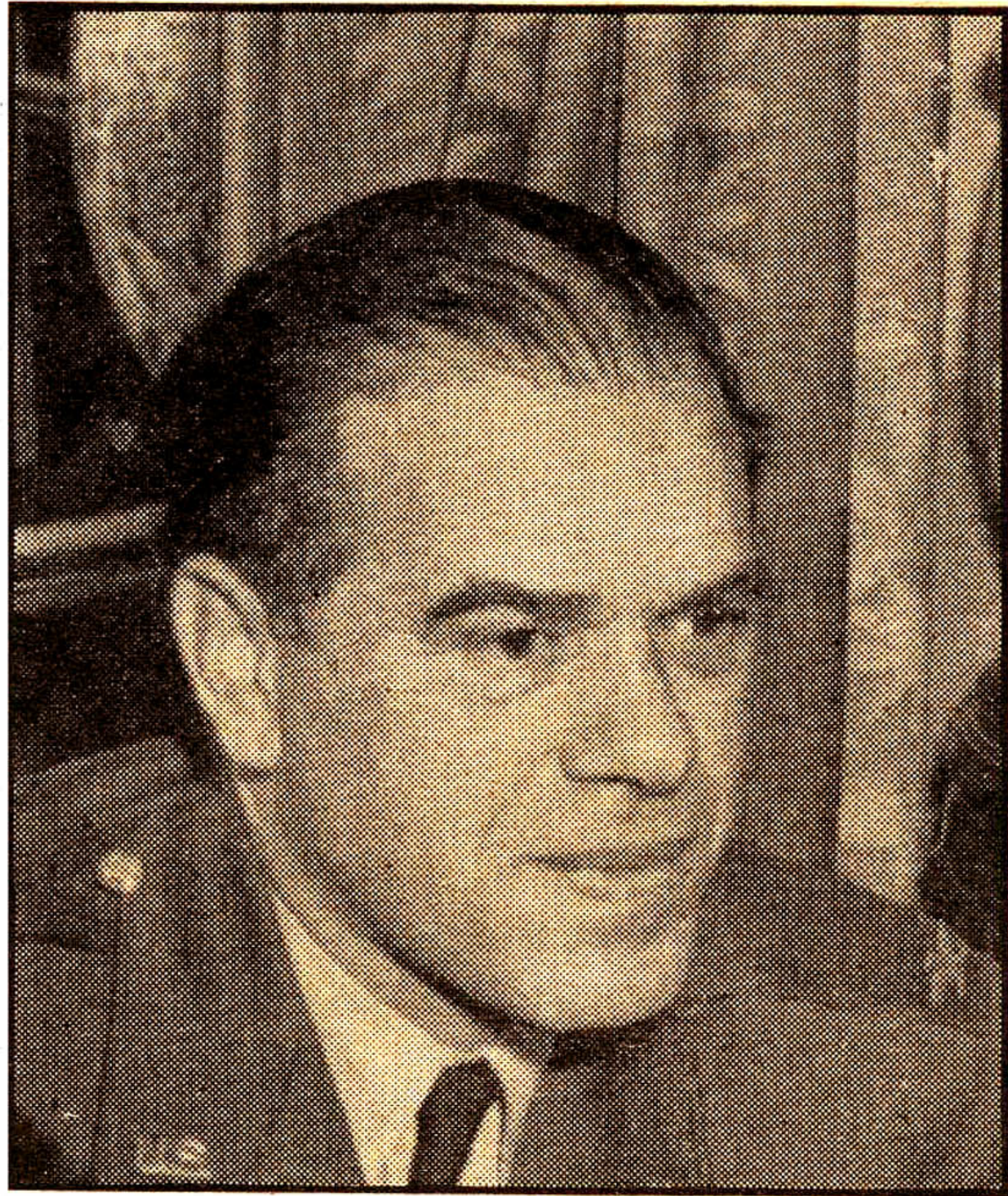
COL. CAPRA. His latest: Tunisian victory.

Uncle Sam has been turning out movies since about 1908. The first World War gave this business a big spurt, but it took World War II to bring it into full bloom. The entire motion picture industry today is using, roughly, 2 billion feet of raw film stock a year—and Uncle Sam's military establishment and agencies in war-related work are using considerably more than half of the total output.