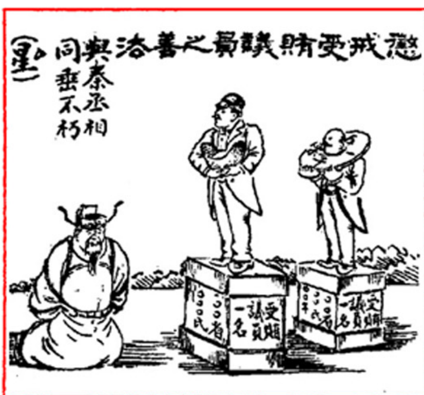
A SHANGHAI VIEW.

This Chinese cartoonist would punish corrupt legislators who sell their votes to office hunters, by immortalizing them in bronze statues, with tablets showing the record of their scandalous transactions.