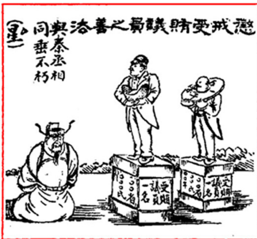
A SHANGHAI VIEW.