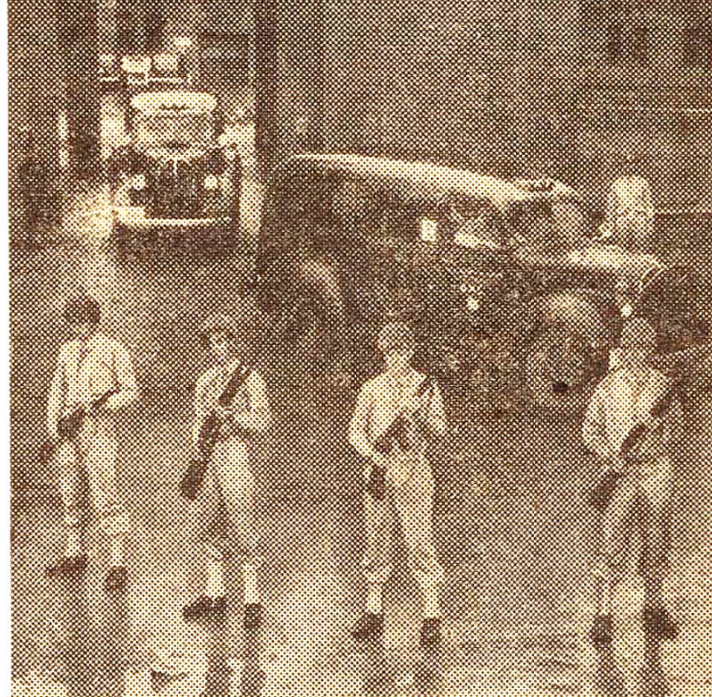
Six Nazi saboteurs, whose bodies are in these Army ambulances, learned that America was waking up quickly.

In 1934, ODWU units throughout the country were asked to register the names of all Ukrainians in this country with a knowledge of aviation, wireless and like talents. A reproduced affidavit lists important bridges, factories and highways photographed by these volunteers.