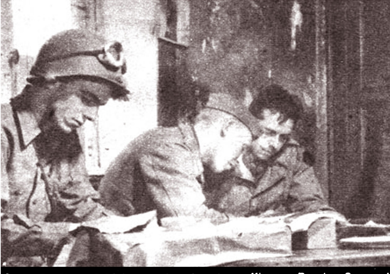
Under the watchful eyes of an American officer, a Russian Corporal sits in a French farmhouse penning a leaflet urging . . .

T HE two young Russians told me that they had been interviewed by "fine American comrade in your uniform who spoke Russian." They were awaiting shipment back to England, from where, they imagined, they would return to Russia. All the prisoners had held a meeting, however, in which they decided to request permission to form a separate battalion to remain on the Western Front and fight the Germans side by side with the Americans. "The Boche," they said, "is less far from here."