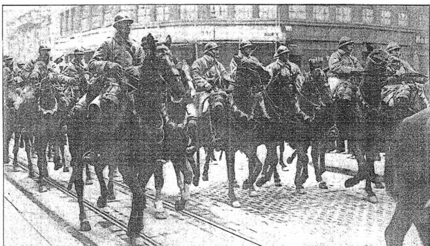
"A MORAL STATE OF WAR."

The advance of French and Belgian troops into the Ruhr valley is considered by the Germans as putting their country in "a moral state of war with France and Belgium," which the Germans will wage with the weapons of "sabotage and inertia."