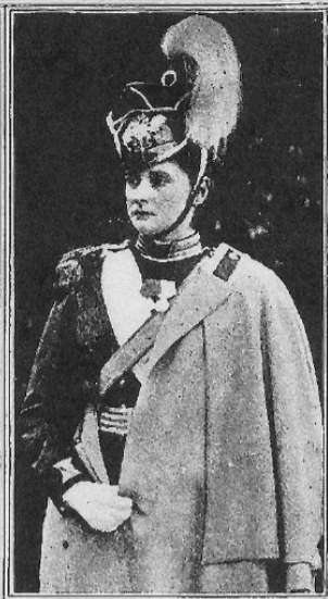
The Czarina, who is a Colonel in no less than four Russian Regiments