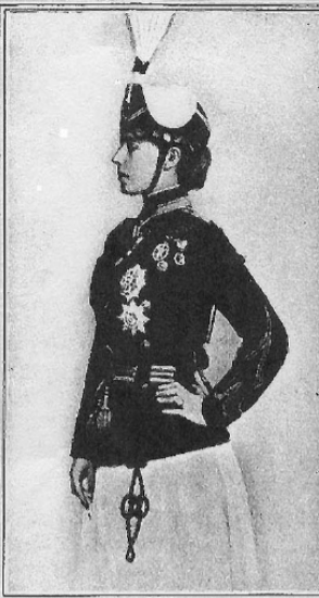
The Crown Princess of Roumania, Col. of the Fourth Roumanian Hussars