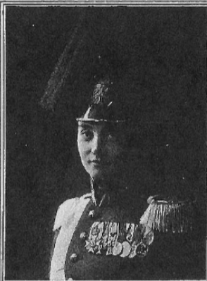
Grand Duchess of Mecklenburg-Schwerin, Col. of the Mecklenburg Dragoons and Imperial House Guards