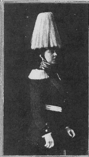
Queen Sophia of Greece, until the war, Col. of Prussian Grenadier Guards