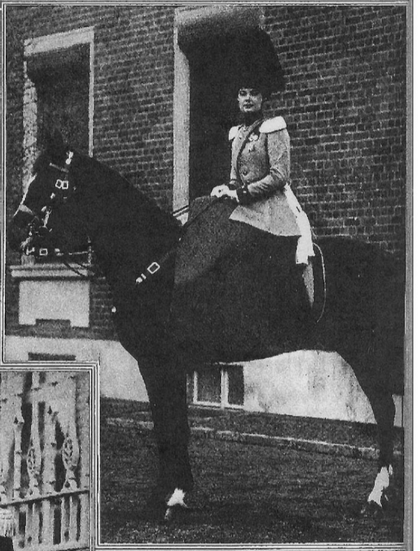
The Crown Princess Cecile of Germany, Col. of the Second Prussian Dragoons