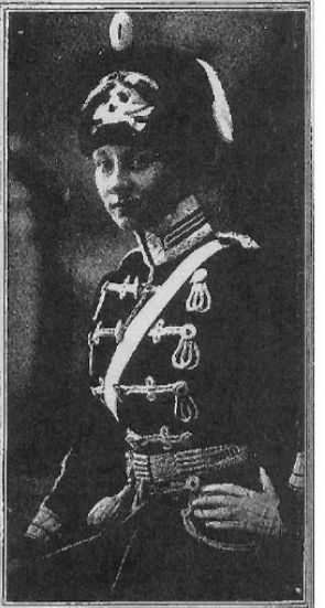
The Duchess of Brunswick, the only daughter of the Kaiser, Col. of the Death's Head Hussars