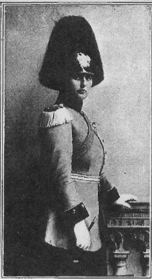
The Princess August-William of Prussia, Col. of the Fourteenth Dragoons