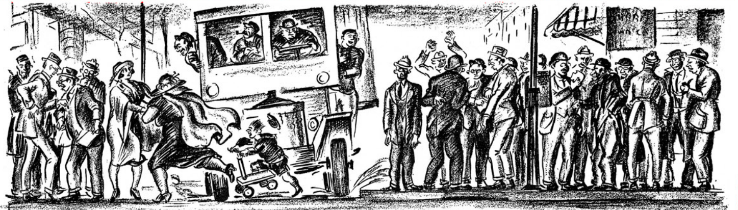
FIFTH AVENUE AT TWENTY-EIGHTH STREET, WHERE THE GARMENT WORKERS, BOLSHEVISTS AND SWEAT-SHOPS ARE FOUND