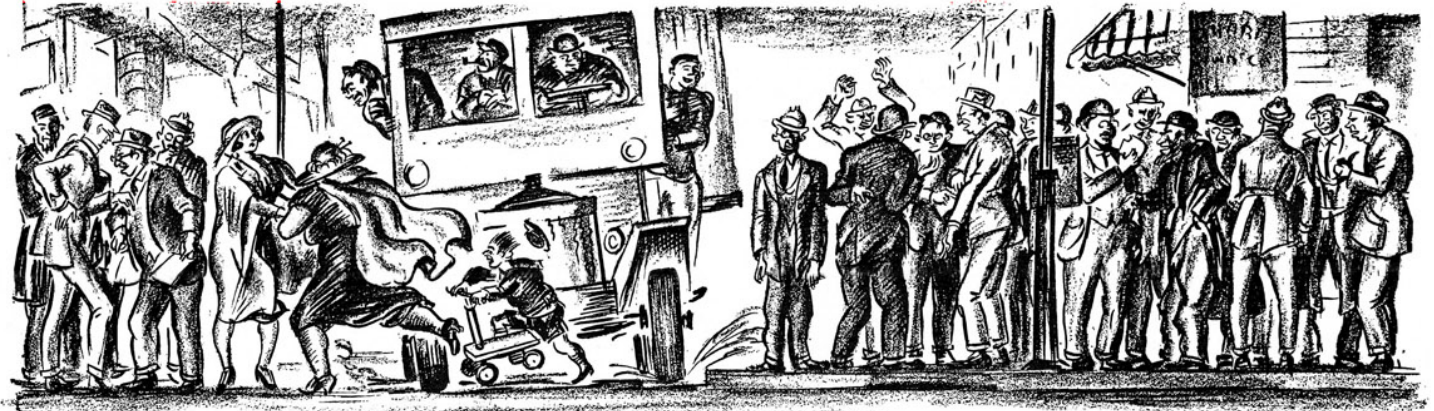
FIFTH AVENUE AT TWENTY-EIGHTH STREET, WHERE THE GARMENT WORKERS, BOLSHEVISTS AND SWEAT-SHOPS ARE FOUND