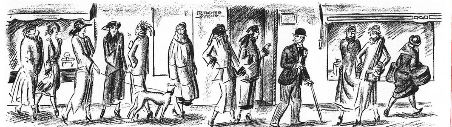
FIFTH AVENUE AT FORTY-EIGHTH STREET, WHICH IS THE HAUNT OF THE MILLINERS AND MIDINETTES