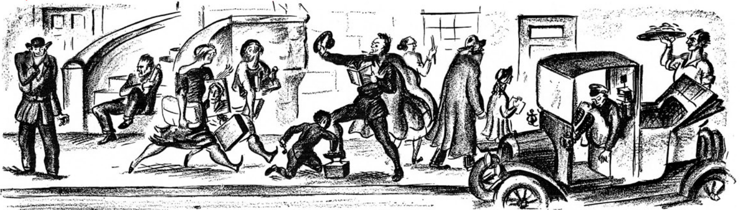
FIFTH AVENUE AT EIGHTH STREET, THE DISTRICT OF BATIKS, ART STUDENTS, TEA-ROOMS, AND FREE VERSE POETS

The thing which makes Fifth Avenue so extraordinary among the famous streets of the world is that it presents a new aspect every half mile or so. Where the Rue de la Paix and Piccadilly preserve their identity throughout, Fifth Avenue shows almost every phase of New York life within a few miles