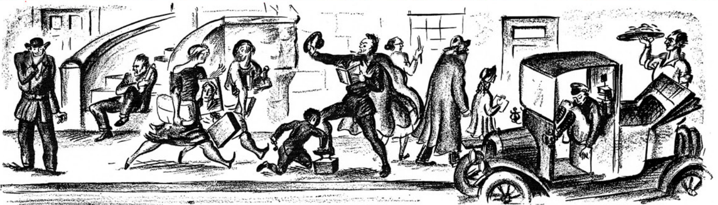
FIFTH AVENUE AT EIGHTH STREET, THE DISTRICT OF BATIKS, ART STUDENTS, TEA-ROOMS, AND FREE VERSE POETS

The thing which makes Fifth Avenue so extraordinary among the famous streets of the world is that it presents a new aspect every half mile or so. Where the Rue de la Paix and Piccadilly preserve their identity throughout, Fifth Avenue shows almost every phase of New York life within a few miles