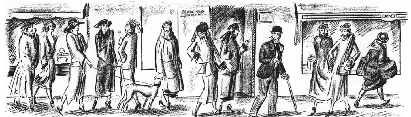
FIFTH AVENUE AT FORTY-EIGHTH STREET, WHICH IS THE HAUNT OF THE MILLINERS AND MIDINETTES