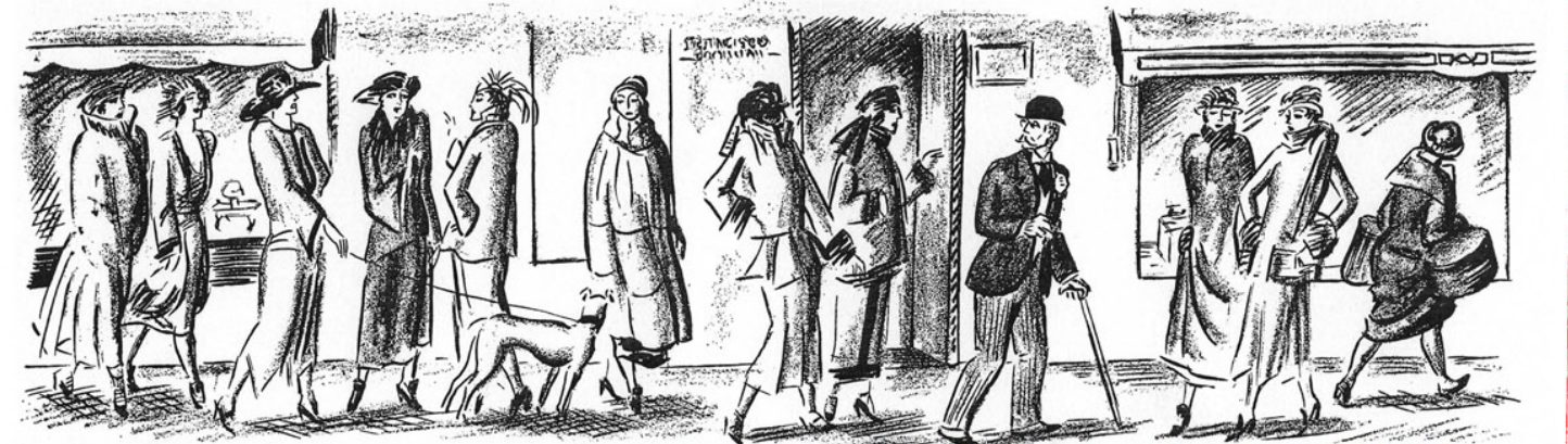
FIFTH AVENUE AT FORTY-EIGHTH STREET, WHICH IS THE HAUNT OF THE MILLINERS AND MIDINETTES