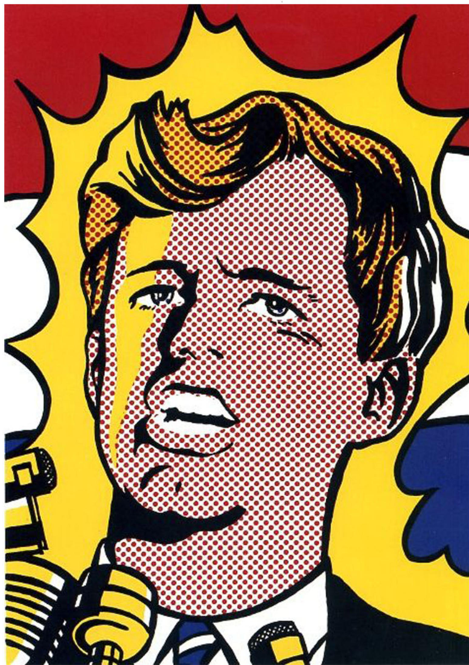
RFK by Roy Lichtenstein

Mark Hatfield. Who knows how many pretenders to the throne we may see months from now, let alone in another four years?