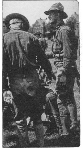
HAMILTON FISH, JR. (top left) a familiar figure in society and on the football fields of past years, in the new rôle of a militiaman