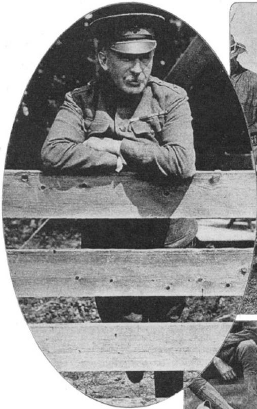
MAJOR-GENERAL LEONARD WOOD watching, with every evidence of satisfaction, his new apprentices to the trade of war

has shown that American officers have made good use of lessons taught by the War, and have adapted their tactics to conform to modern exigencies. Finally, the Plattsburg camp has grounded a large number of intelligent Americans in the rudiments of warfare.