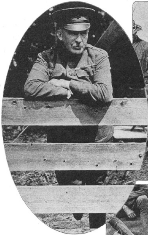
MAJOR-GENERAL LEONARD WOOD watching, with every evidence of satisfaction, his new apprentices to the trade of war

has shown that American officers have made good use of lessons taught by the War, and have adapted their tactics to conform to modern exigencies. Finally, the Plattsburg camp has grounded a large number of intelligent Americans in the rudiments of warfare.