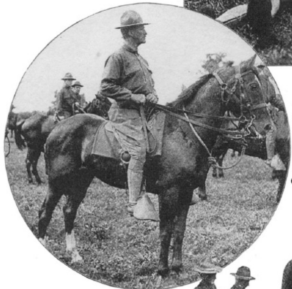
ROBERT BACON former Ambassador to France, who was promoted from the ranks to the position of First Sergeant