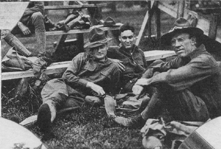
MAYOR JOHN PURROY MITCHELL of New York, snatching a moment's rest in one of the brief breathing spells in the day's work