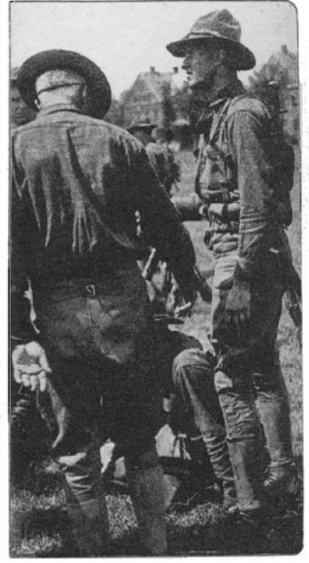
HAMILTON FISH, JR. (top left) a familiar figure in society and on the football fields of past years, in the new rôle of a militiaman