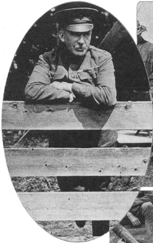
MAJOR-GENERAL LEONARD WOOD

has shown that American officers have made good use of lessons taught by the War, and have adapted their tactics to conform to modern exigencies. Finally, the Plattsburg camp has grounded a large number of intelligent Americans in the rudiments of warfare.