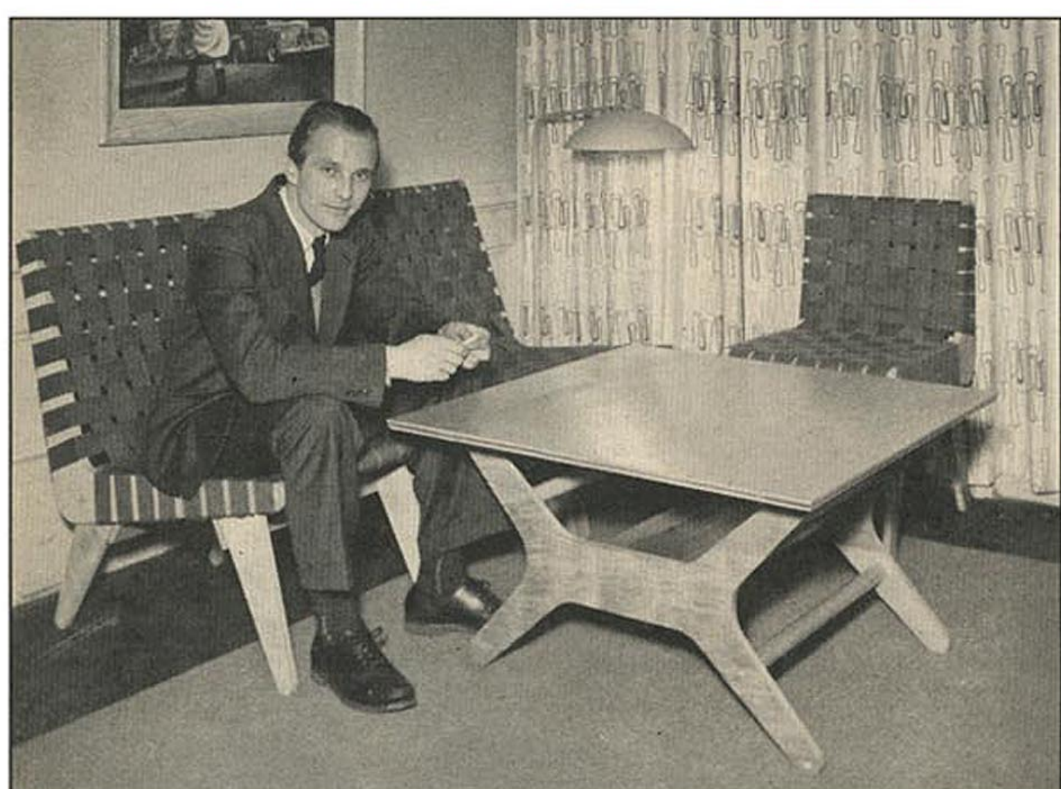
Designer and designs. Grabe displays living room chairs, the convertible table . . .

Because some women once wanted something good for practically nothing, people now can buy a set of neat, modern living and dining room furniture for less than $200.