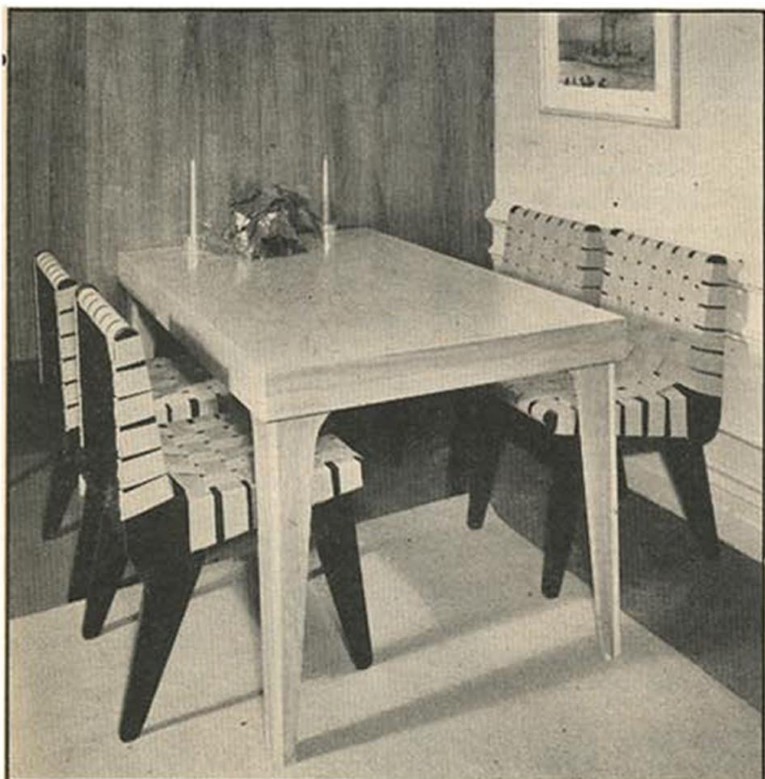
. . . dining room table and chairs

Like That! So many people wanted the table and chairs that Grabe became the man-with-the-furniture-pattern-business. He kept adding new designs. And now there are 23 of which some 40,000 have been sold, at 75¢ apiece.