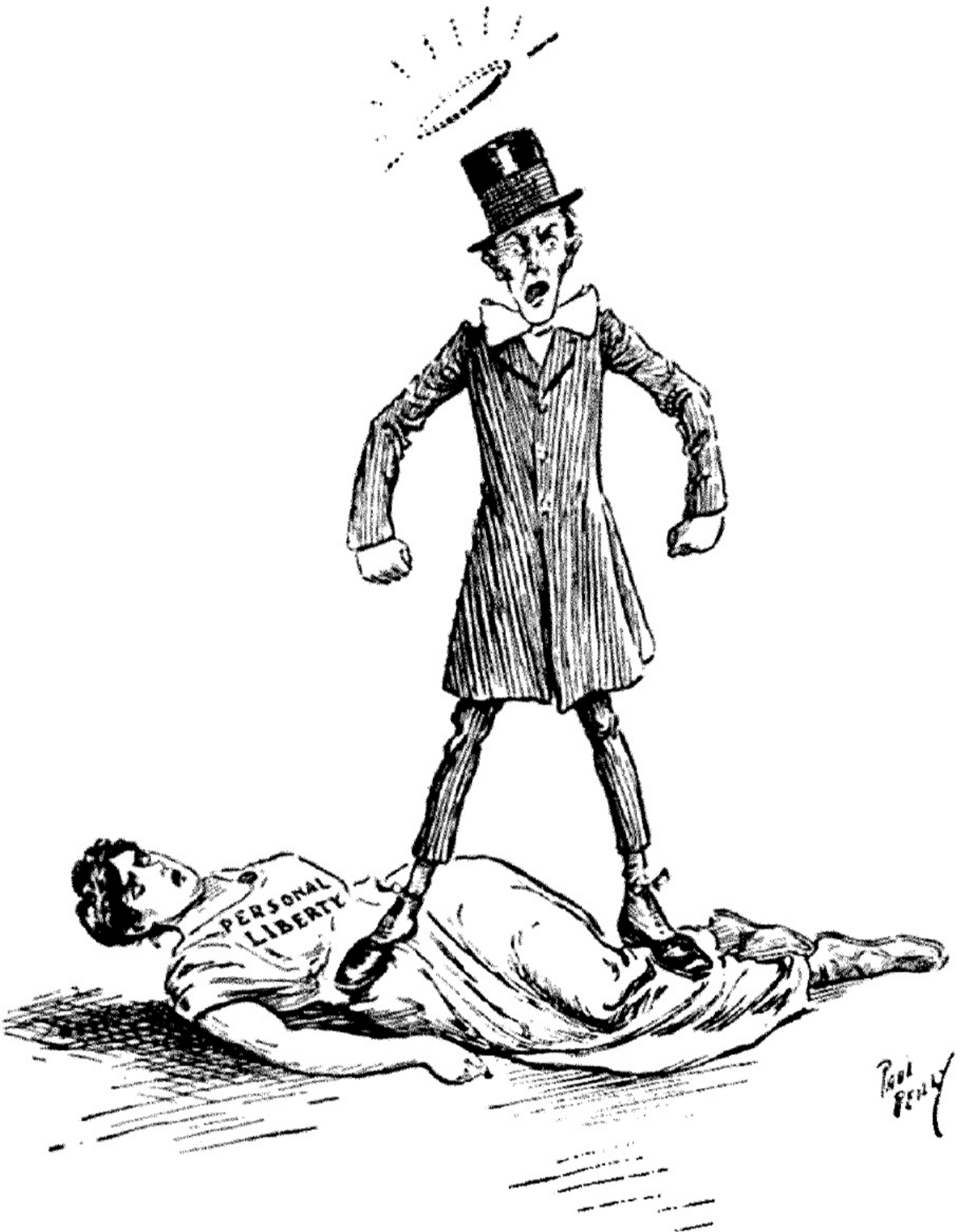
The Prohibitionist: WHAT ARE YOU GOING TO DO ABOUT IT?