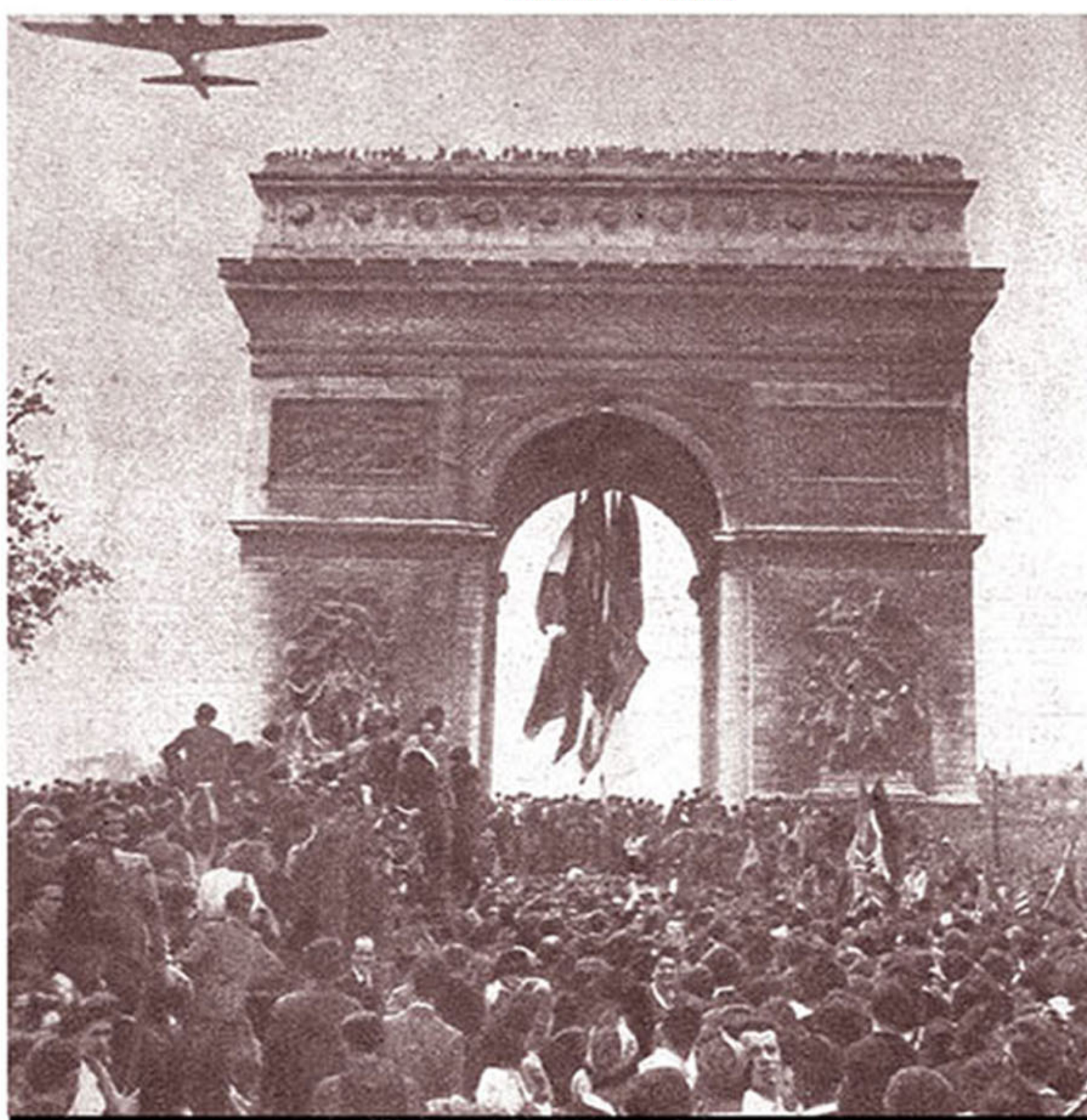
A Fortress buzzes the Arc as crowds gather to pay respects to Unknown Soldier

liberated by the Seventh Army and was now back home, one of 8,000 Frenchmen being repatriated daily. He looked thin but said he was rapidly gaining weight.