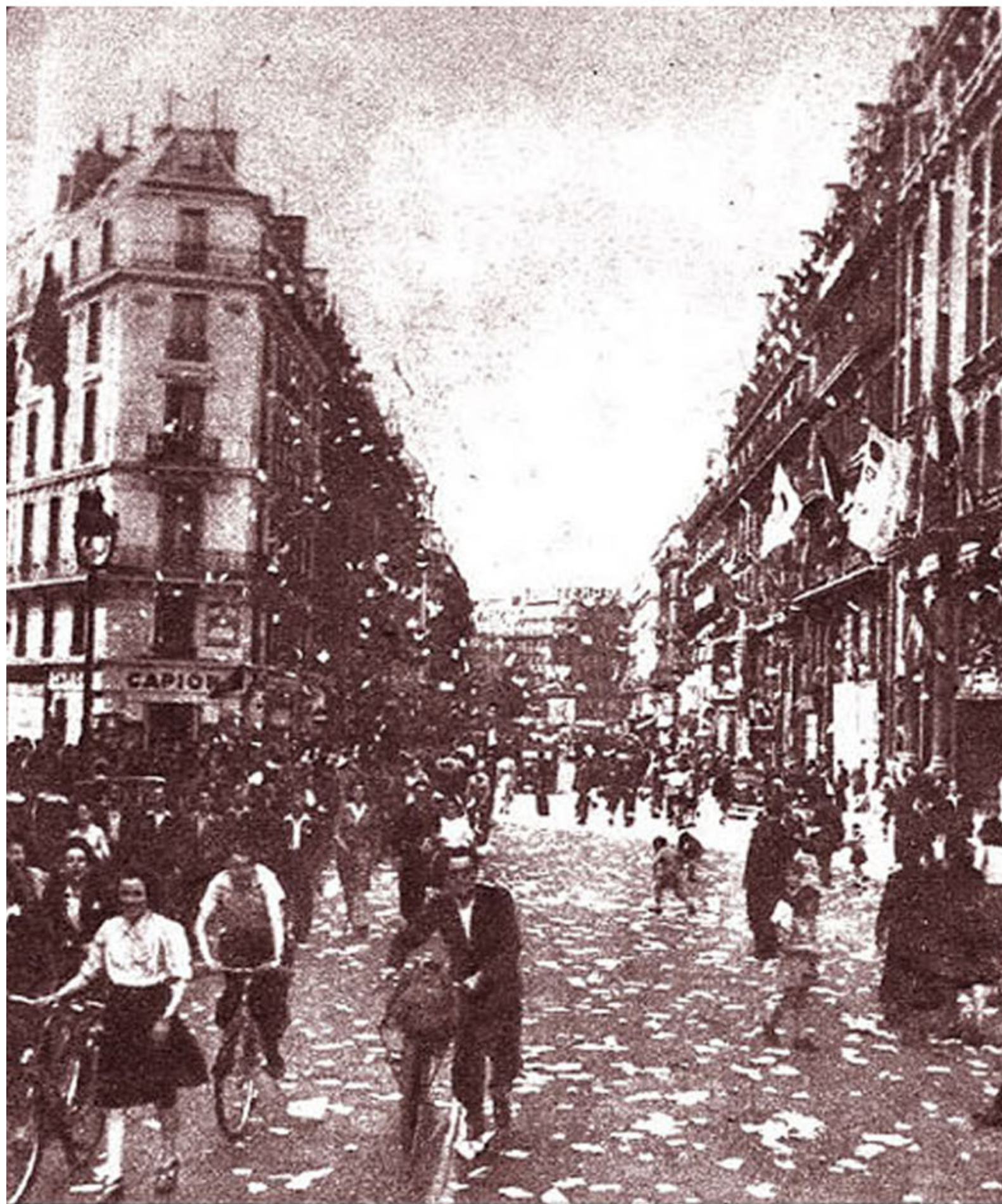
Ticker tape and telephone books drop into Paris streets near the Opera after 3 P.M.

It wasn't as exciting as Liberation Day, but all over the city people sang, kissed each other and paraded through the streets.