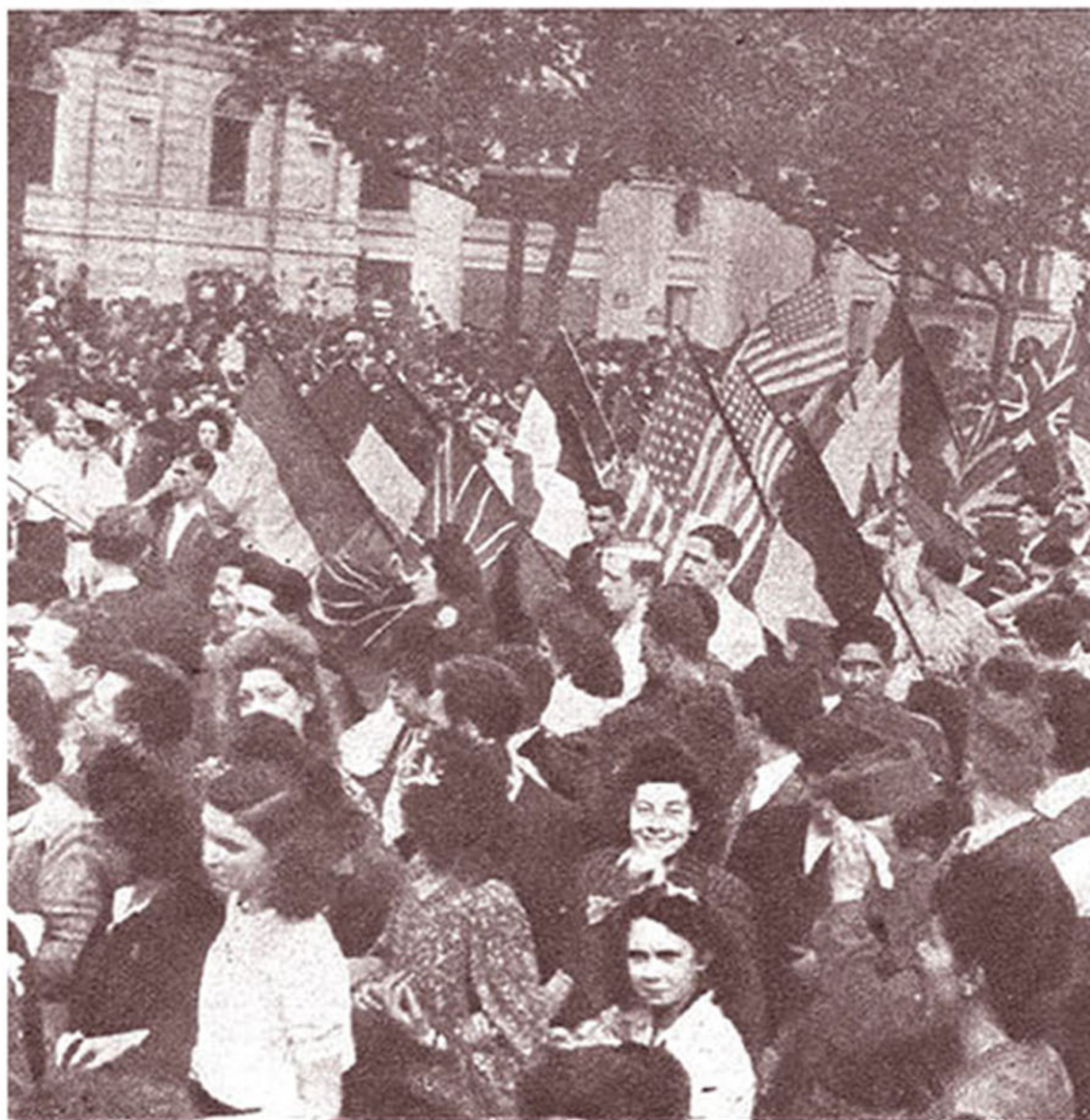
One of hundreds of student parades that jammed the Champs Elysees all V-E Day.

"Vive le President. Vive la Republique. Vive la France," the crowd replied.