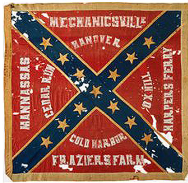
The Flag of the N.C. 18th Reg.

If Longstreet, with his very fine corps, had struck the Federals early the next morning, there probably never would have been a third day at Gettysburg.