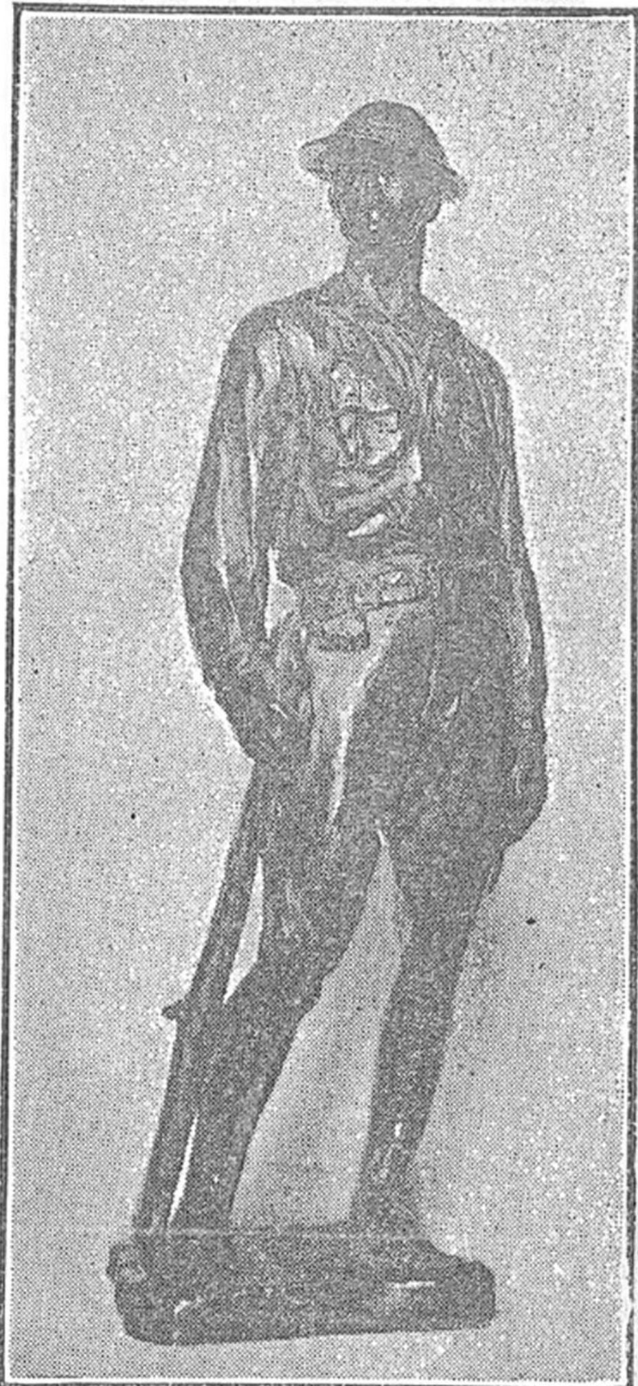
"The American Doughboy," by Jo Davidson, to be unveiled at Suresnes cemetery, near Paris, on Memorial Day

They are still shoulder to shoulder in their khaki lines, trudging the Ar-