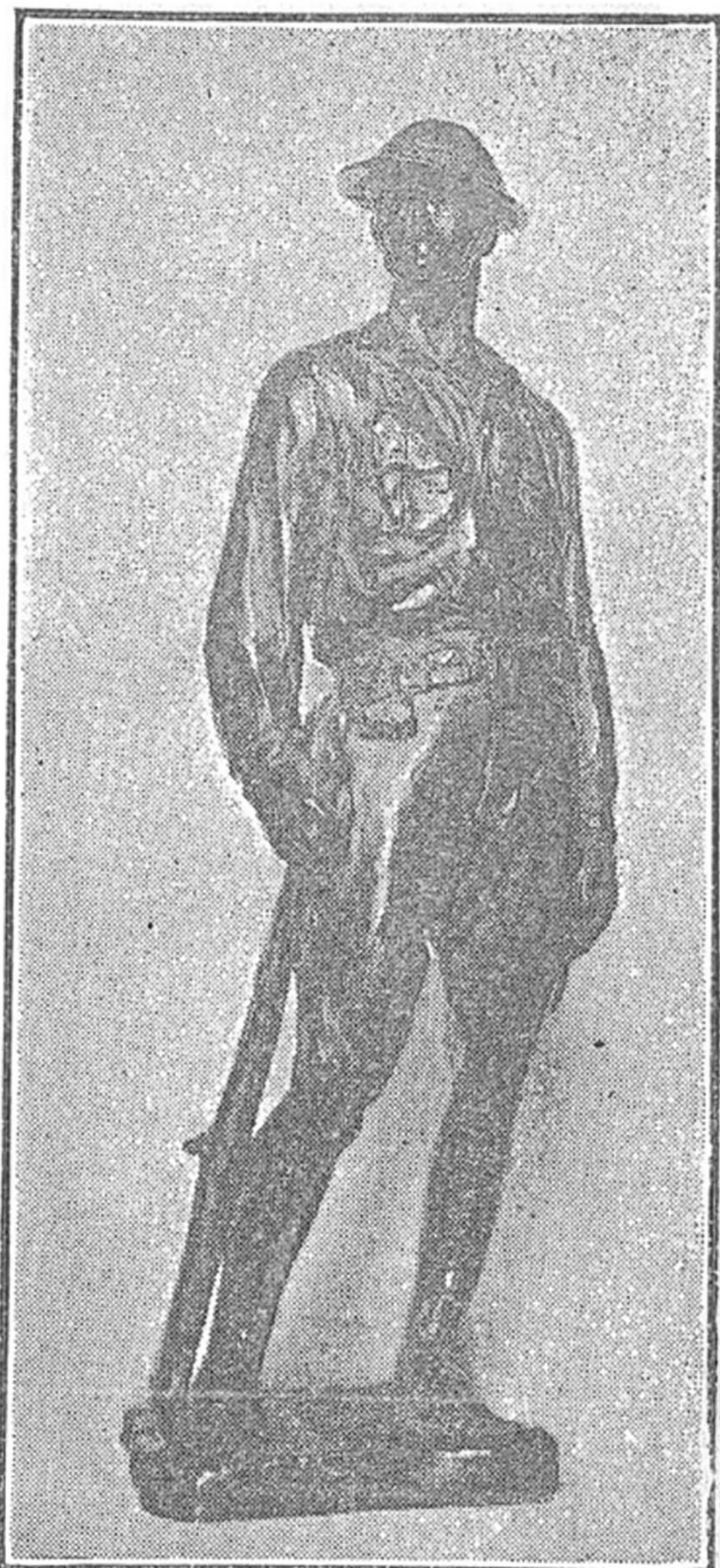
"The American Doughboy," by Jo Davidson, to be unveiled at Suresnes cemetery, near Paris, on Memorial Day

They are still shoulder to shoulder in their khaki lines, trudging the Ar-