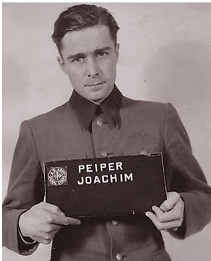
Joachim Peiper (1915 - 1976)

One American medic got up to bandage the wounds of a seriously injured man from his own company-aid unit. The Nazis permitted him to finish the work, shot both him and the patient.