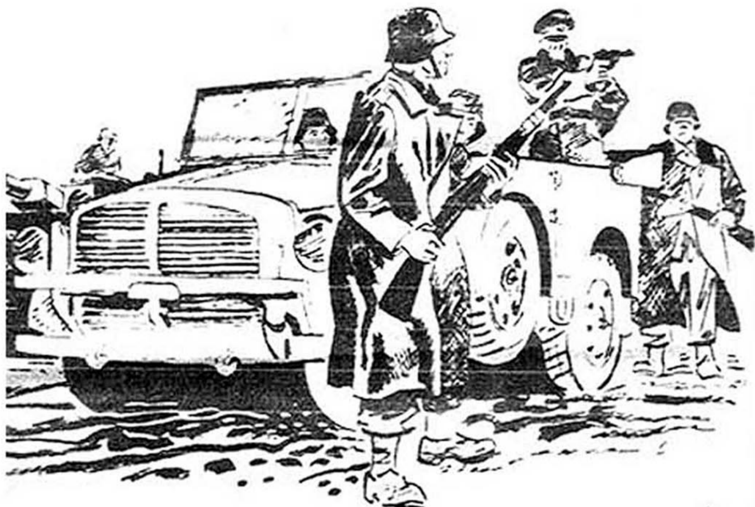
The German officer in the car stood up and took deliberate aim with a pistol.

make the attempt until midnight, after lying in snow for 11 hours or longer.