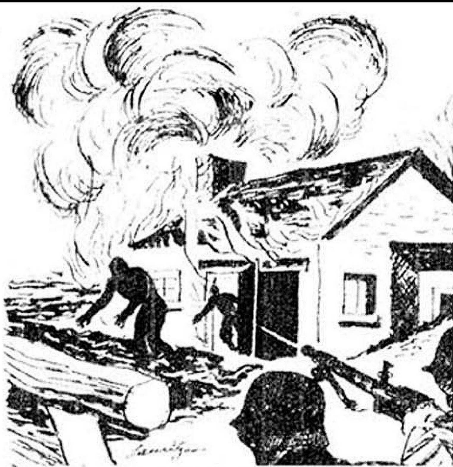
The burning building was covered by German guns