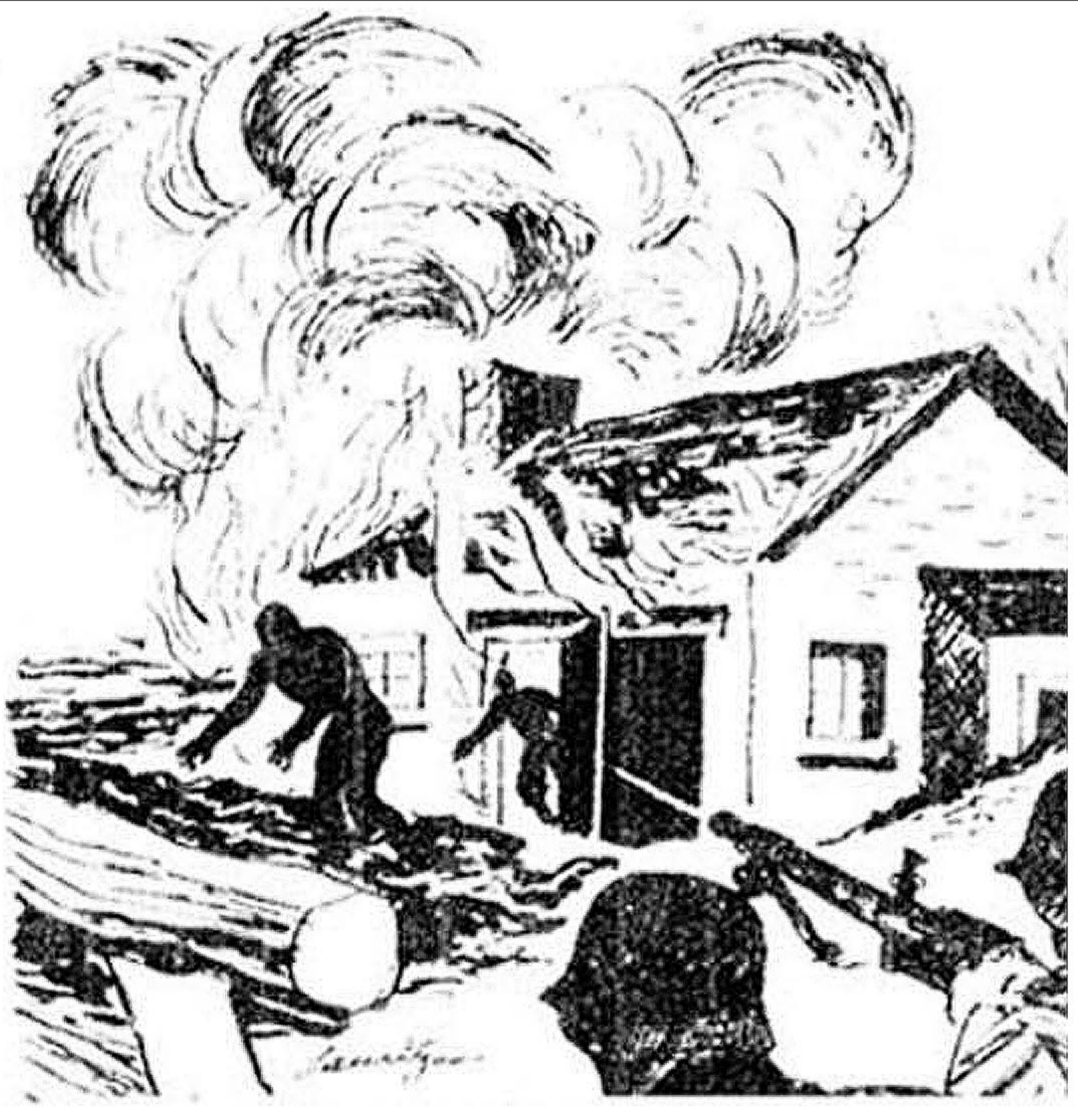
The burning building was covered by German guns