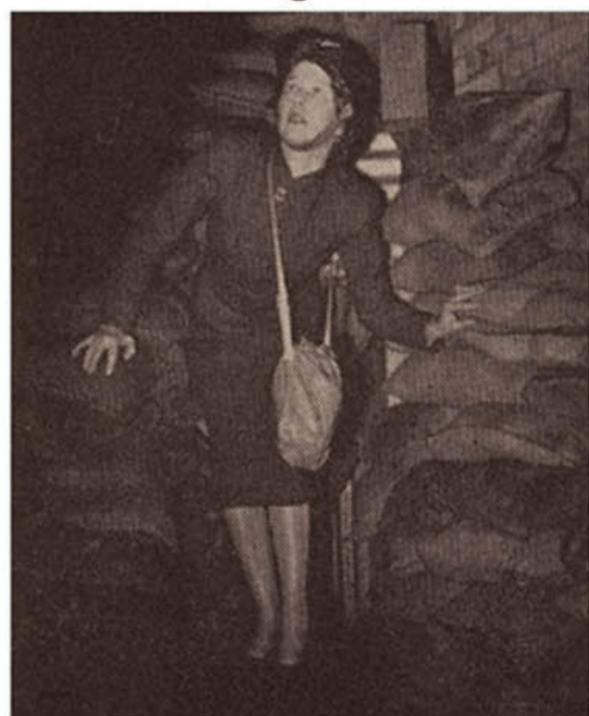
WENDY HILLER IN THE MOVIE