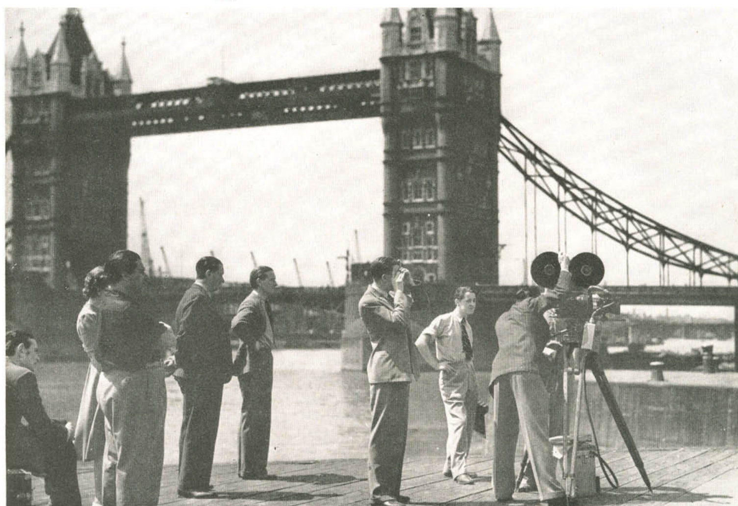
B y London's famous Tower Bridge, Gabriel Pascal (standing at left) shoots a scene of Major Barbara , starring Wendy Hiller and Robert Morley, while the sky is still clear of bombers. This area, around the Thames docks, got the worst bombing of any part of London.

T HE British may have tea during air-raids and dress for dinner in bomb shelters, but for sheer British composure we give you Mr. Gabriel Pascal, who is calmly making a movie at Denham outside London. Mr. Pascal, a Briton out of Budapest, is the producer who, by virtue of making Pygmalion , enjoys a monopoly of the film rights to Shaw's plays. He started shooting last August on Shaw's Major Barbara and, come bombs or parachutists, he intends to finish it. These pictures, exclusive to STAGE, show some of his problems and the following notes, from a diary kept by a member of the cast, tell others: