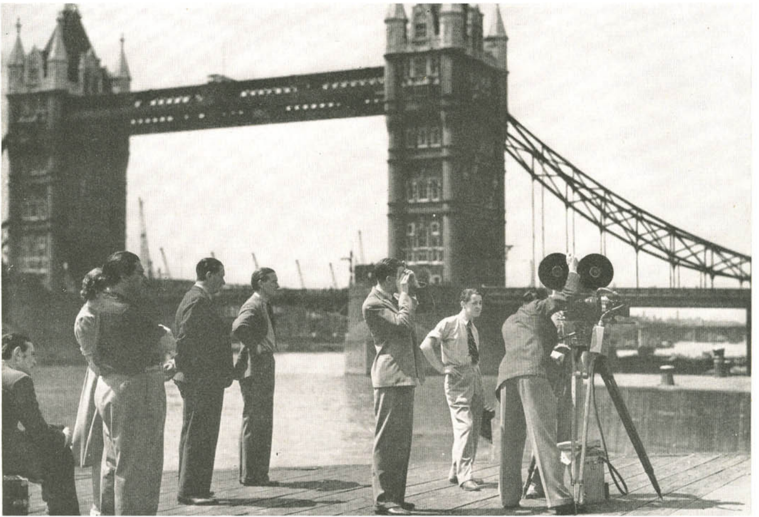
B y London's famous Tower Bridge, Gabriel Pascal (standing at left) shoots a scene of Major Barbara , starring Wendy Hiller and Robert Morley, while the sky is still clear of bombers. This area, around the Thames docks, got the worst bombing of any part of London.

T HE British may have tea during air-raids and dress for dinner in bomb shelters, but for sheer British composure we give you Mr. Gabriel Pascal, who is calmly making a movie at Denham outside London. Mr. Pascal, a Briton out of Budapest, is the producer who, by virtue of making Pygmalion , enjoys a monopoly of the film rights to Shaw's plays. He started shooting last August on Shaw's Major Barbara and, come bombs or parachutists, he intends to finish it. These pictures, exclusive to STAGE, show some of his problems and the following notes, from a diary kept by a member of the cast, tell others: