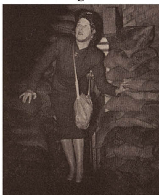
WENDY HILLER IN THE MOVIE