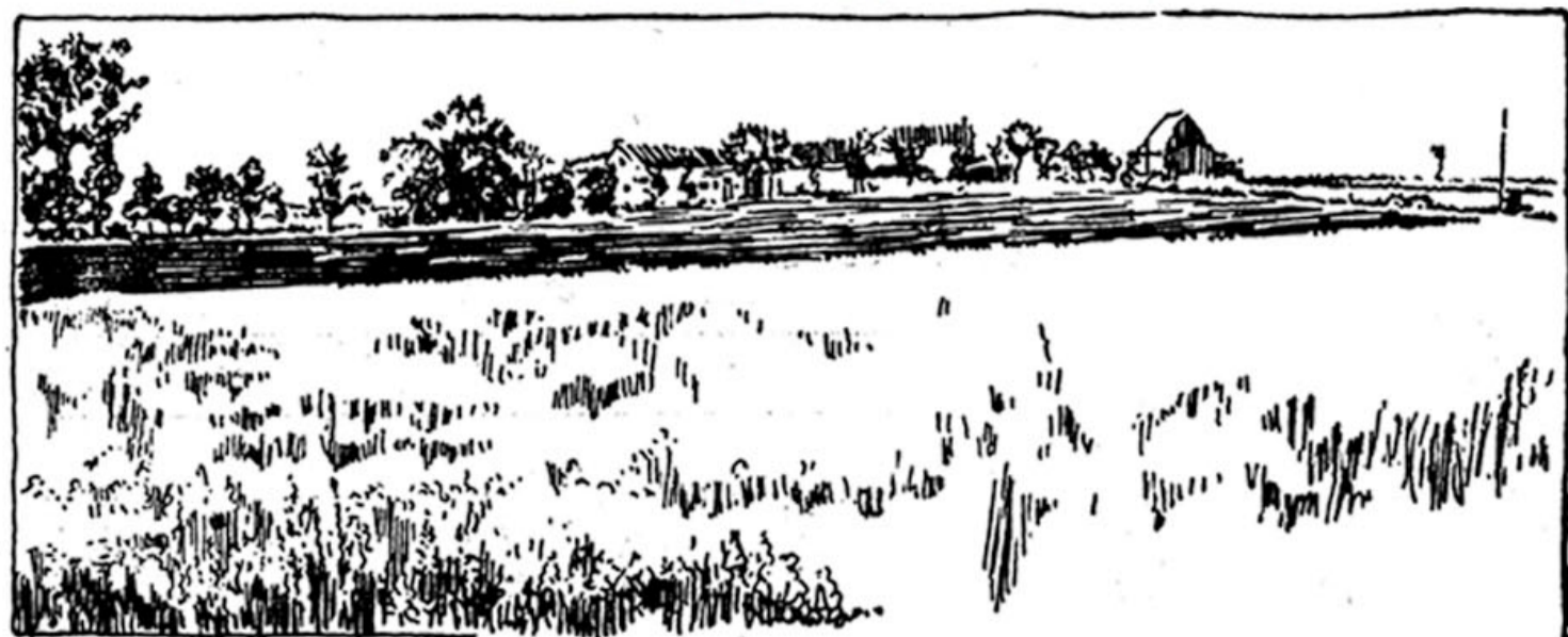
Les Mares Farm and the wheatfields of the fighting—drawn from a photograph

rushed the guns. In the final rush Corporal Dockx and one other man were killed, but the guns were taken and along with them the only members of the gun crews who were still alive. All the prisoners were wounded and of the original German squad of 30 men only five reached their lines in safety.