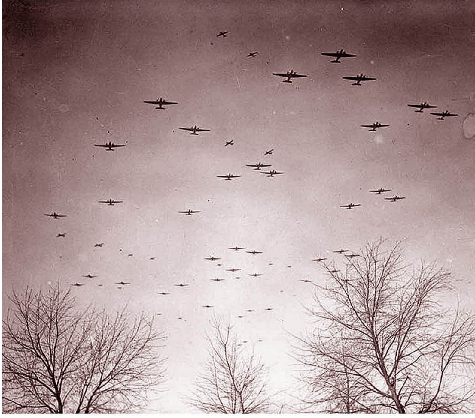
In the skies over Germany a small part of the 5,000 plane armada roars en route to Wesl, where 5,814,000 pounds of men and guns and equipment were dropped in an area two miles by three miles.

bling out of the C-47s, their green camouflage chutes blending with the dark gray ground. The troop-carrier serial seemed like a snail, leaving a green trail as it moved along. And it was crawling indeed—about 115 miles an hour. Our big Fort seemed to me to be close to stalling speed.